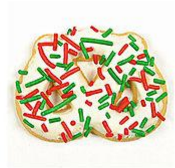
Christmas Cookies (Left to right, top to bottom : Eggnog Cookie, Candy Cane Cookie, Snowman Cookie, Vanilla Santa, Shortbread Wreath, Pfeffernüsse, Cherry Snowflake and Holiday Pretzel)