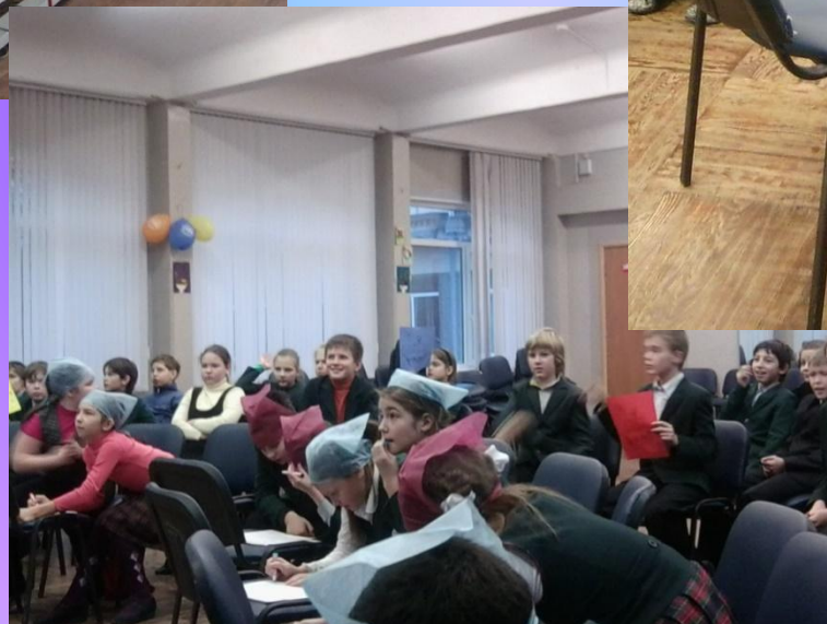
Внеурочная деятельность. Моя педагогическая инициатива.