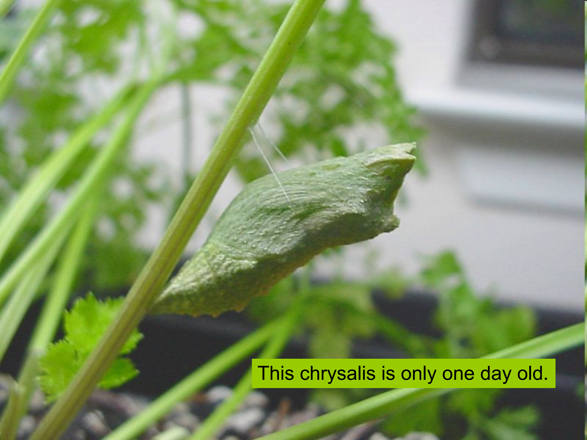
This chrysalis is only one day old.