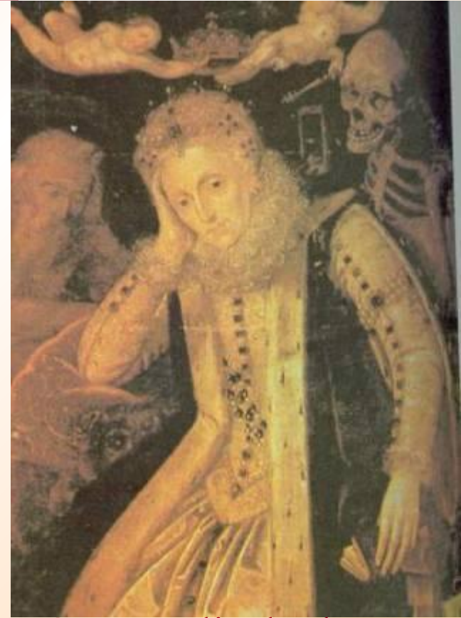
«Queen Elizabeth. Time and death». 1600

«All the mechanism of my rule is in breaking » - from the letter of Elizabeth I to Henry IV, the King of France.