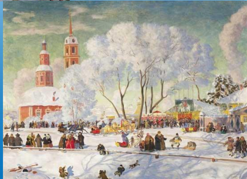
B.Kustodiev "Shrovetide" (1920)