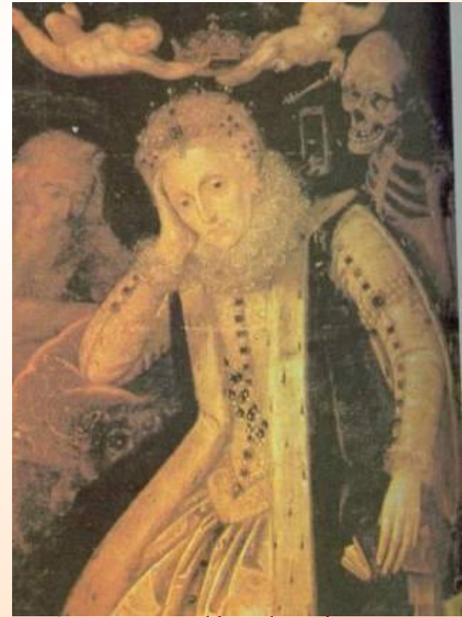
«Queen Elizabeth. Time and death». 1600

«All the mechanism of my rule is in breaking » – from the letter of Elizabeth I to Henry IV, the King of France.