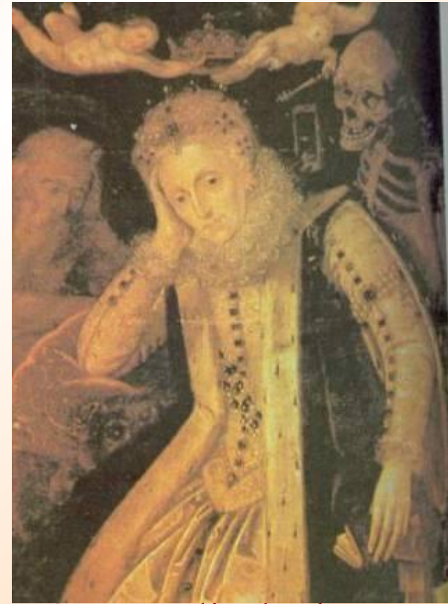
«Queen Elizabeth. Time and death». 1600

«All the mechanism of my rule is in breaking » – from the letter of Elizabeth I to Henry IV, the King of France.