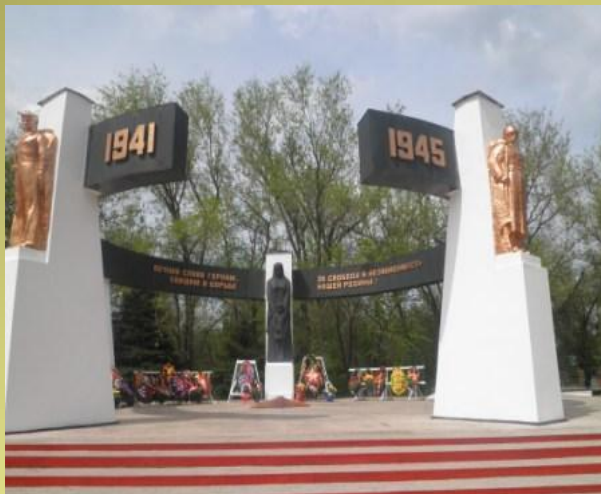
The monument “Nobody is forgotten”