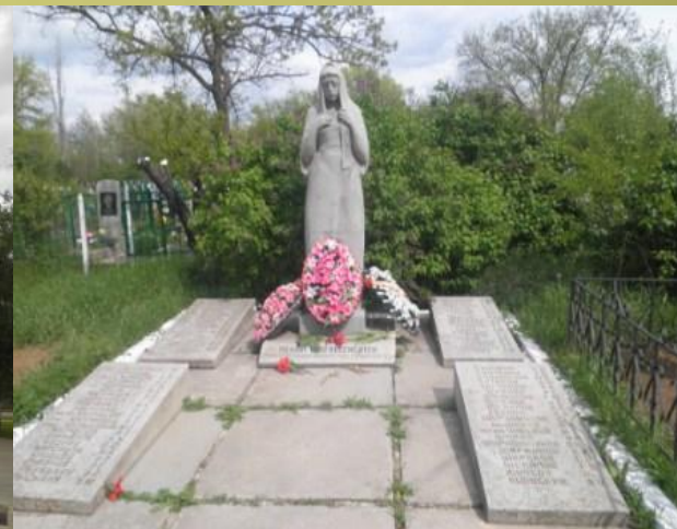
The monument- symbol of all MOTHERS