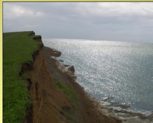
Manych Gudilo Lake