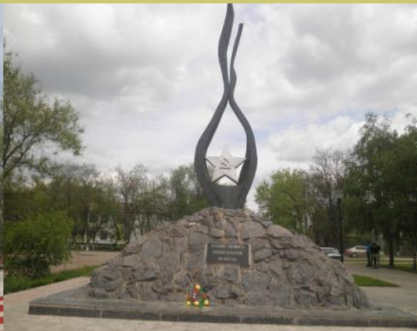
The monument to Afgan soldiers