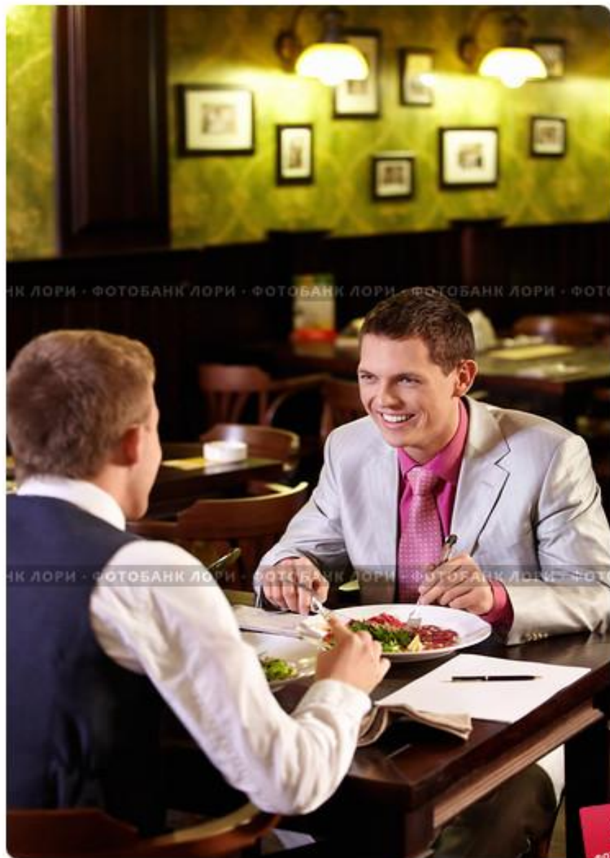
Двое мужчин обедают в ресторане