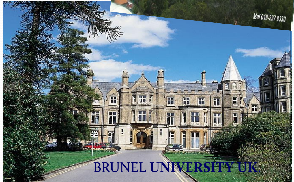
BRUNEL UNIVERSITY UK