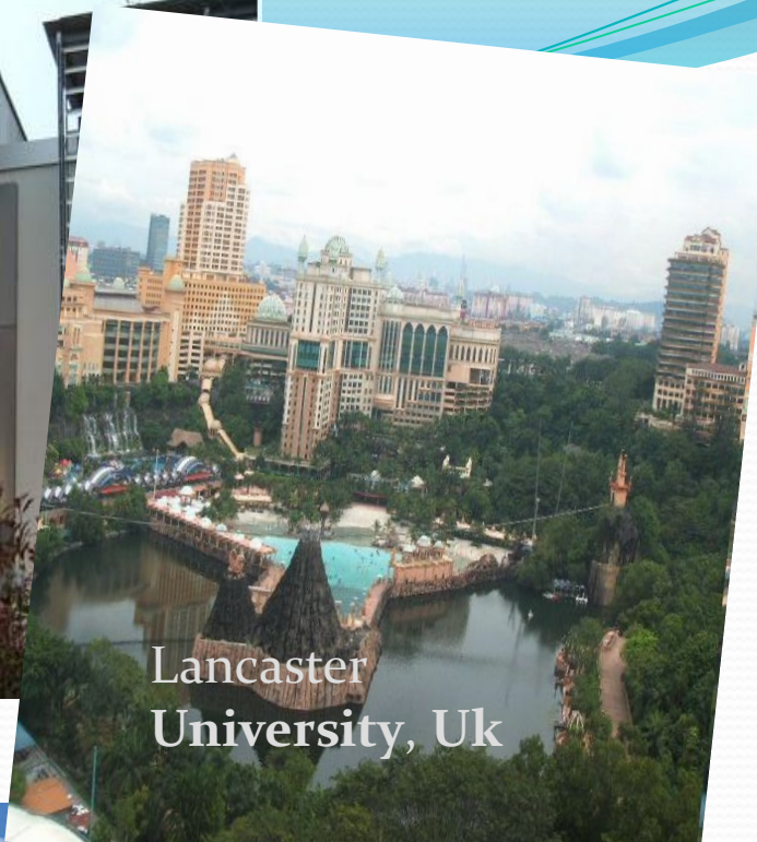
Lancaster University, UK