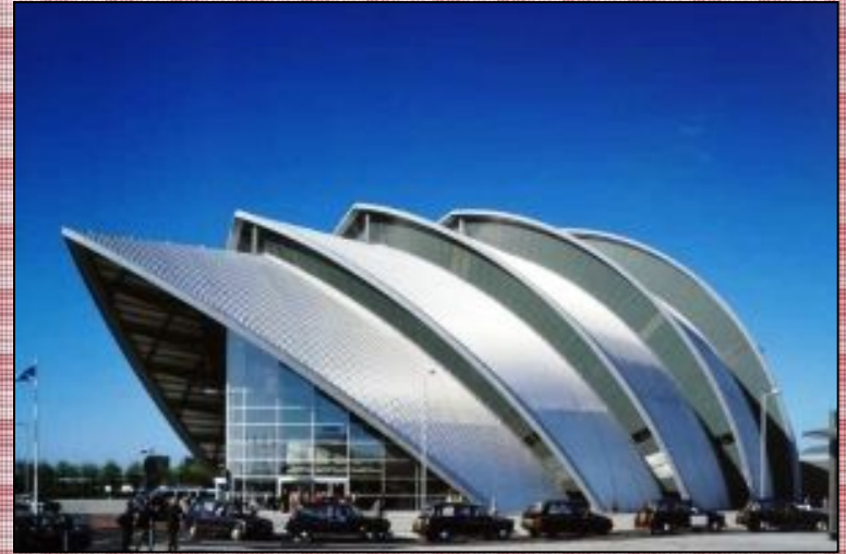
Scottish Exhibition & Conference Center