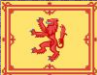
Royal Standard of Scotland