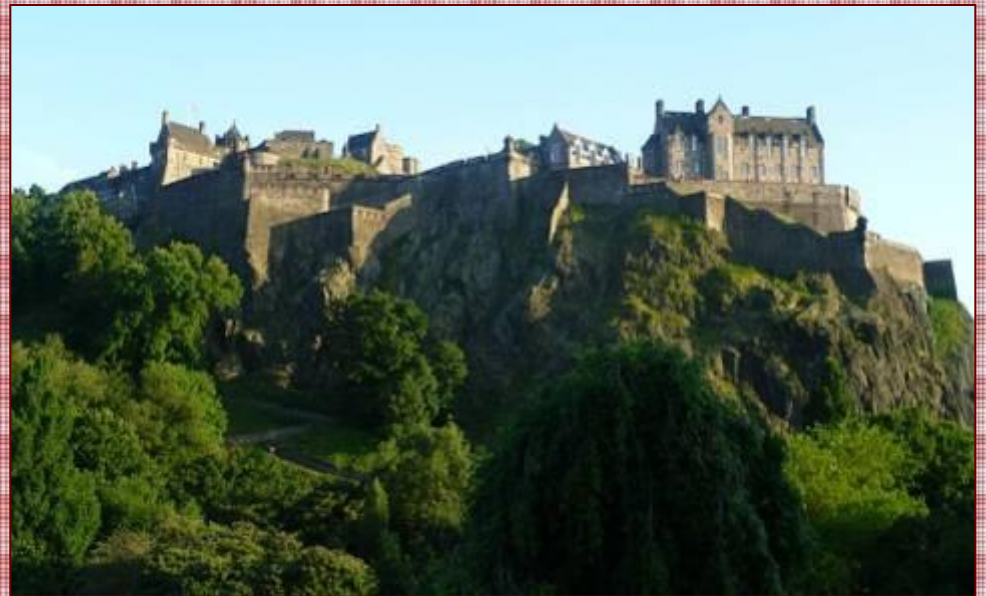
□ The Castle seen from the North.