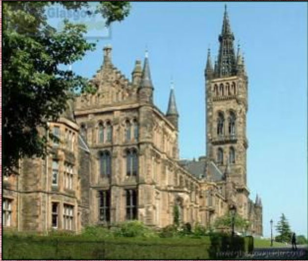
Glasgow International College