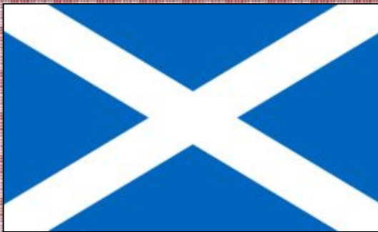
flag of Scotland