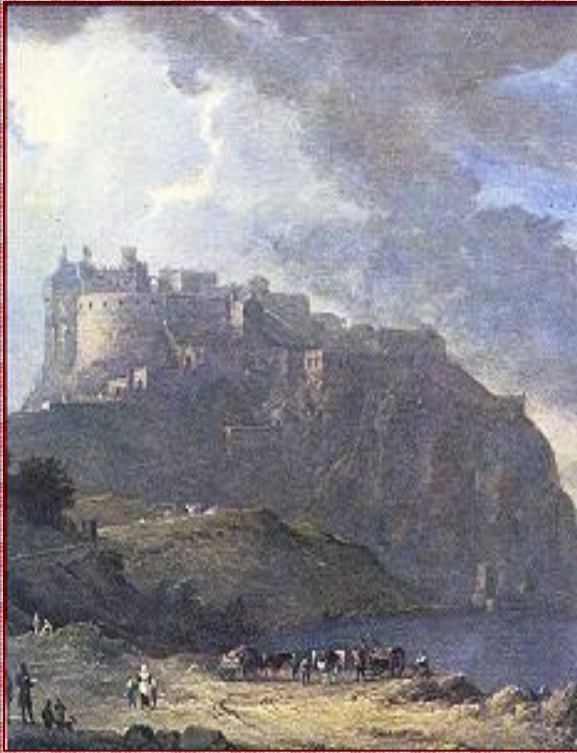
□ Edinburgh Castle with the Nor Loch in foreground.