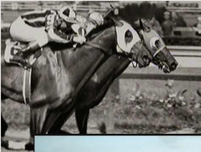
Photo left - photo realistic Admiral and Seabiscuit. A photo on the right and bottom - photos from the film, shot on real events. The film's title - «Seabiscuit». Rusk in red the form with a symbol of the letter «H».