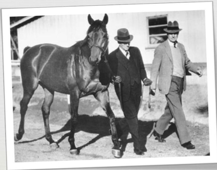
Seabiscuit, Smith and Howard.

□ Yet Howard allowed of John to participate in the races. Alas, they came only third, but it was a great result for the two injured friends. It was the last race for Seabiscuit.