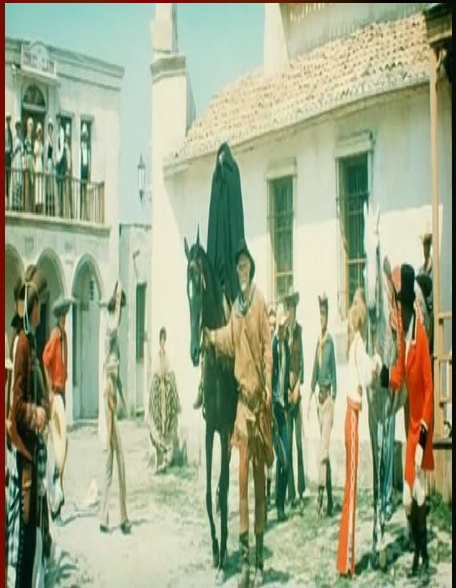
“The Headless Horseman”