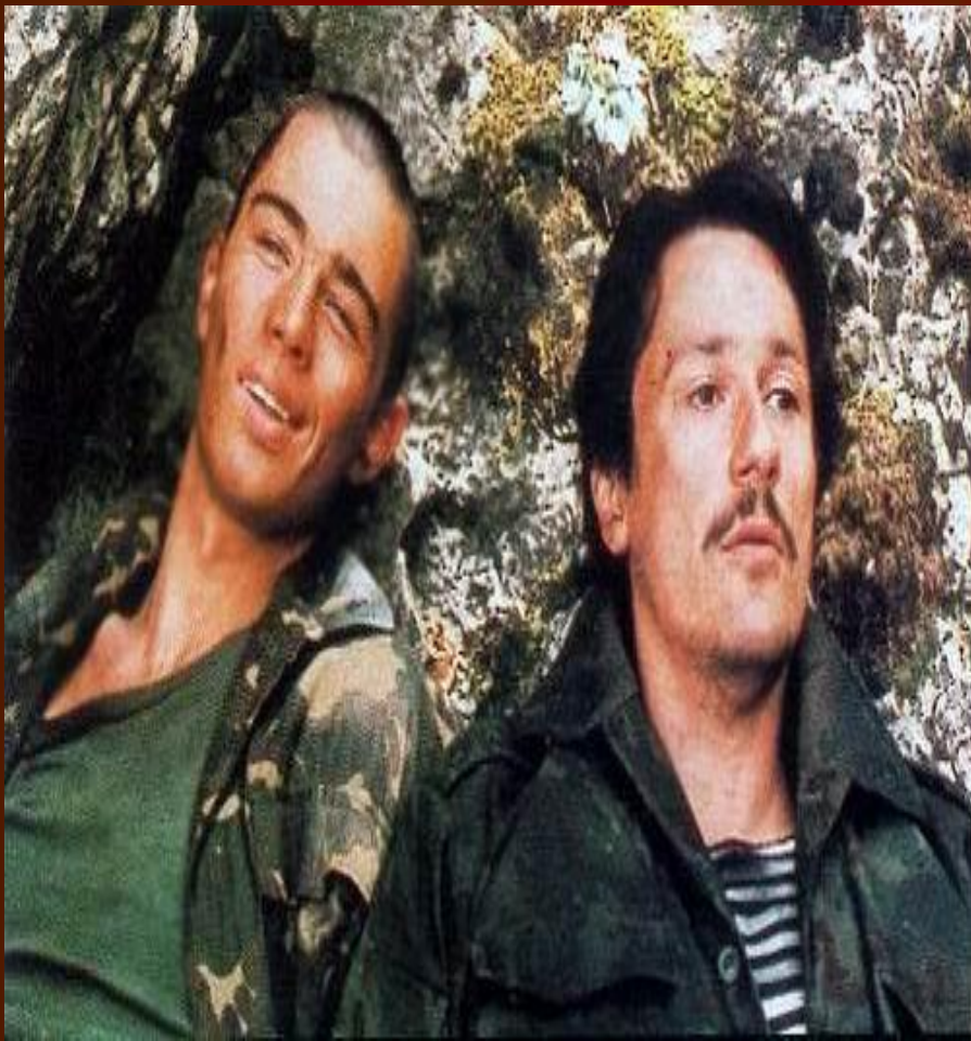
“The Captive of the Caucasus”