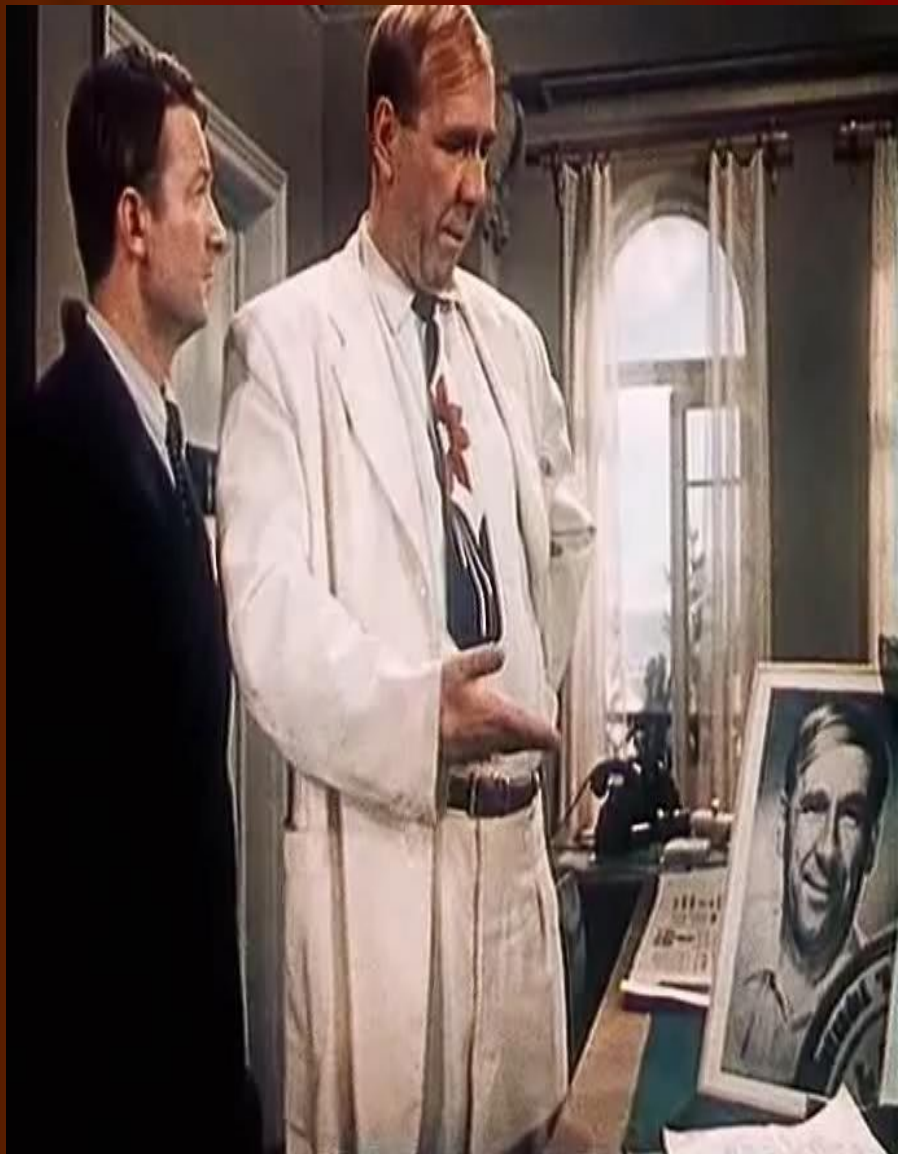
“The Dead Groom”