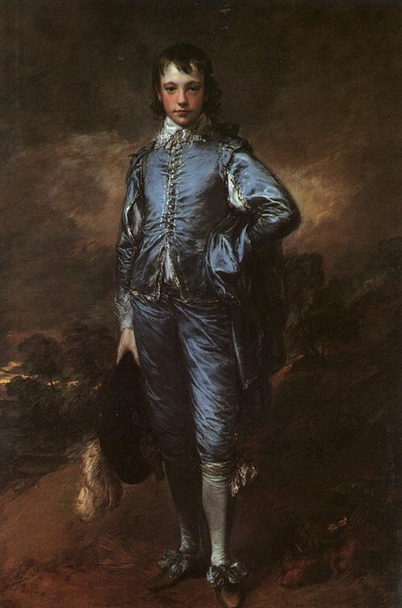
Гейнсборо Джонатан Баттл (Мальчик в голубом). Ок. 1770