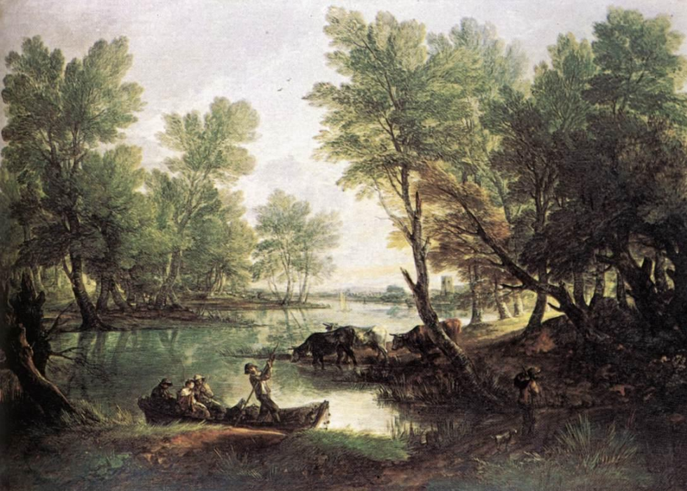
Гейнсборо Речной пейзаж 1768-70