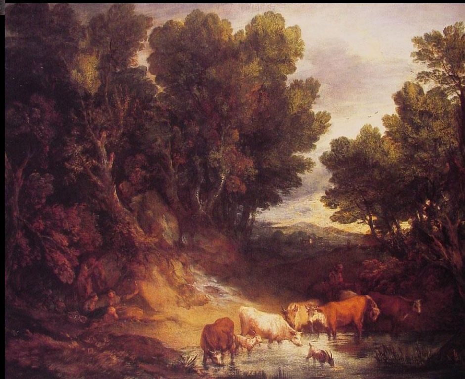
Гейнсборо Водопой 1777