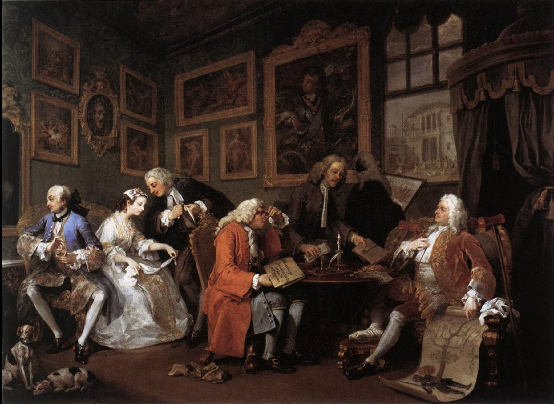
Уильям Хогарт Модный брак Сцена I. 1743-45