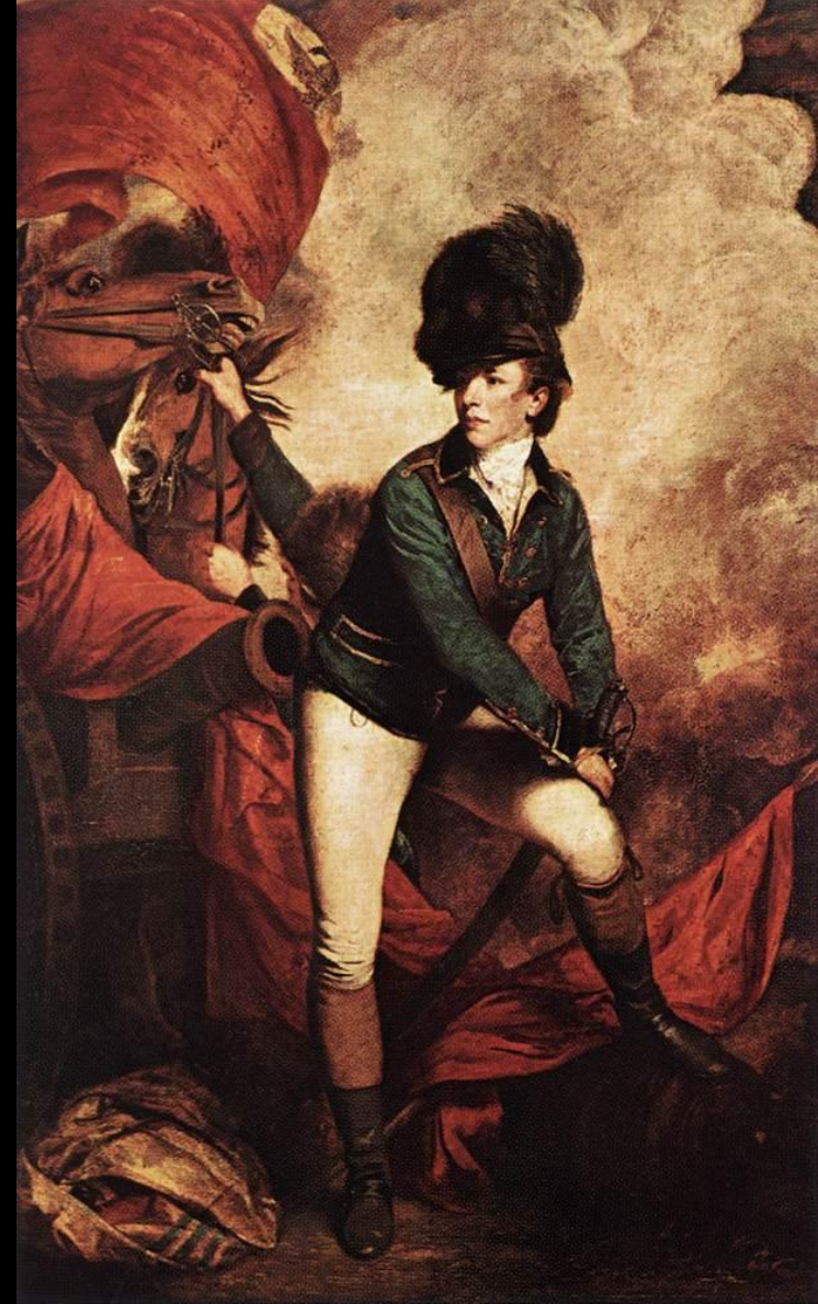
Рейнолдс. Полковник Тарлетон. 1782