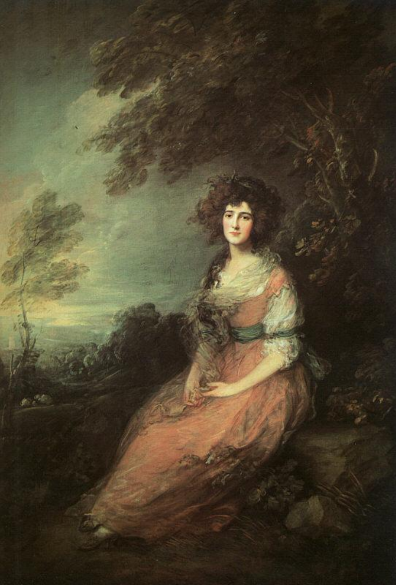
Гейнсборо Миссис Ричард Бринсли Шеридан. 1785-86