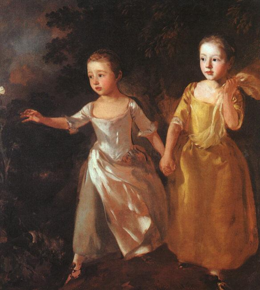
Томас Гейнсборо Дочери художника 1756