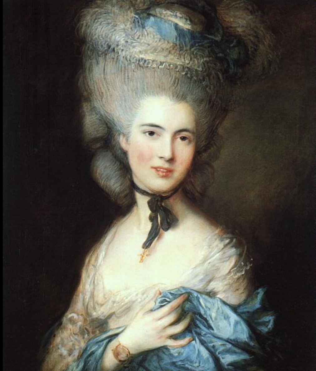
Гейнсборо Дама в голубом 1777-79