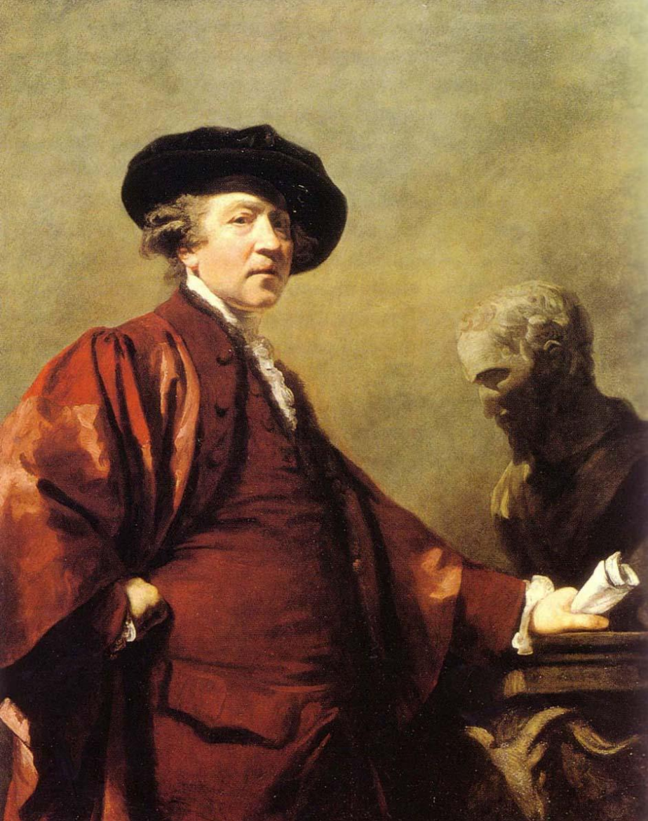
Автопортрет в костюме оксфордского профессора 1773