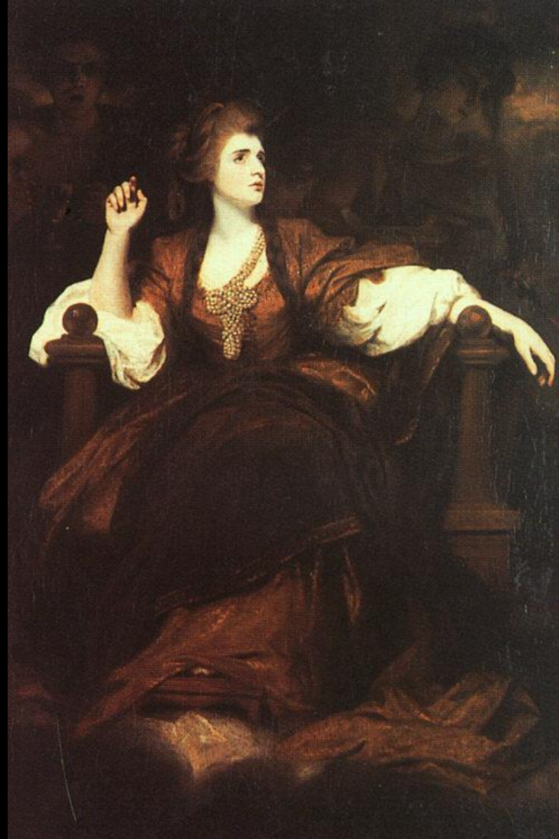
Рейнолдс Сара Сиддонс как муза трагедии