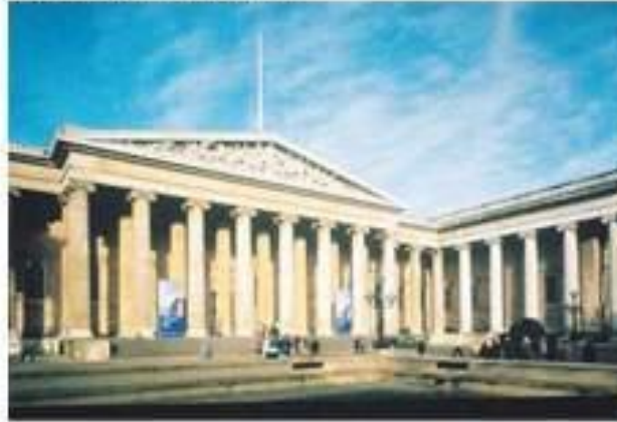
The British Museum