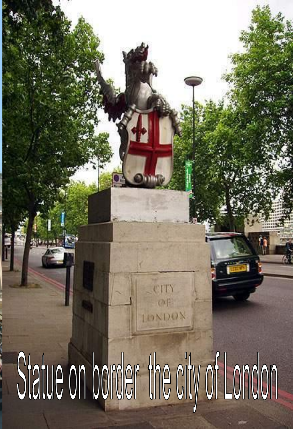
Statue on border the city of London