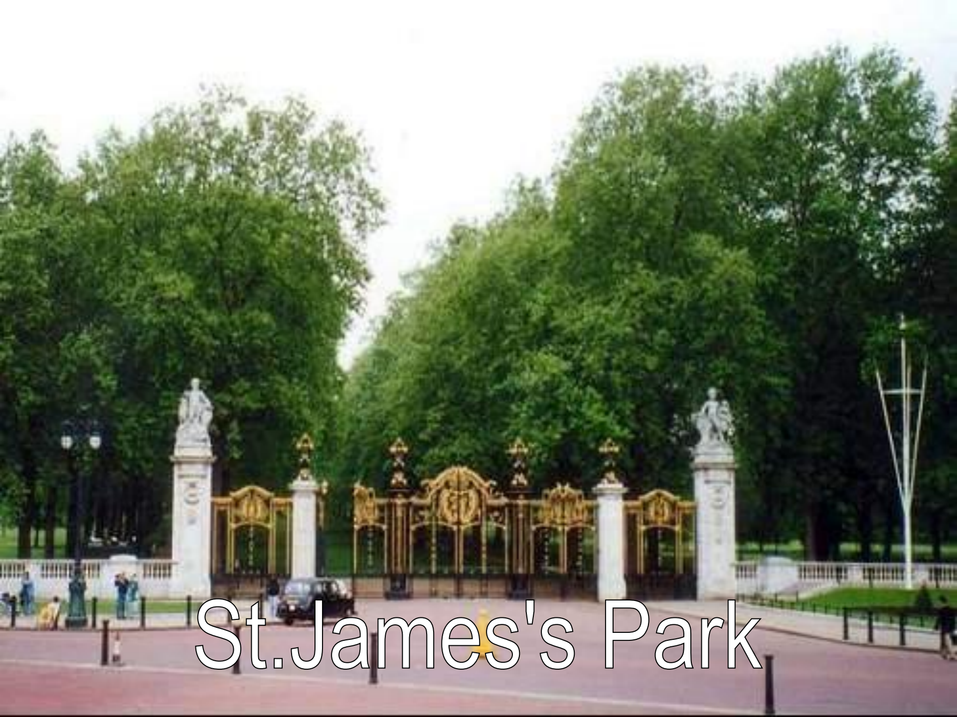
St. James's Park