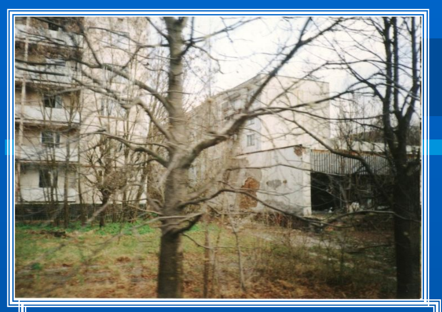
Abandoned housing blocks in Pripyat