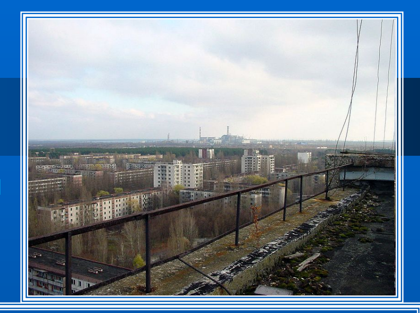
The abandoned city of Pripyat with Chernobyl plant in the distance