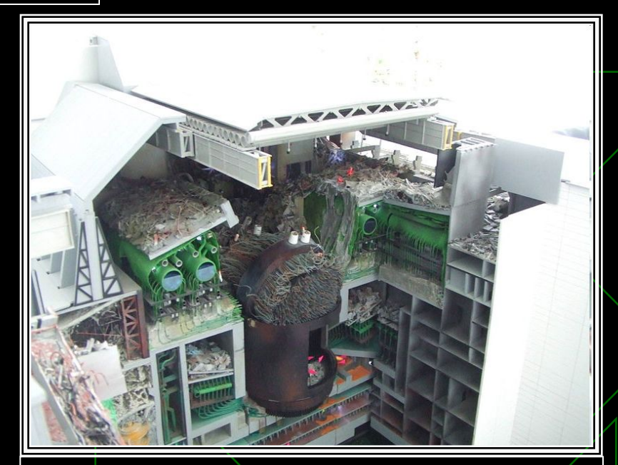
Model of Chernobyl reactor after the lid of the reactor chamber blew off. Chernobyl Museum, Kiev, Ukraine.