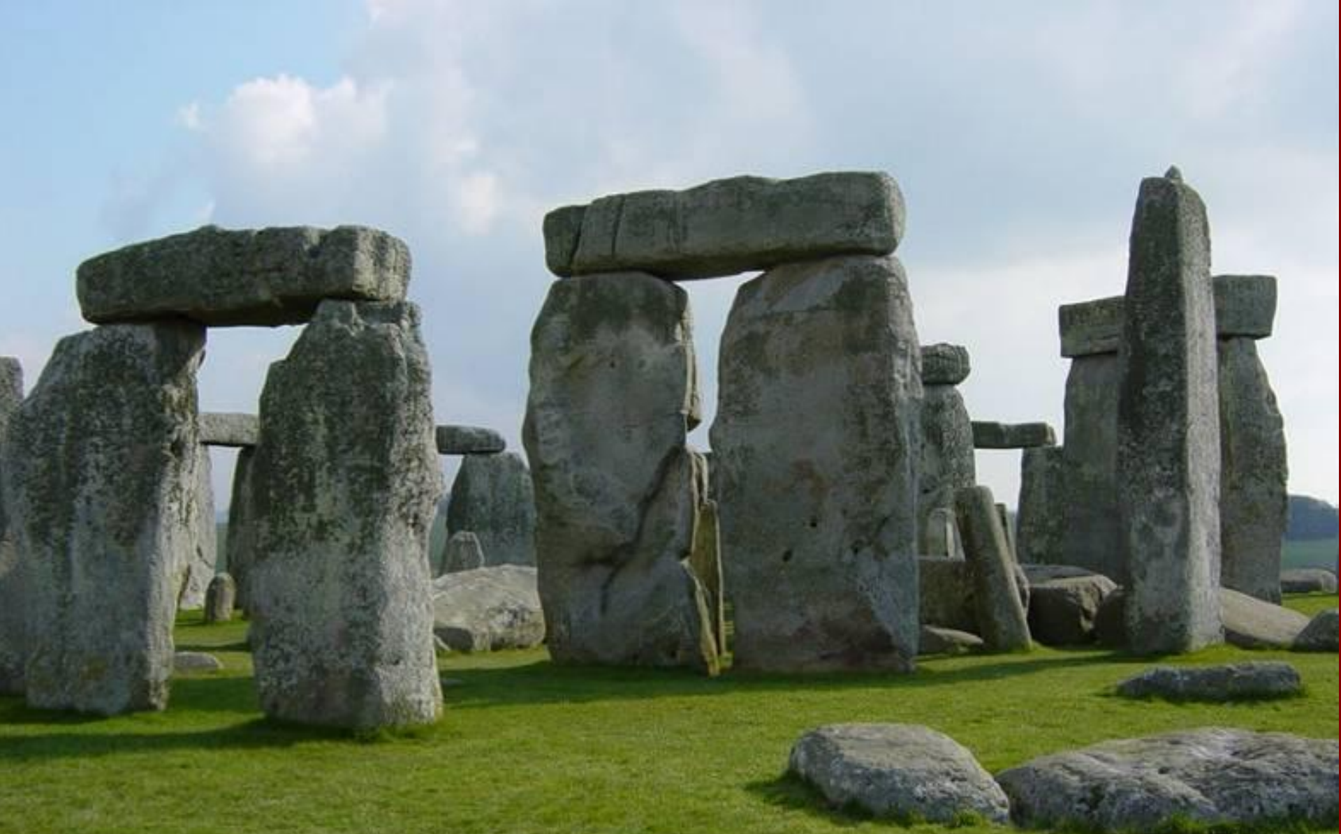
The famous Stonehenge