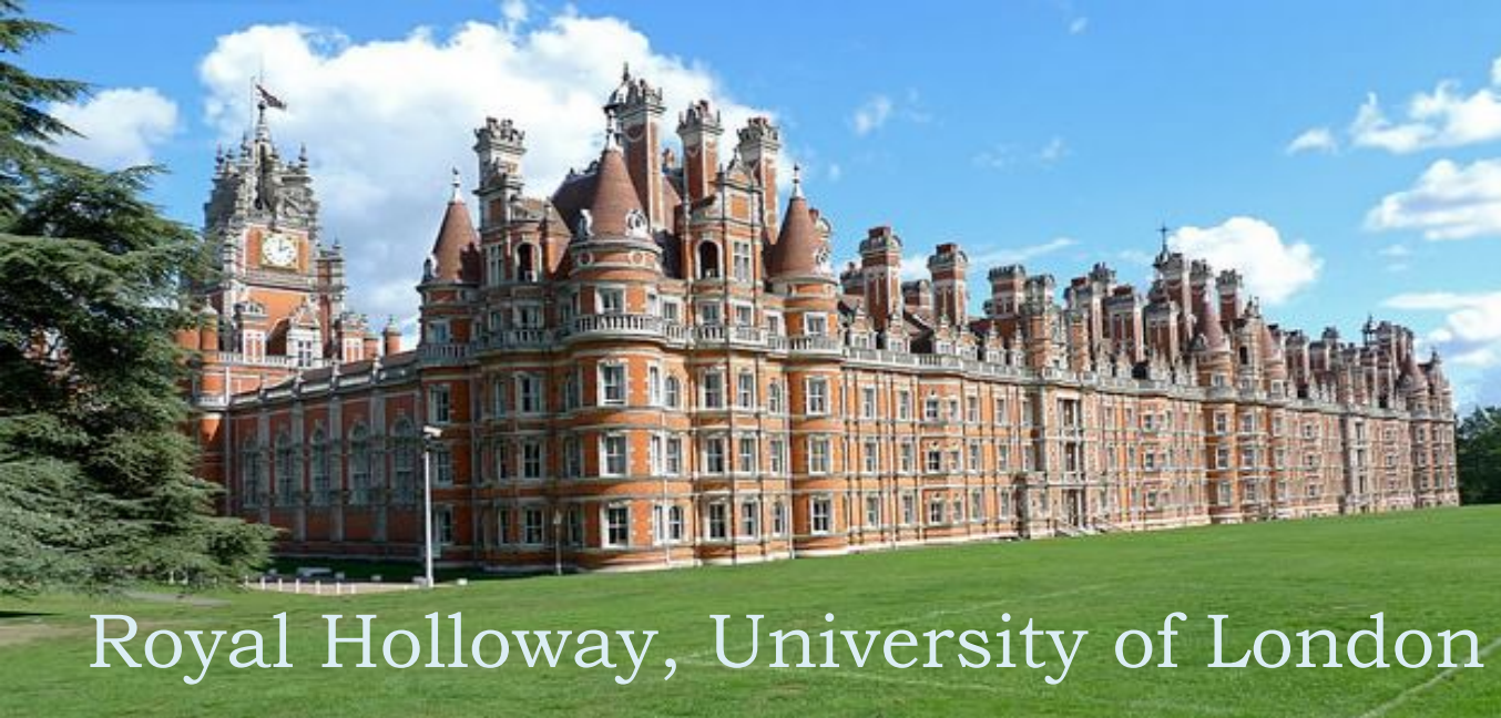
Royal Holloway, University of London