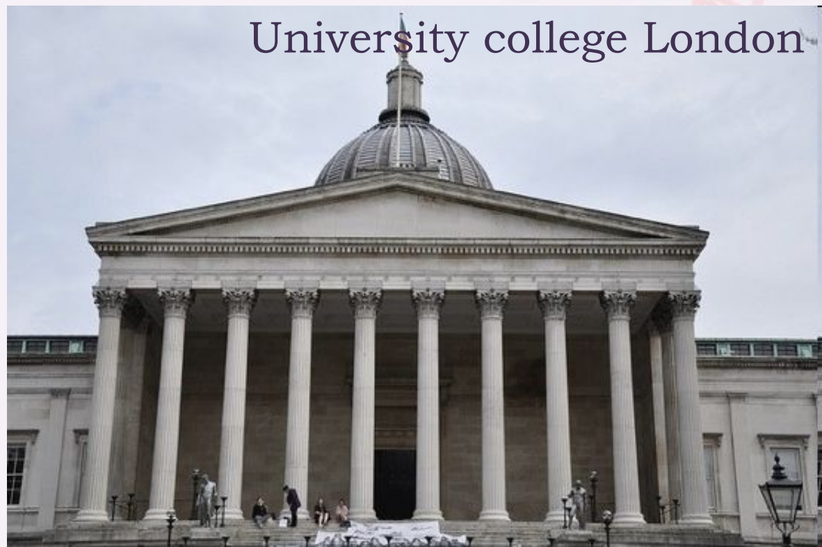
University college London