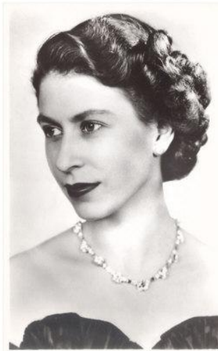
H.M. QUEEN ELIZABETH II.