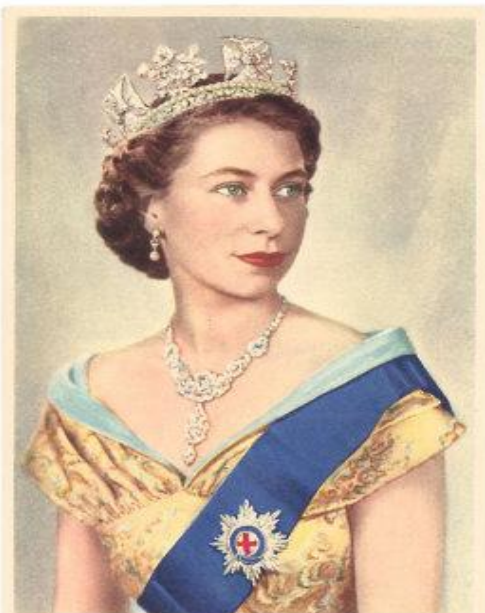
Her Majesty Queen Elizabeth II