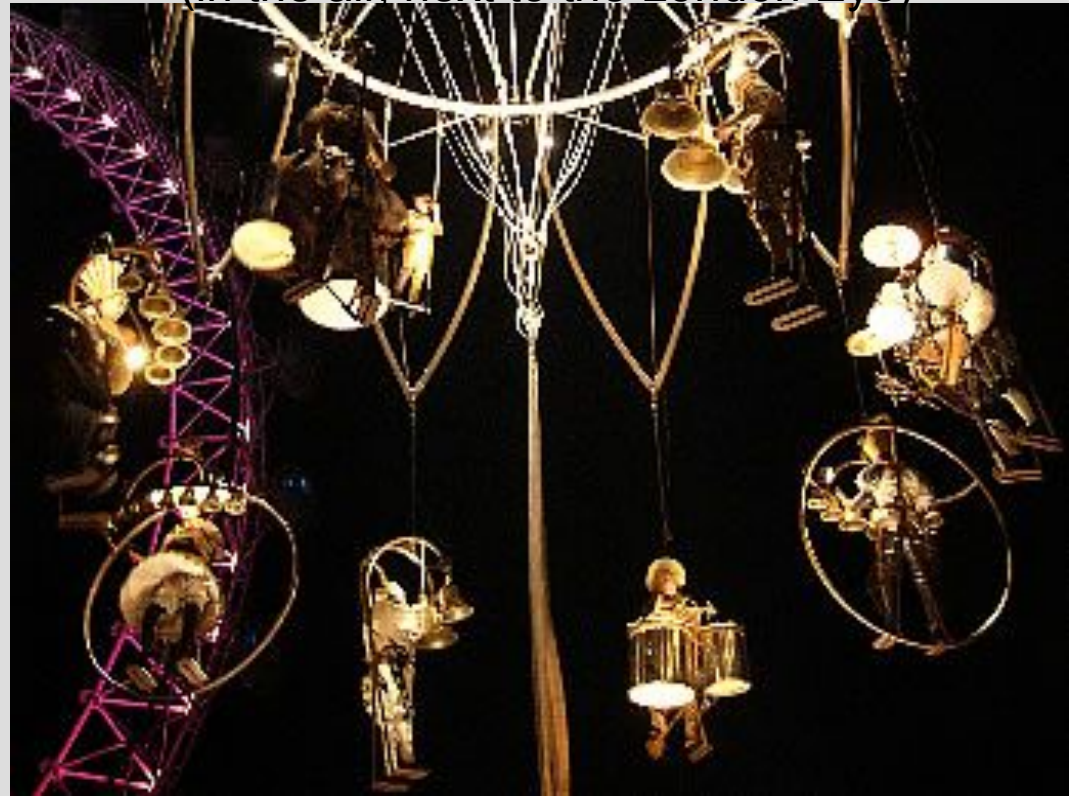
Transe Express play drums and bells (in the air, next to the London Eye)