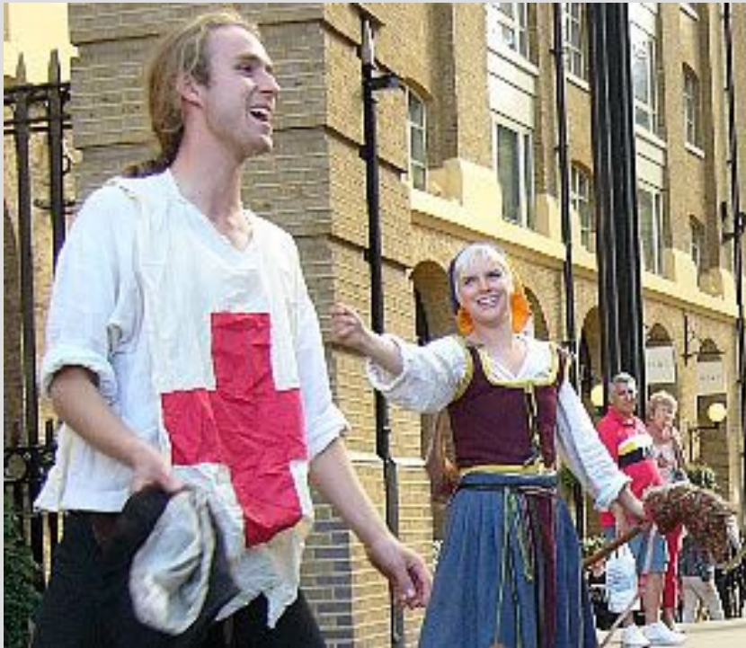
St George and the Dragon (in Hay's Galleria)