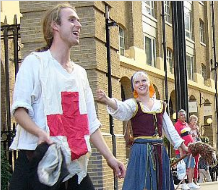
St George and the Dragon (in Hay's Galleria)