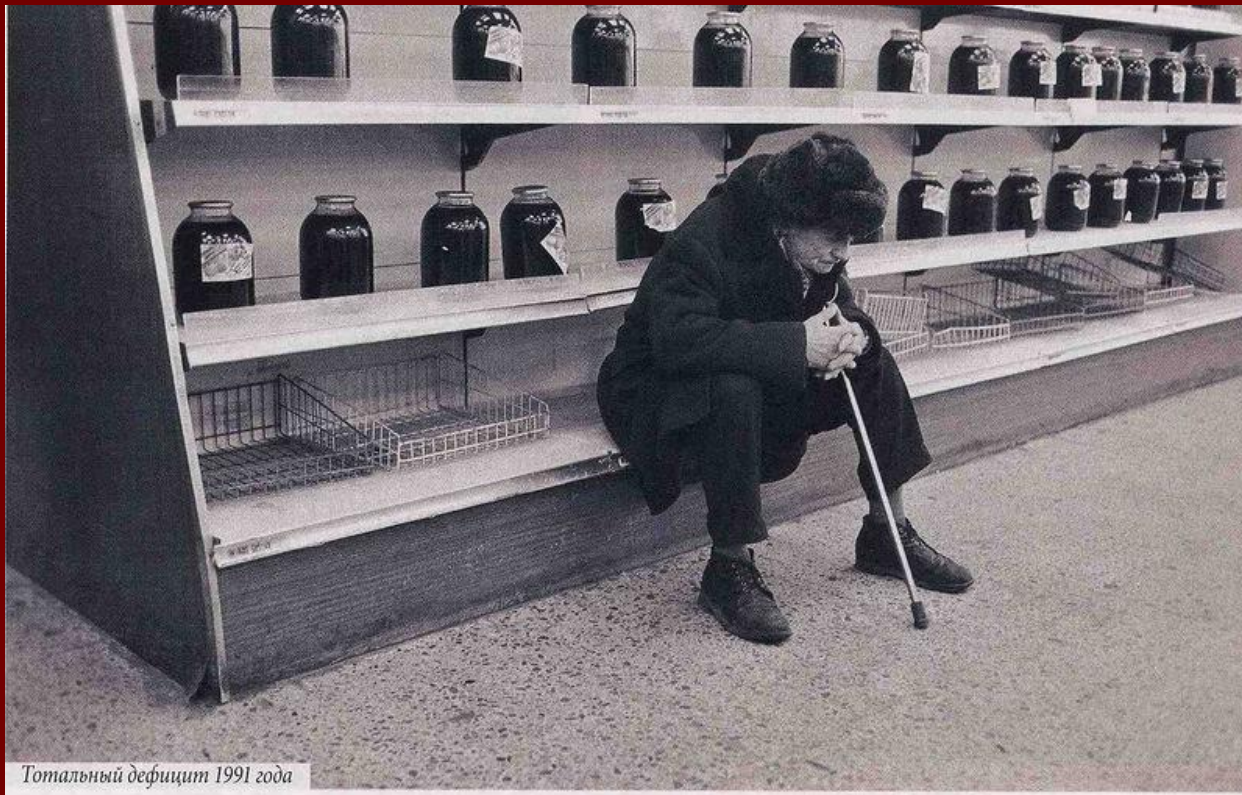
Тотальный дефицит 1991 года