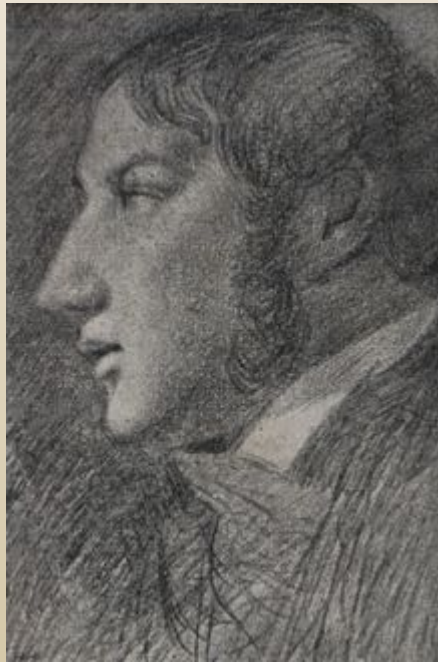
John Constable (1776-1837)