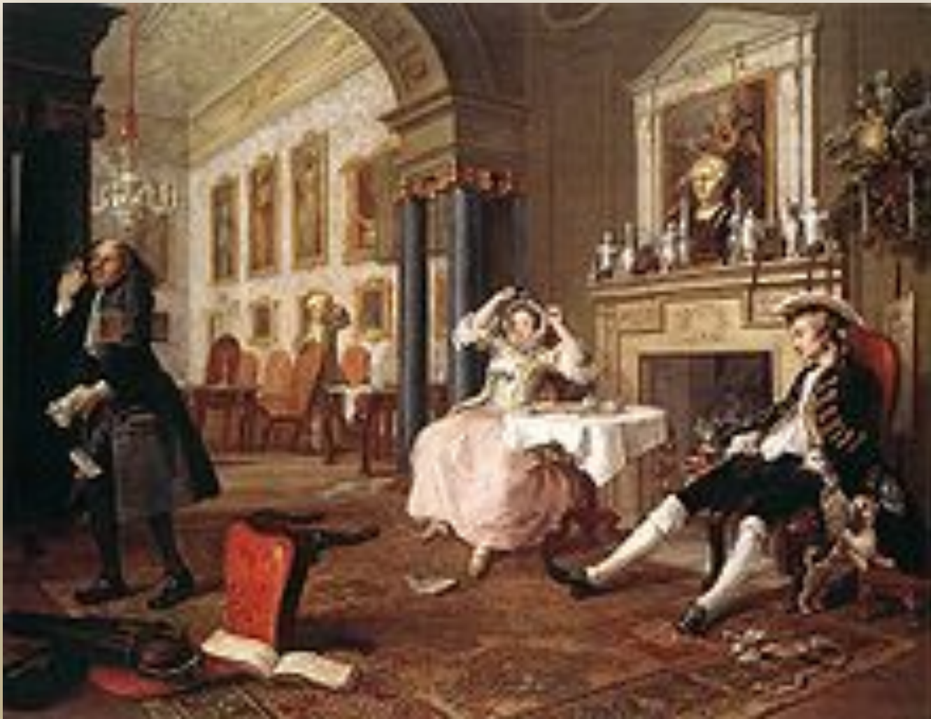
The "Marriage a la Mode",