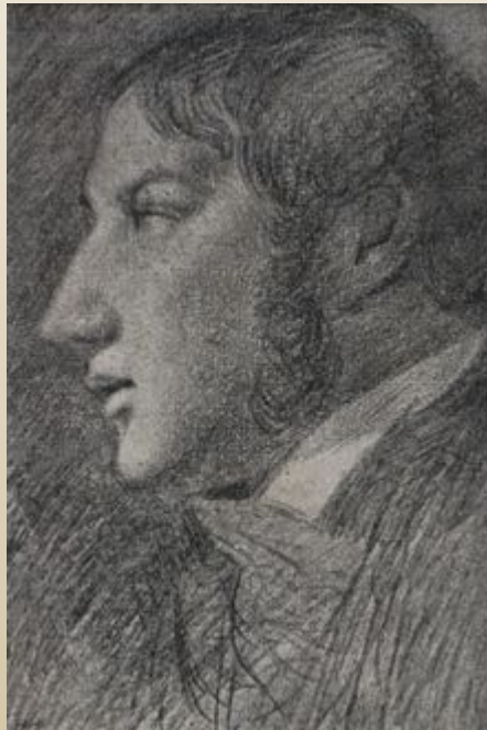
John Constable (1776-1837)