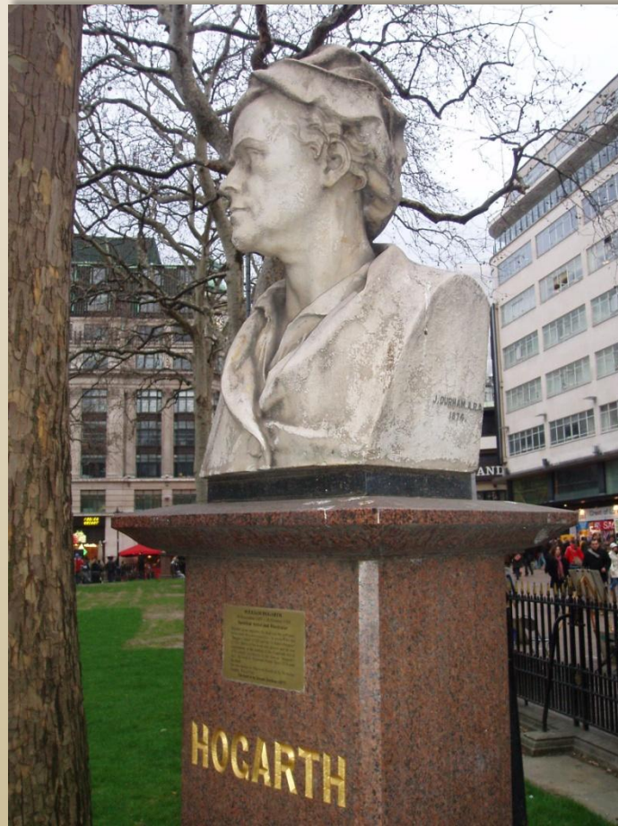
William Hogarth (1697-1764)