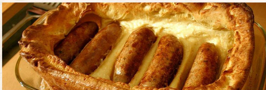
Toad in the Hole