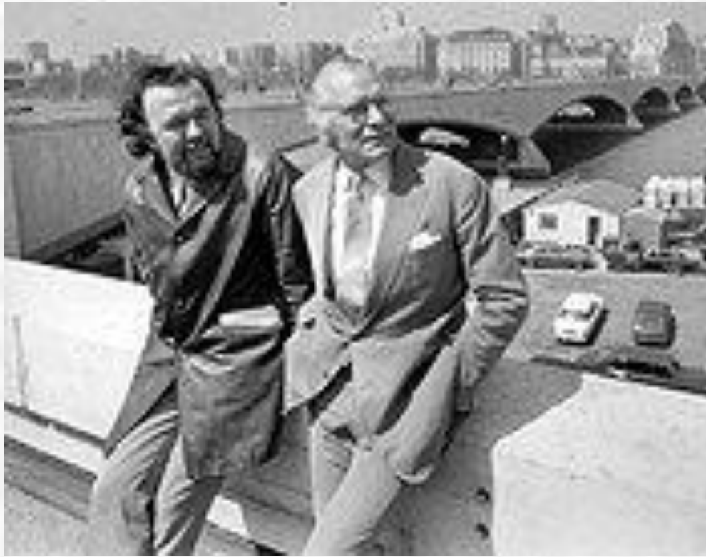
Laurence Olivier (on the right)