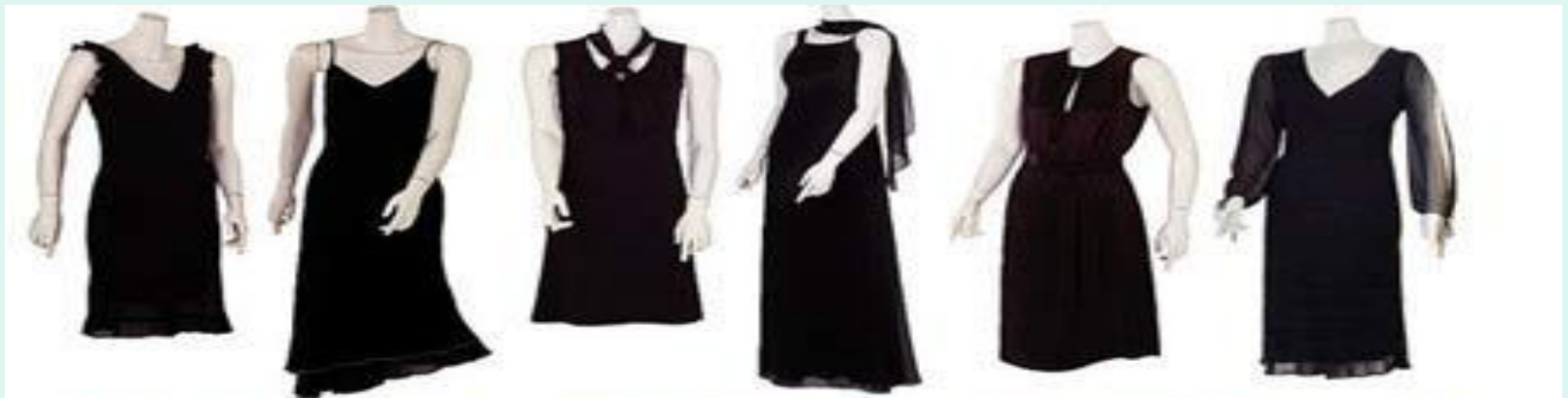
CDC Warehouse of London XOXO Chadwick's of Boston Allen by A.B.S. Warehouse of London

Many designers like Chanel herself afterwards, a lot of experimenting with long sleeves, neck shape, long skirts, trim