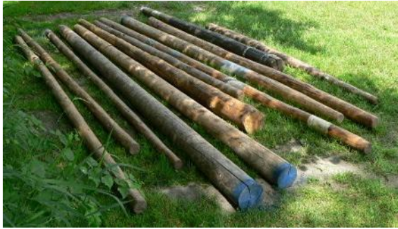
A selection of cabers of various lengths and weights