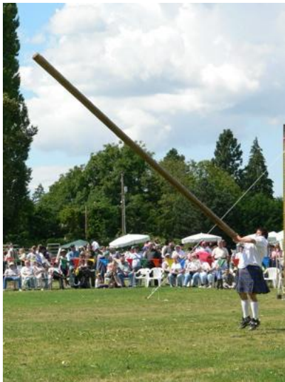
Moment of release