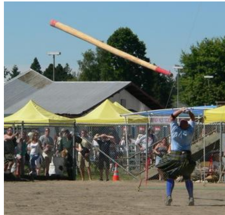
The caber in mid-flight