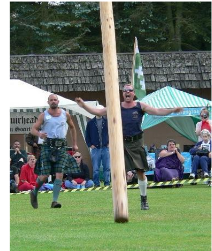
The caber strikes the ground