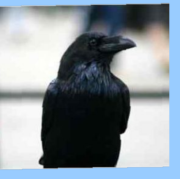
The ravens appeared at the Tower in the 17th century and the legend says that if they leave or die the country will fall.