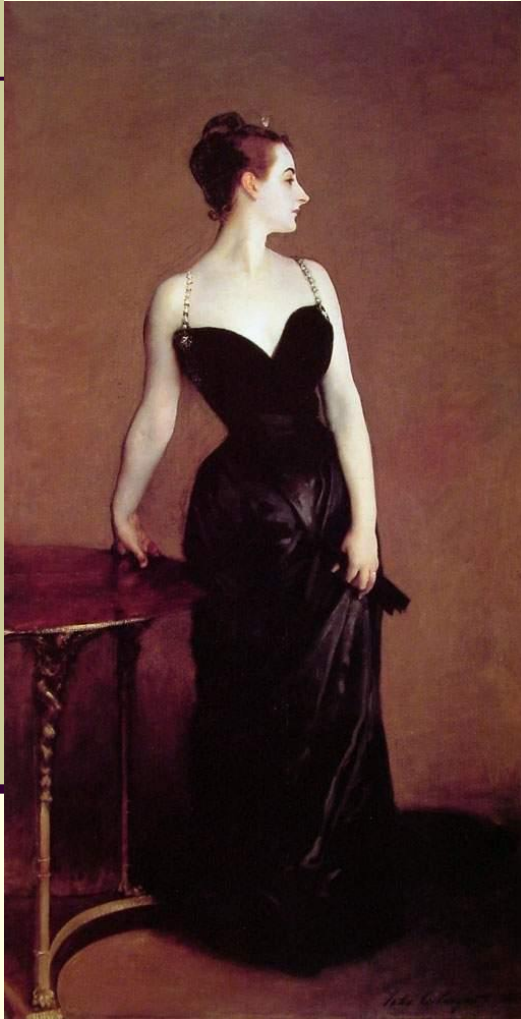
Madame X (Madame Pierre Gautreau) (1884)