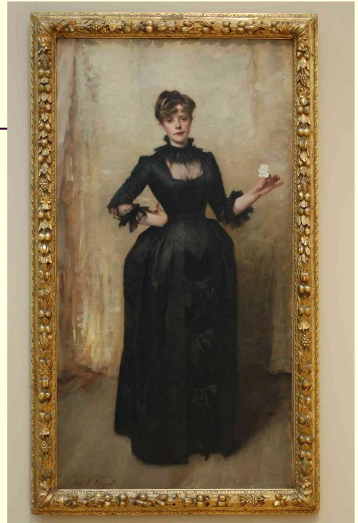
The Lady with the Rose (1882)