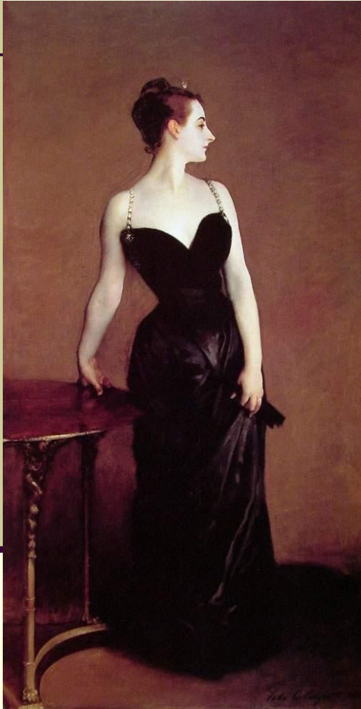
Madame X (Madame Pierre Gautreau) (1884)