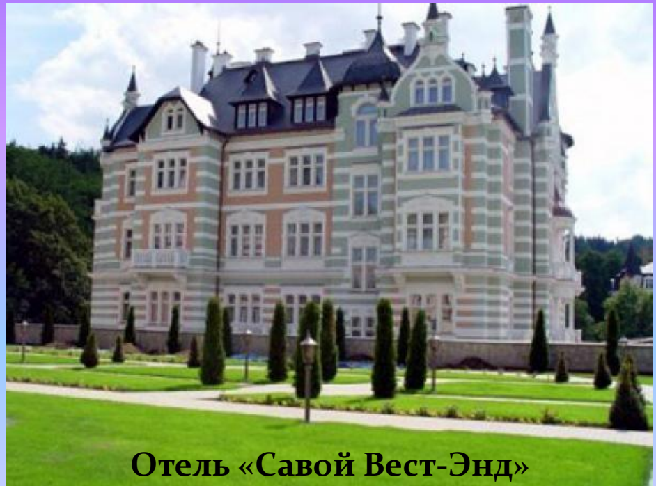
Отель «Савой Вест-Энд»