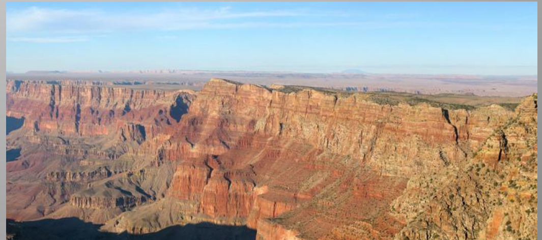
View from Navajo Point