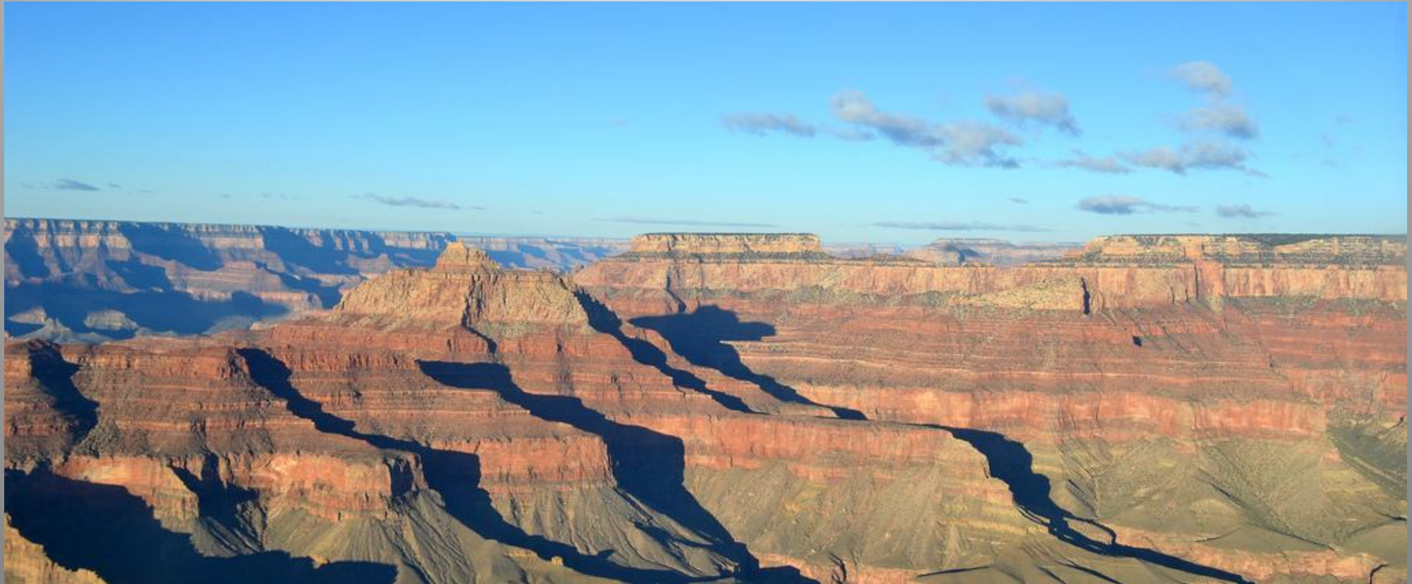
Grand Canyon: Vishnu Temple and Wotans Throne

Unique combinations of geologic color and erosional forms decorate a canyon that is 277 river miles (446km) long, up to 18 miles (29km) wide, and a mile (1.6km) deep.