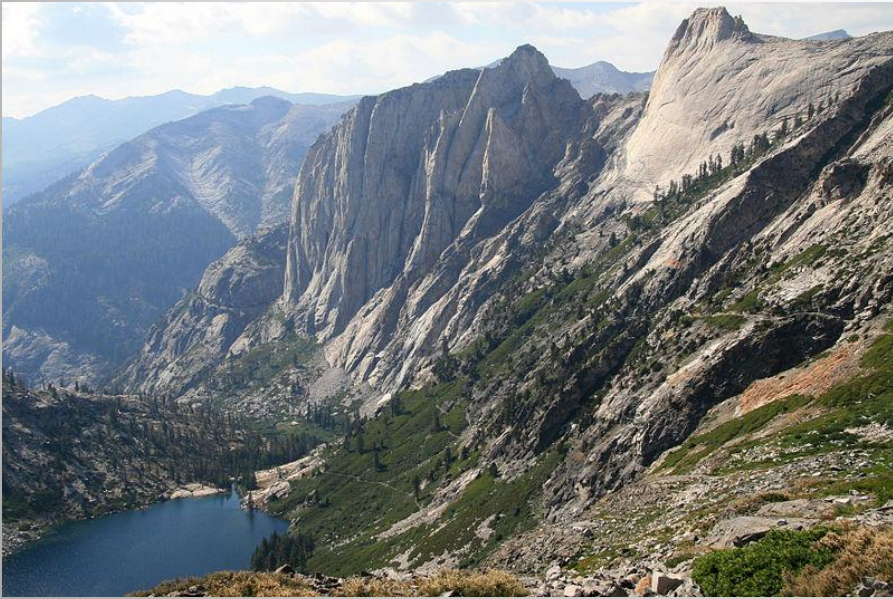
Hamilton Lake and the Valhalla cliffs