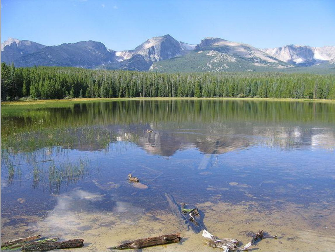
Bierstadt Lake and mountains

Rocky Mountain National Park's 415 square miles encompass and protect spectacular mountain environments. Enjoy Trail Ridge Road – which crests over 12,000 feet including many overlooks to experience the subalpine and alpine worlds – along with over 300 miles of hiking trails, wildflowers, wildlife, starry nights, and fun times. In a world of superlatives, Rocky is on top!