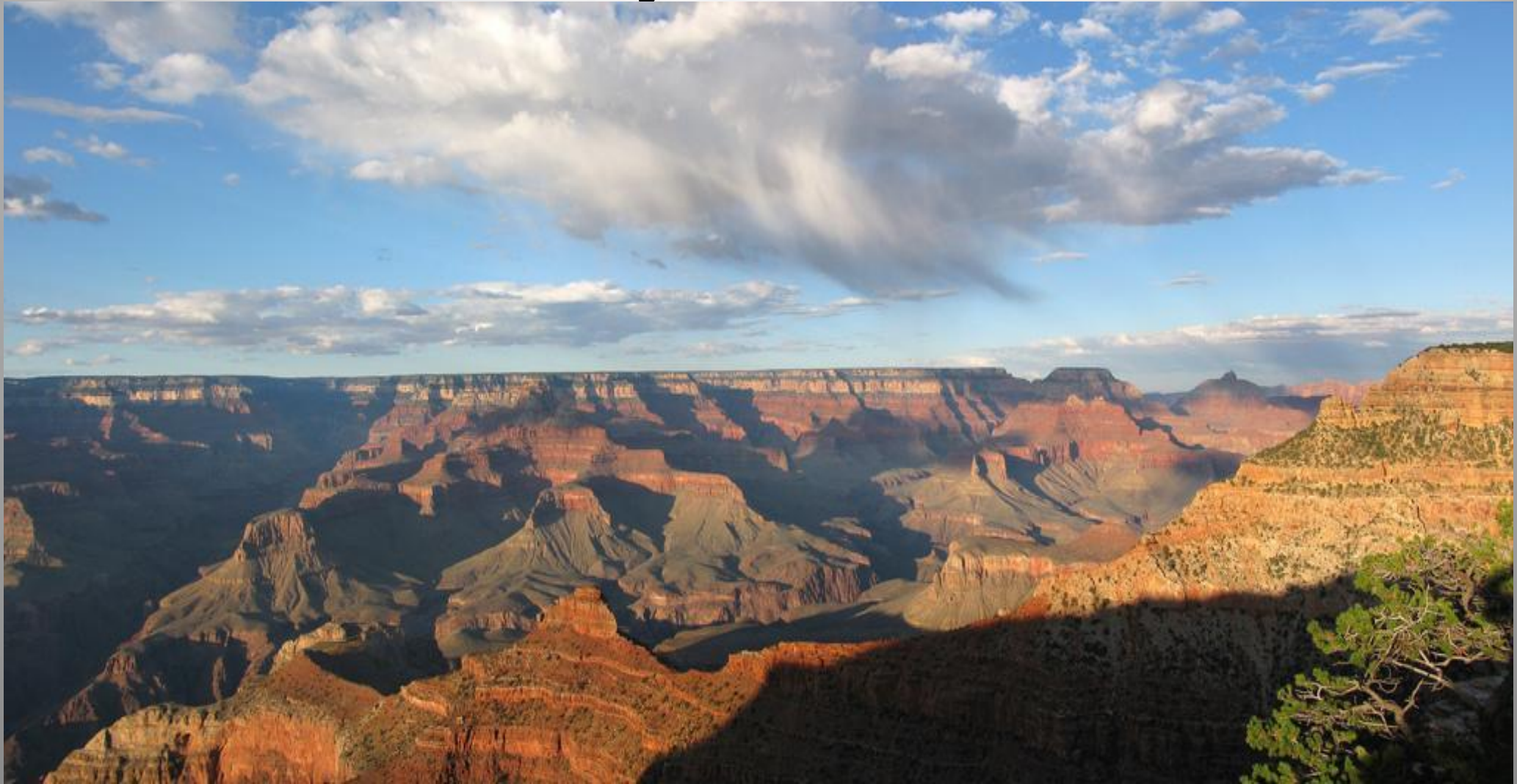
View from Mather Point