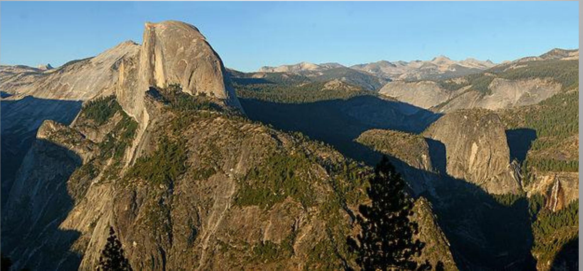
View from Glacier point