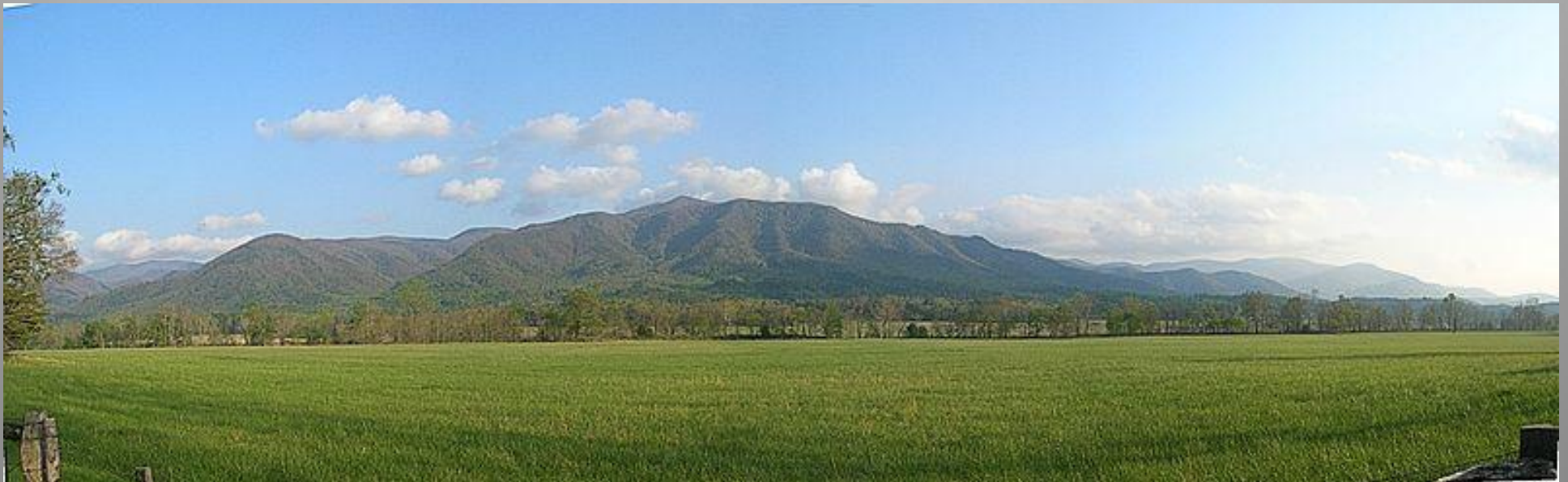
Cades Cove Panorama

Ridge upon ridge of forest straddles the border between North Carolina and Tennessee in Great Smoky Mountains National Park. World renowned for its diversity of plant and animal life, the beauty of its ancient mountains, and the quality of its remnants of Southern Appalachian mountain culture, this is America's most visited national park.