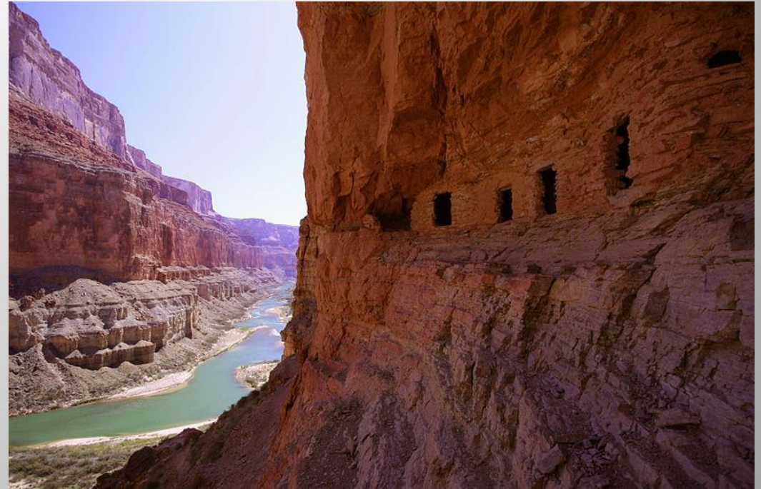
Nankoweap Creek, North Rim