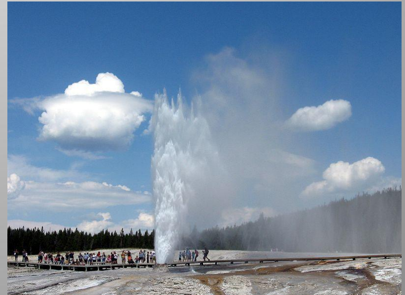
Beehive Geyser Erupting