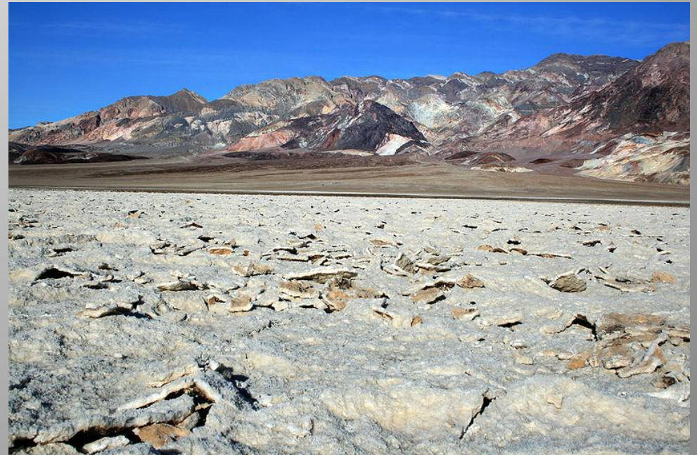
Devil's Golf Course