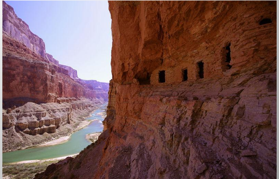
Nankoweap Creek, North Rim