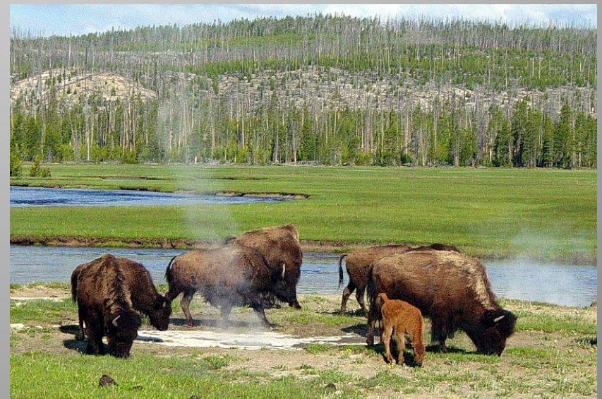
Bison near a hot spring