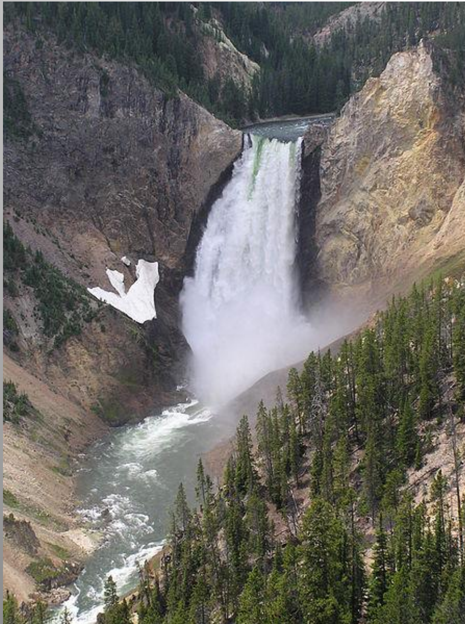
Lower Yellowstone Falls