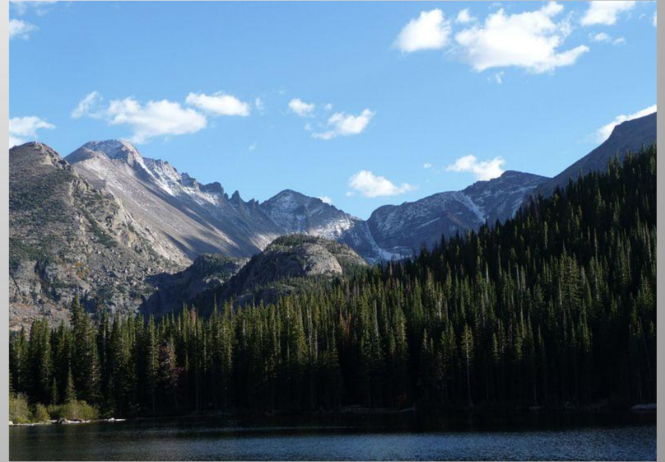
Glacier Gorge viewed from Bear Lake