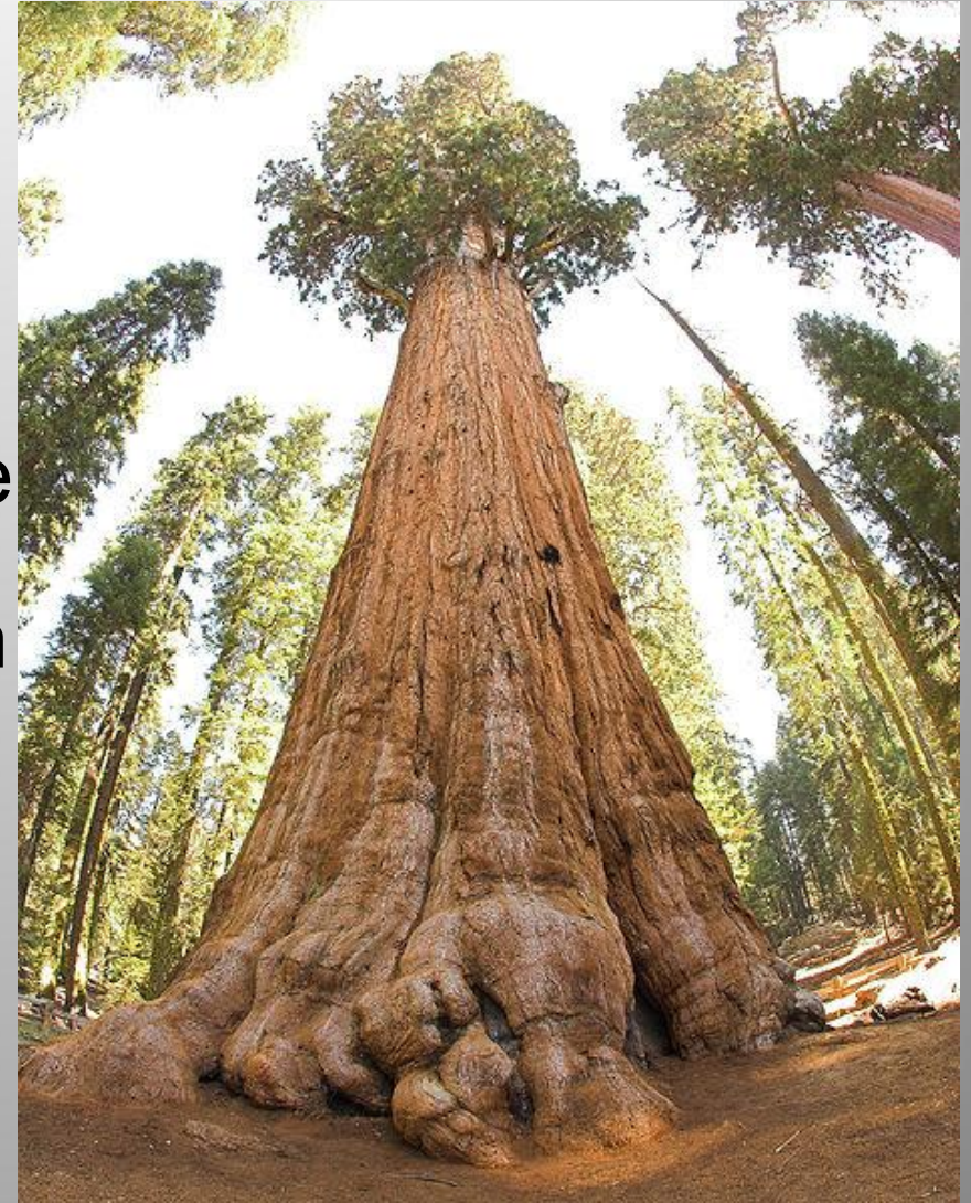
General Sherman Tree

Sequoia and Kings Canyon National Parks lie side-by-side in the southern Sierra Nevada, east of the San Joaquin Valley. Visitor activities vary by season and elevation