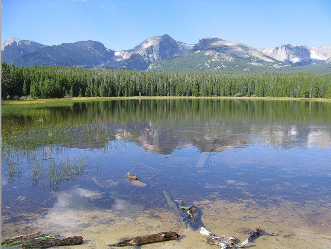
Bierstadt Lake and mountains

Rocky Mountain National Park's 415 square miles encompass and protect spectacular mountain environments. Enjoy Trail Ridge Road – which crests over 12,000 feet including many overlooks to experience the subalpine and alpine worlds – along with over 300 miles of hiking trails, wildflowers, wildlife, starry nights, and fun times. In a world of superlatives, Rocky is on top!