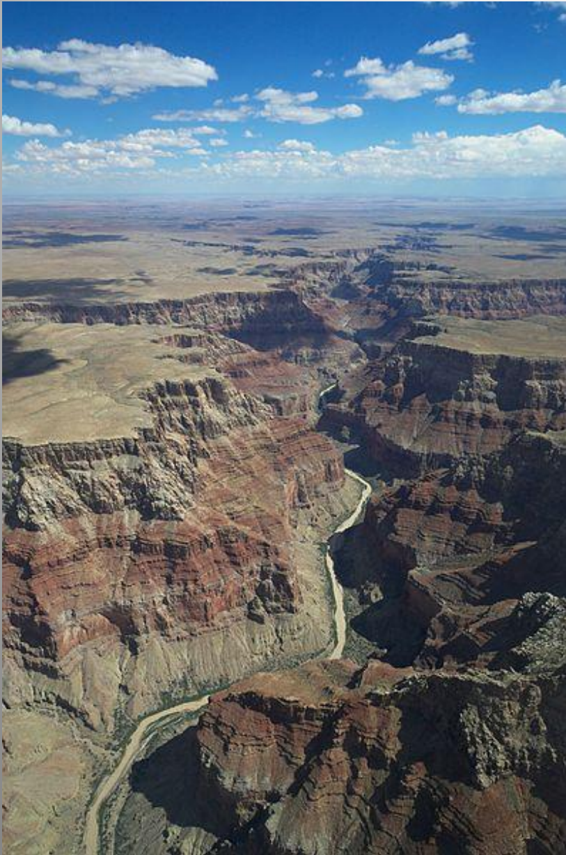
North part of the Grand Canyon