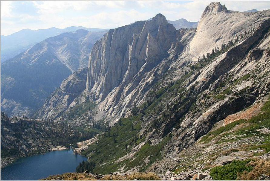
Hamilton Lake and the Valhalla cliffs