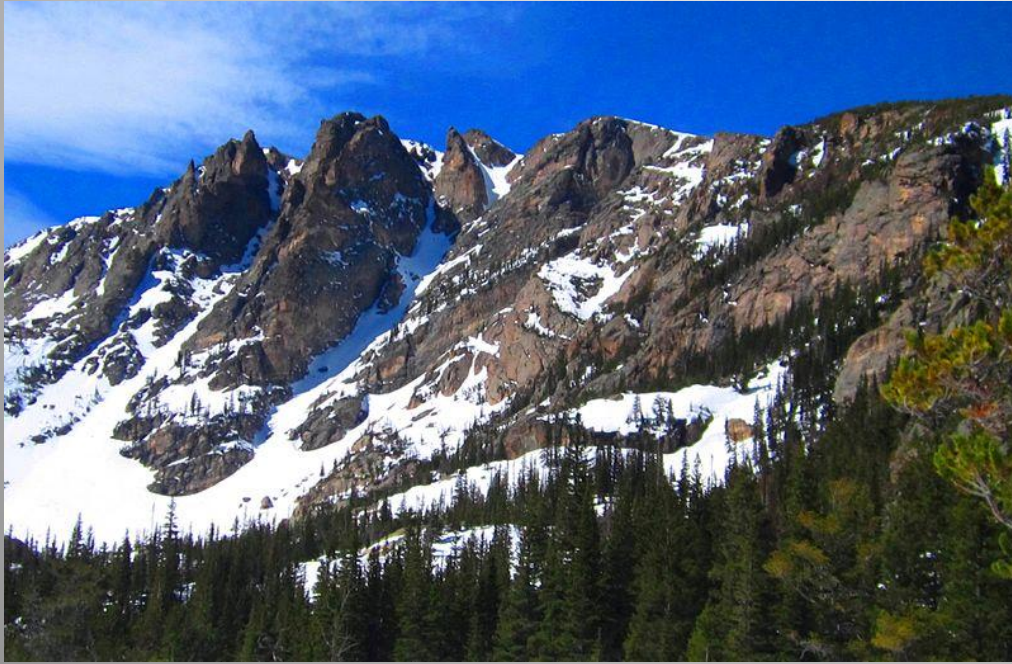
Peaks above Dream Lake