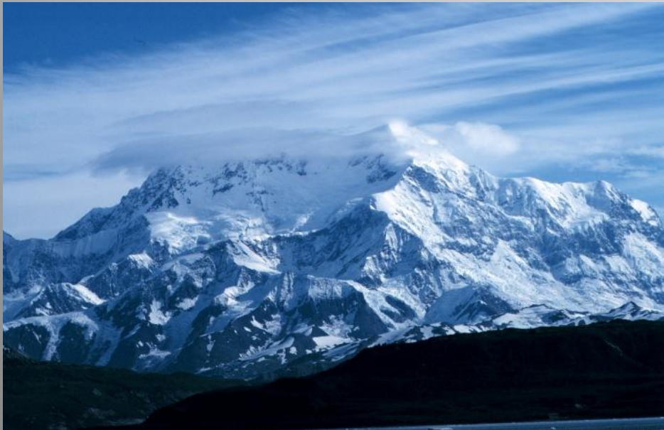
Mount Saint Elias, 5489 m, second highest mountain in Canada and the USA

At 13.2 million acres which is bigger than the country of Switzerland, Wrangell-St. Elias stretches from one of the tallest peaks in North America, Mount St. Elias (18,008) to the ocean. Yet within this wild landscape, people have been living off the land for centuries and still do today. The park is a rugged yet inviting place to experience your own adventure.