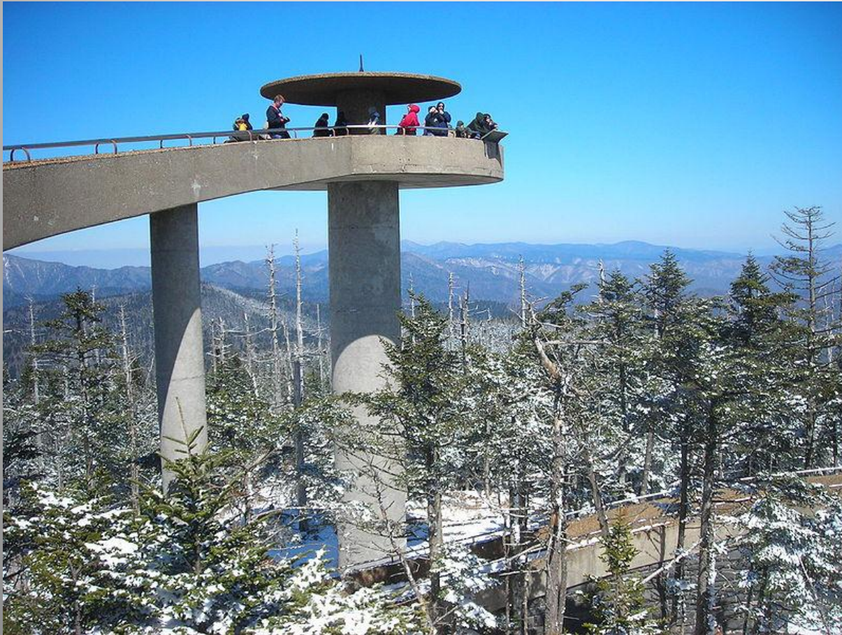
Clingman's Dome Observation Tower