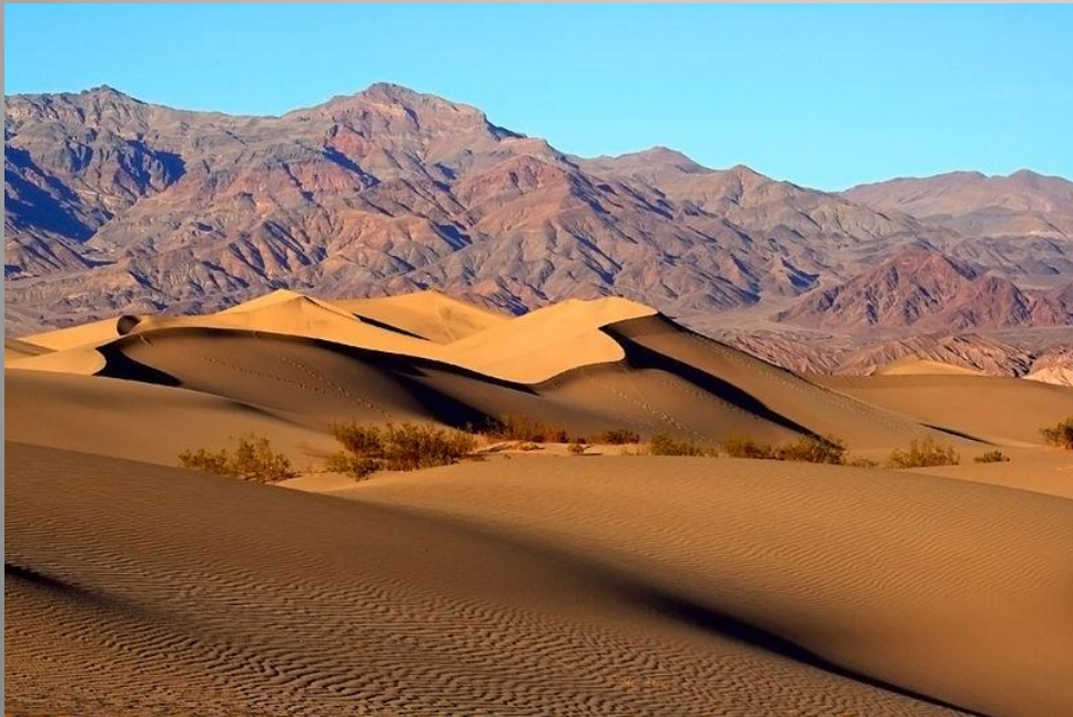
Mesquite Sand Dunes

In this below-sea-level basin, steady drought and record summer heat make Death Valley a land of extremes. Yet, each extreme has a striking contrast. Towering peaks are frosted with winter snow. Rare rainstorms bring vast fields of wildflowers. Lush oases harbor tiny fish and refuge for wildlife and humans. Despite its morbid name, a great diversity of life survives in Death Valley.