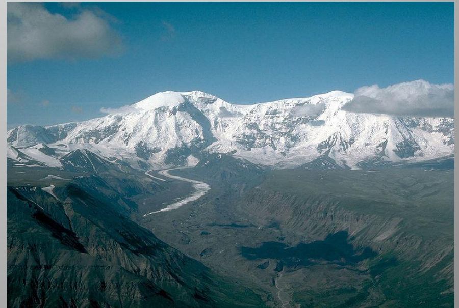
Mount Jarvis, 4091 m