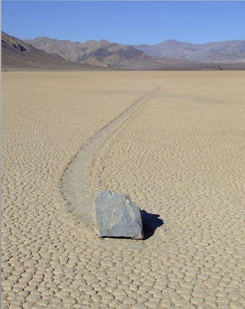
Racetrack Playa with a rock pushed by the wind