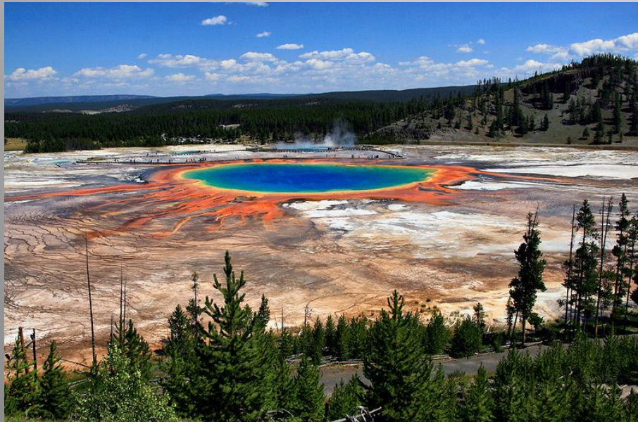
Grand Prismatic Spring and Midway Geyser Basin

It's a wonderland. Old Faithful and the majority of the world's geysers are preserved here. They are the main reason the park was established in 1872 as America's first national park - an idea that spread worldwide. A mountain wildland, home to grizzly bears, wolves, and herds of bison and elk, the park is the core of one of the last, nearly intact, natural ecosystems in the Earth's temperate zone.