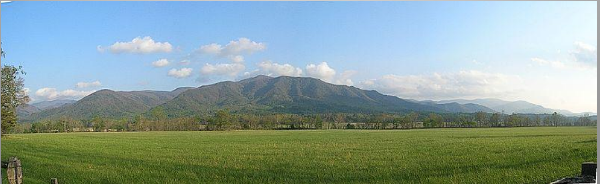
Cades Cove Panorama

Ridge upon ridge of forest straddles the border between North Carolina and Tennessee in Great Smoky Mountains National Park. World renowned for its diversity of plant and animal life, the beauty of its ancient mountains, and the quality of its remnants of Southern Appalachian mountain culture, this is America's most visited national park.