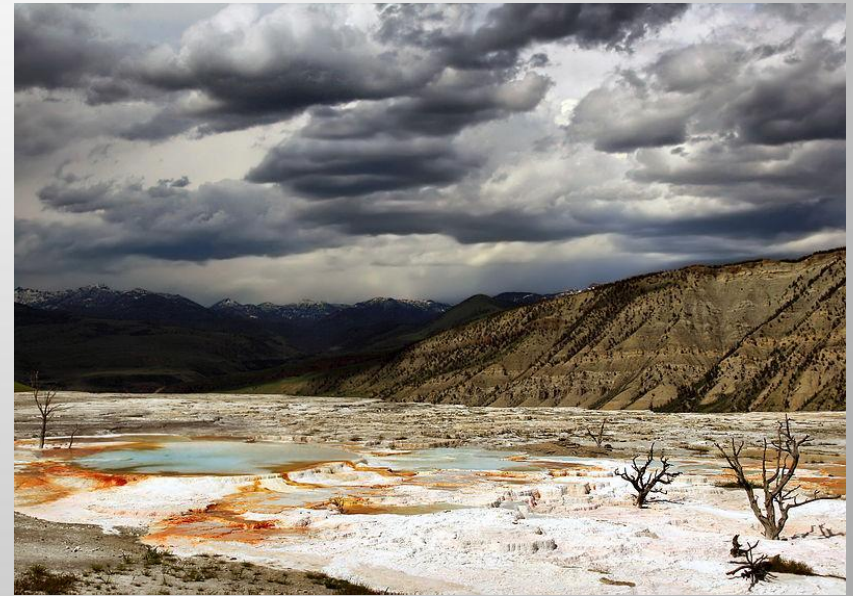
Upper Terraces of Mammoth Hot Springs