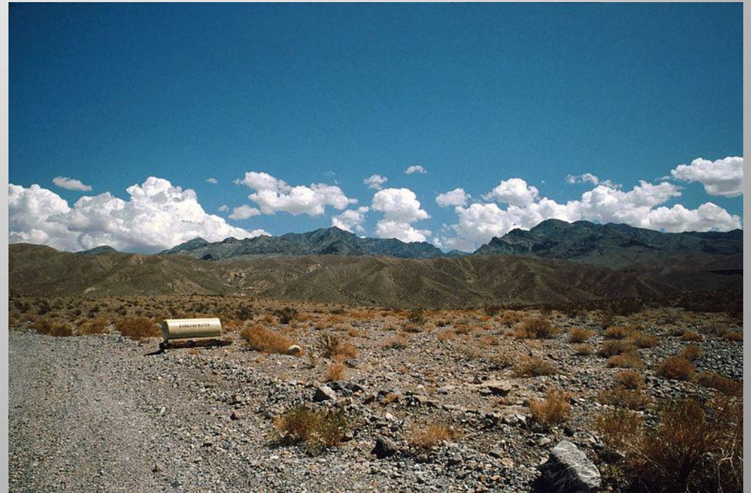
Death Valley Desert