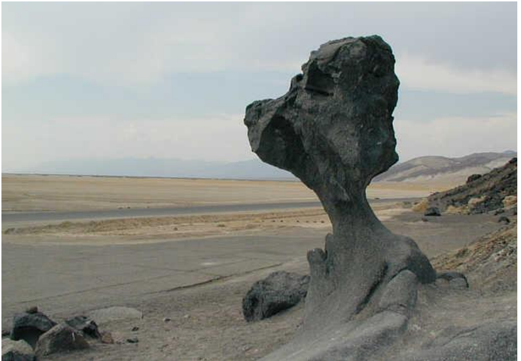
Grand canyon, USA