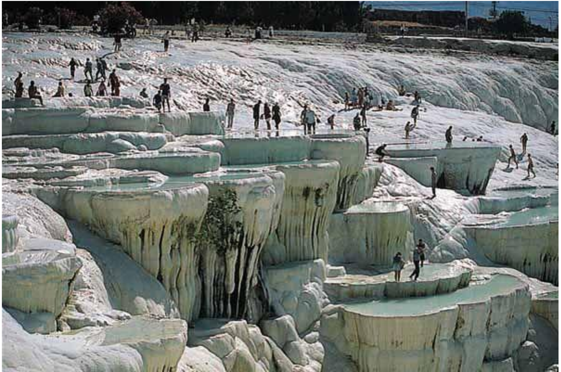
Salt baths in Pamukkale, Turkey