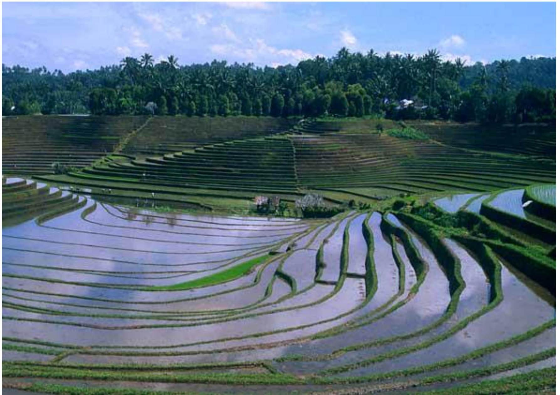
Terraced rice rivers on Bali Island, Indonesia