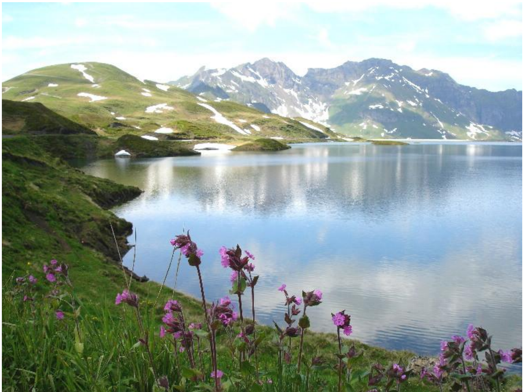
Alps in Switzerland