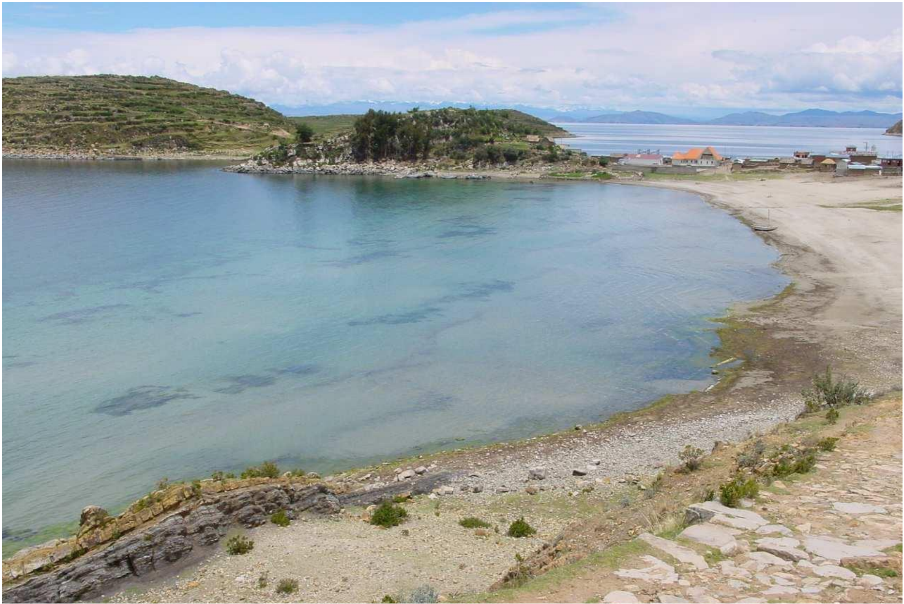
Titikaka - the biggest mountain lake, Peru