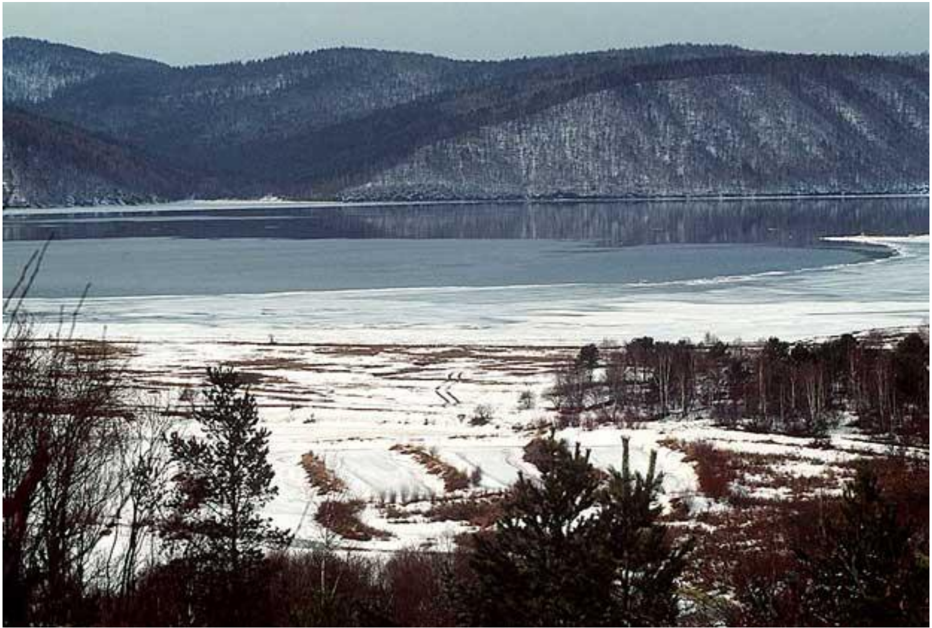
Baikal Lake, Russia