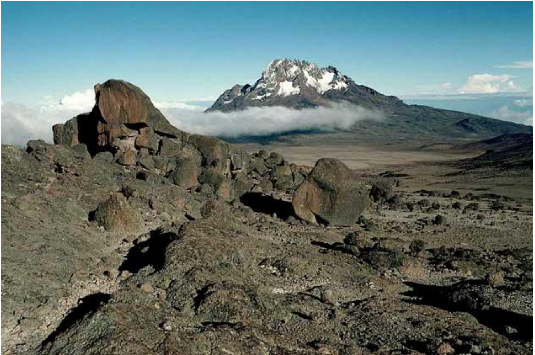
Massive Kilimanjaro, Africa