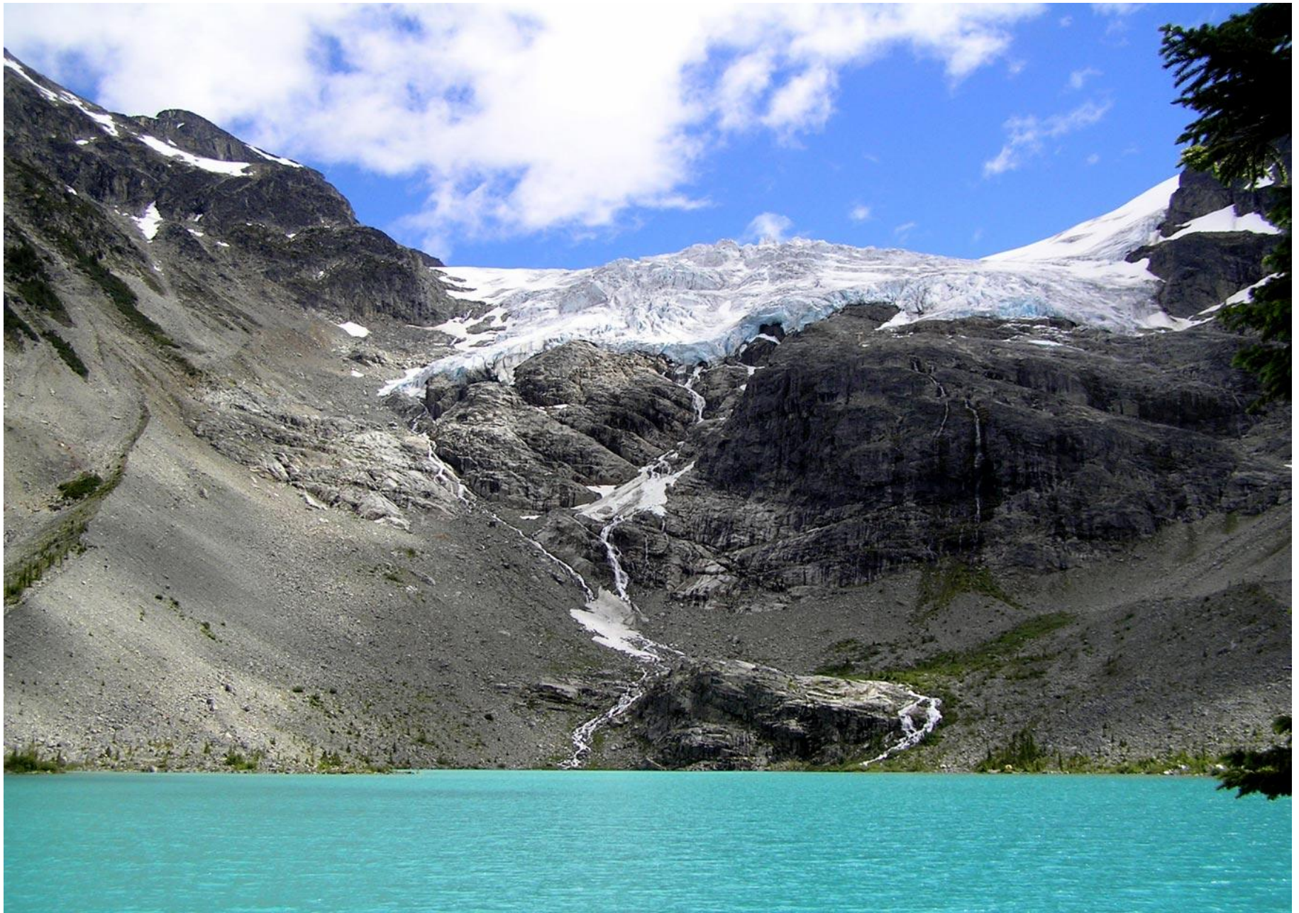
Lake of glacial origin in national park Glacier, USA