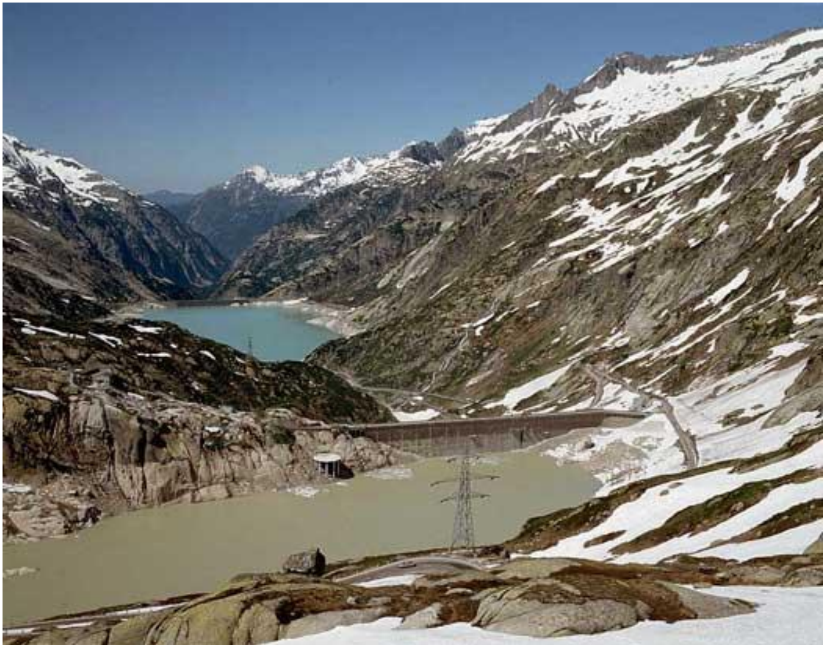
Reservoir in Alps, Switzerland