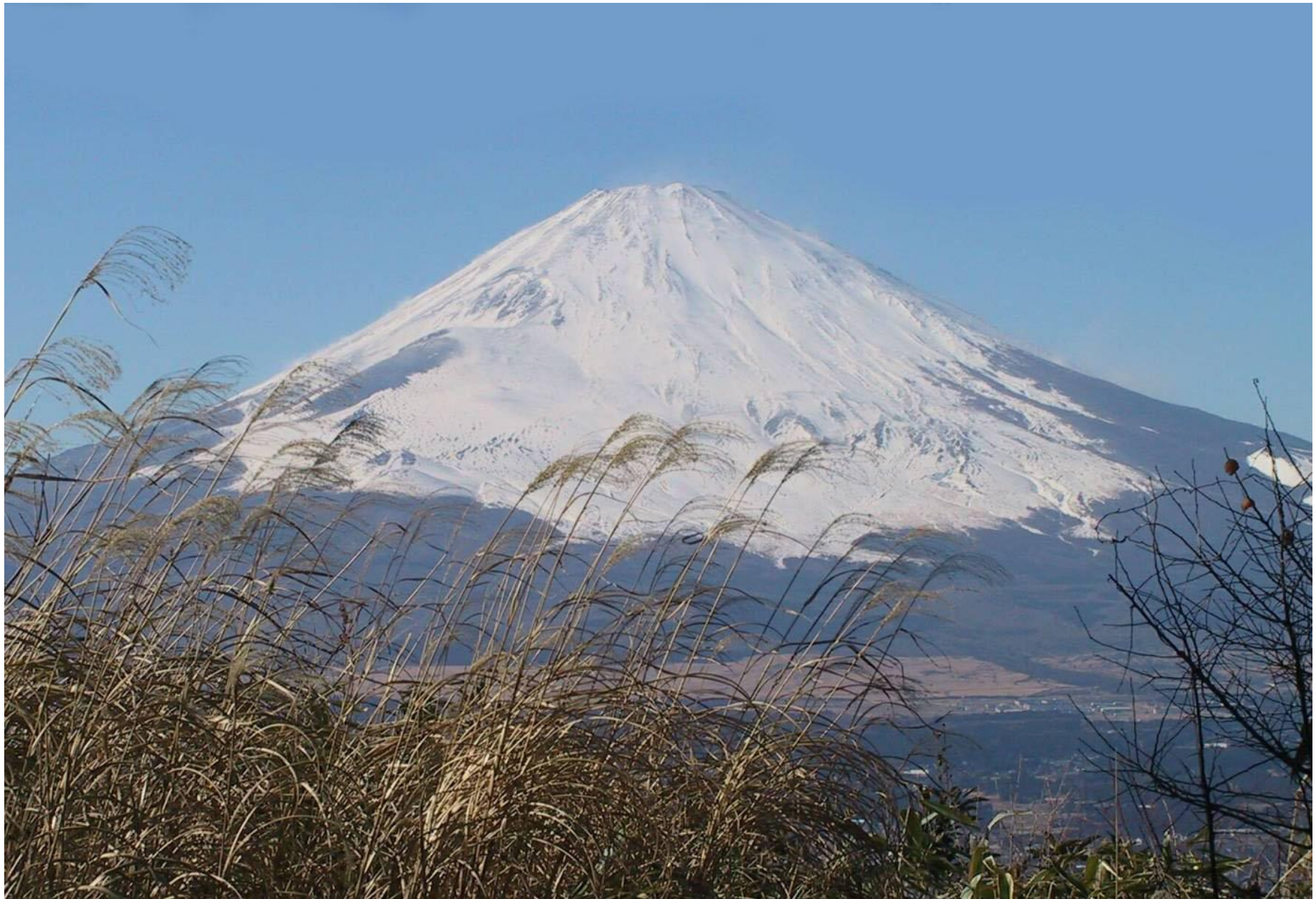
The greatest mountain of Japan - Fujiyama