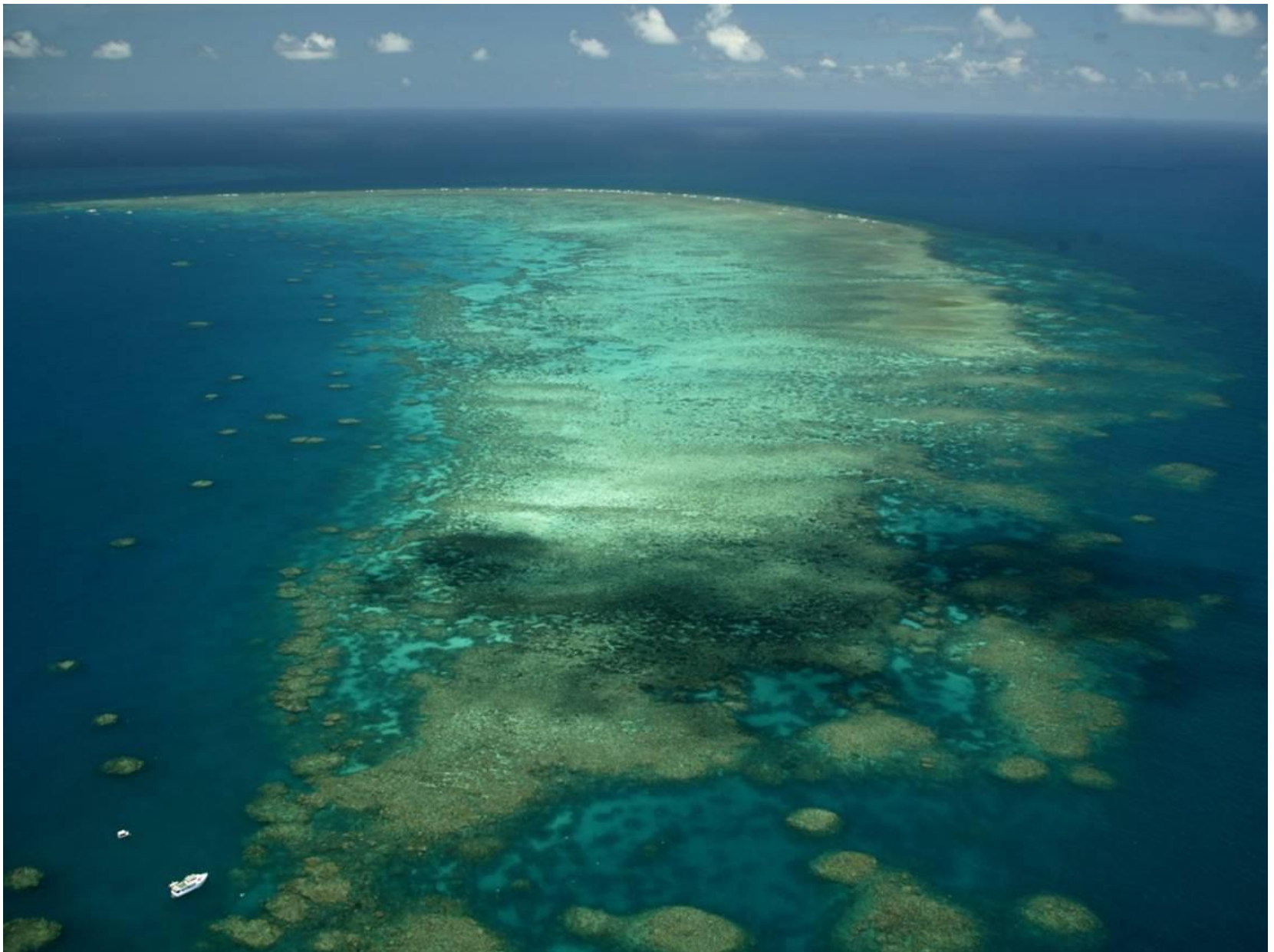
Great barrier reef, Australia