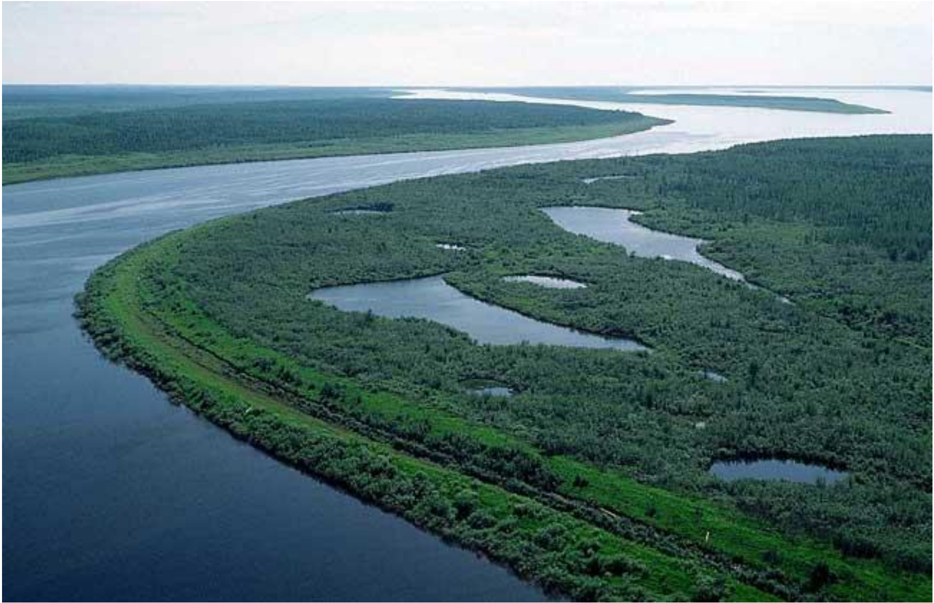
Yenisei river, Russia