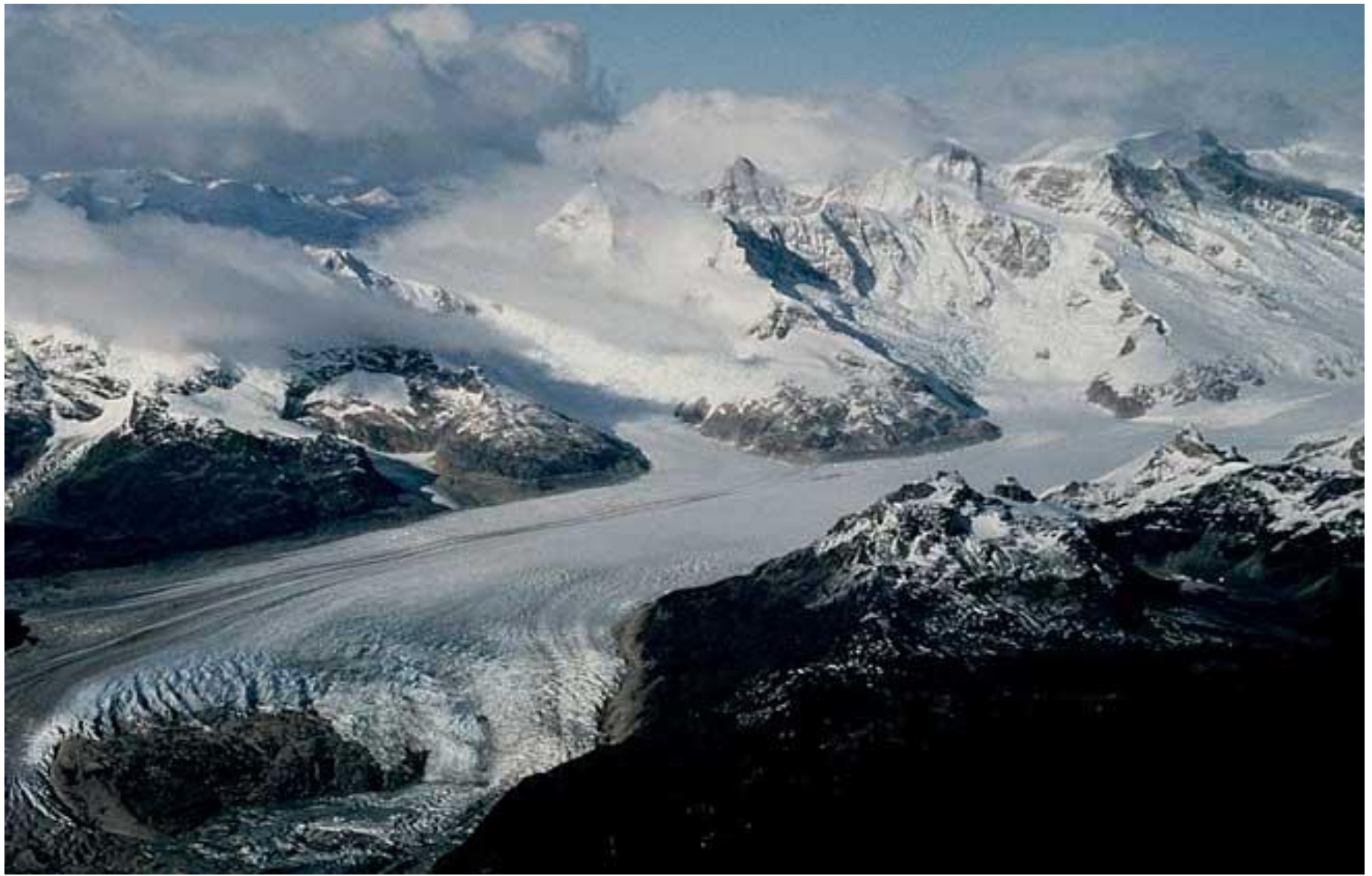
Great valley glacier