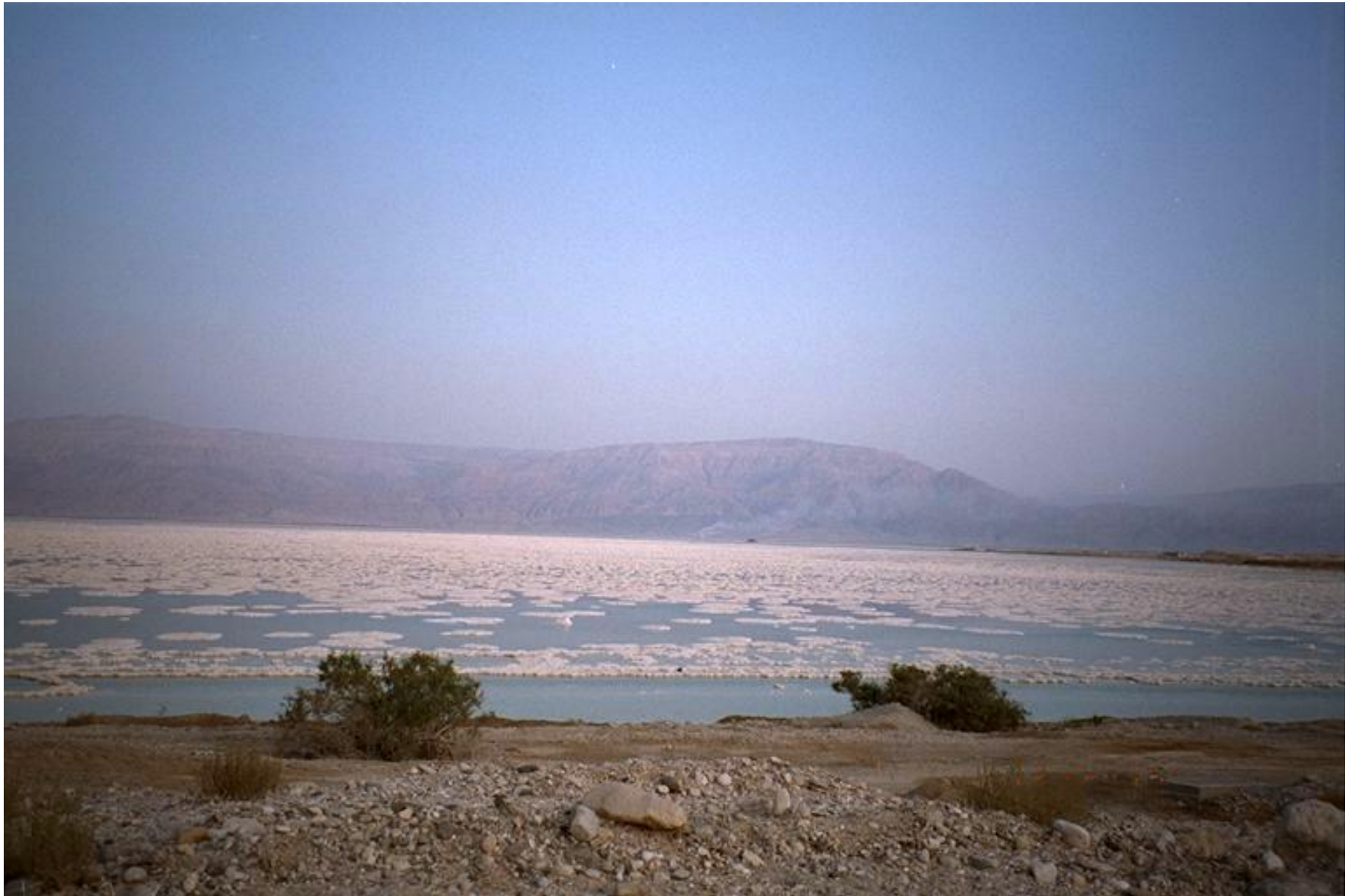
Dead sea, Israel