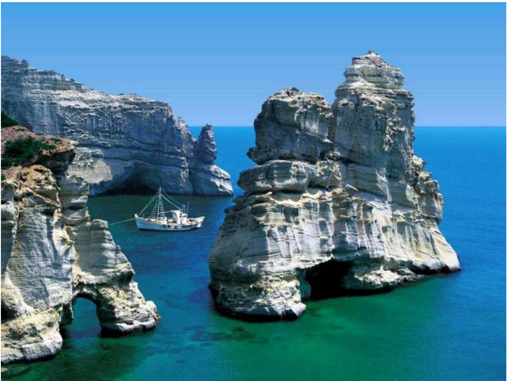
Rocks and cliffs near Milos Island, Greece