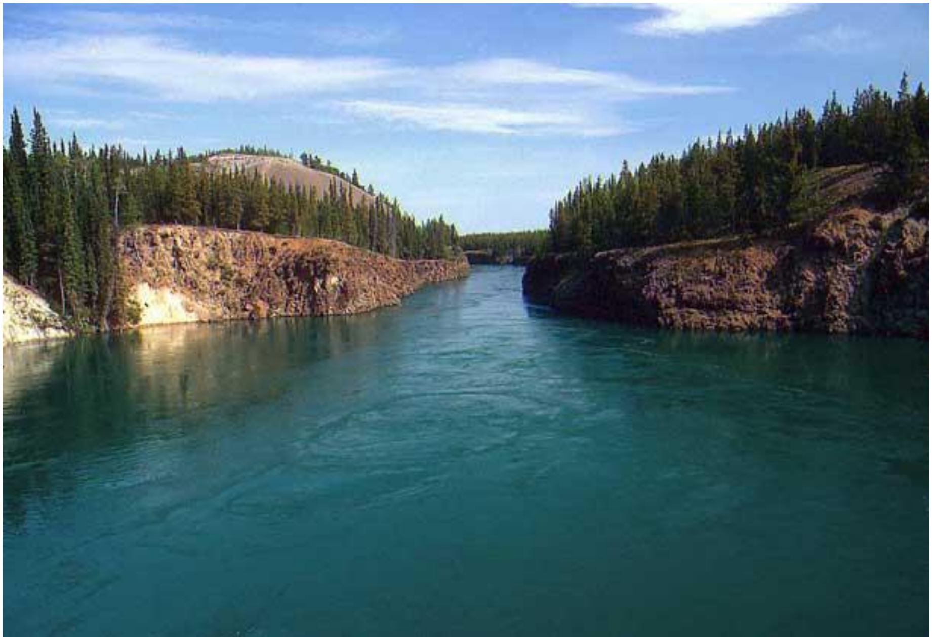
Yukon river, Canada