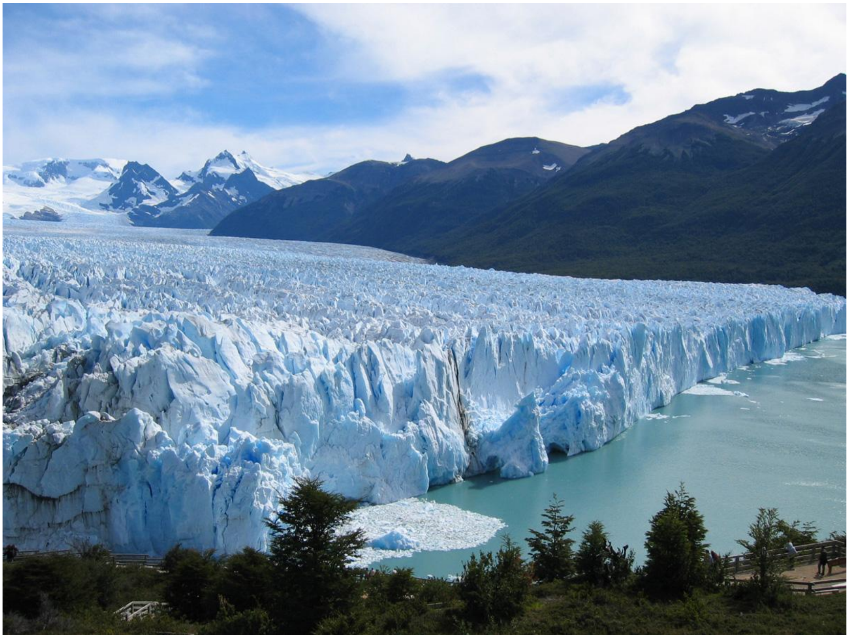
Perito Moreno Glacier, Argentina