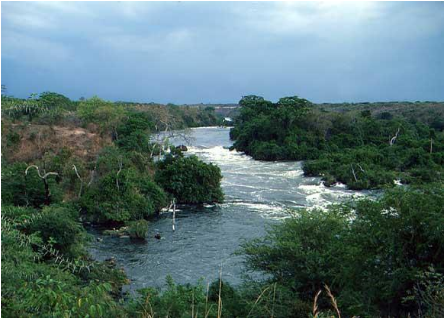
Victoria Nile river