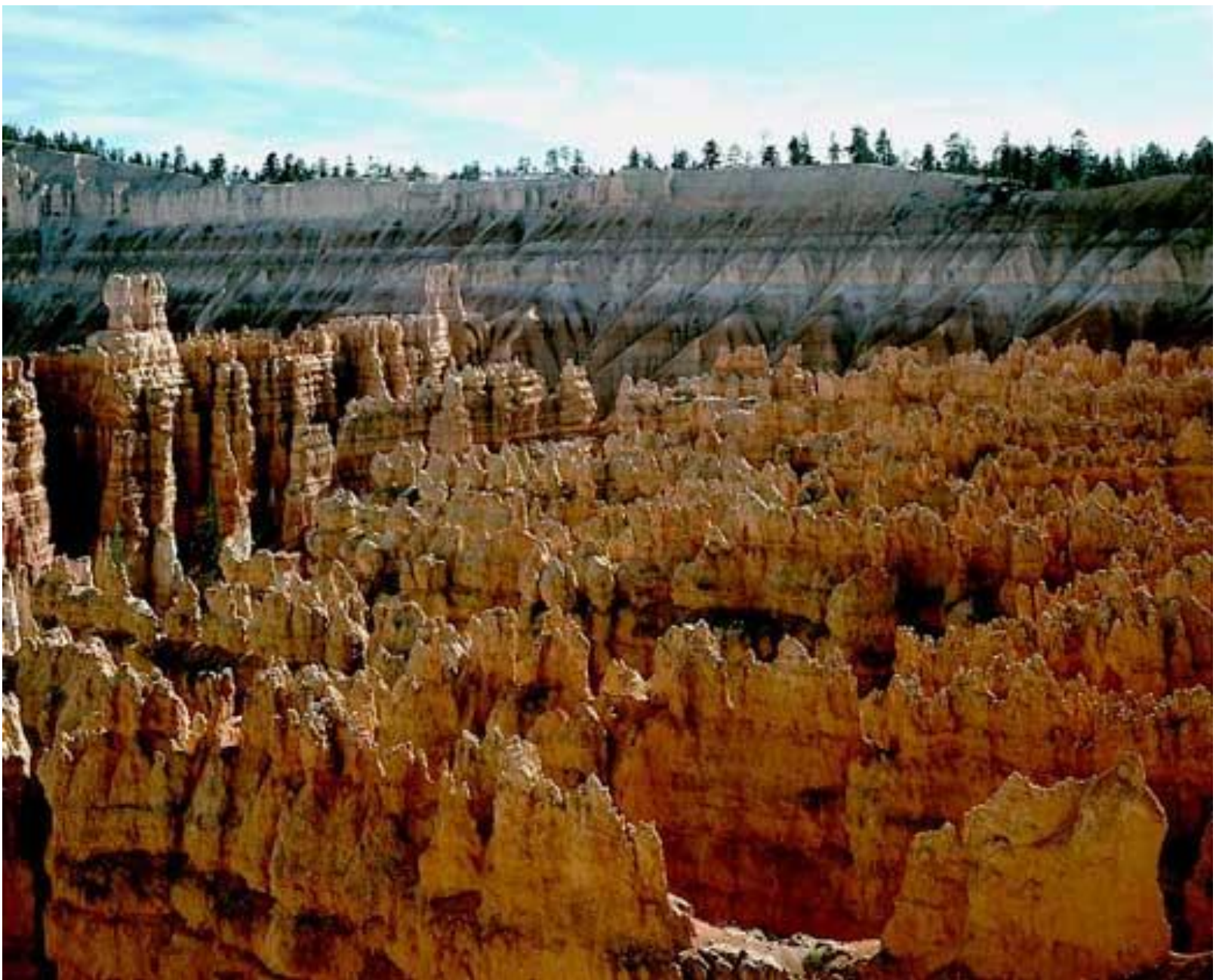
Sea laminated sediments in national park Bryce Canyon, USA