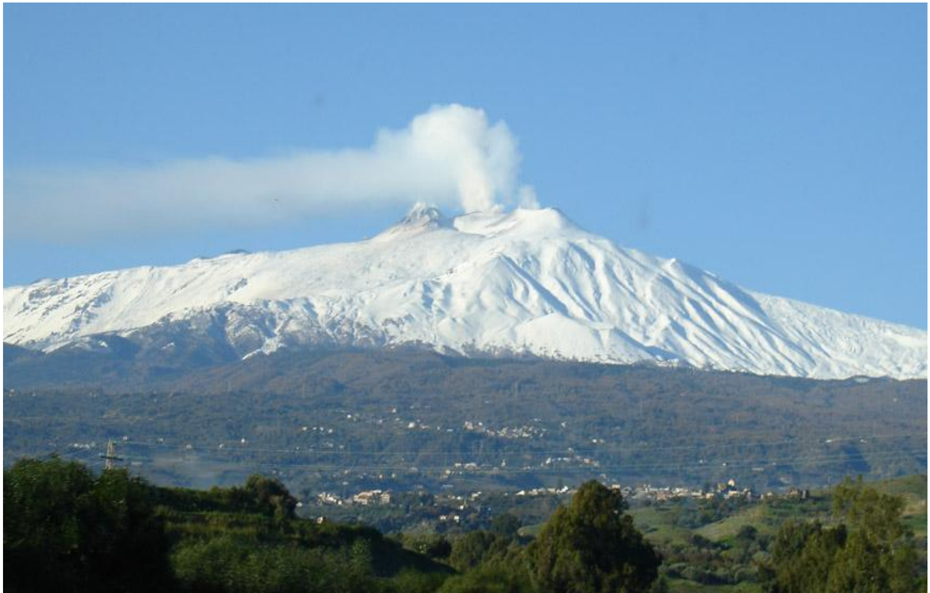
Eruption of Etna, Sicily