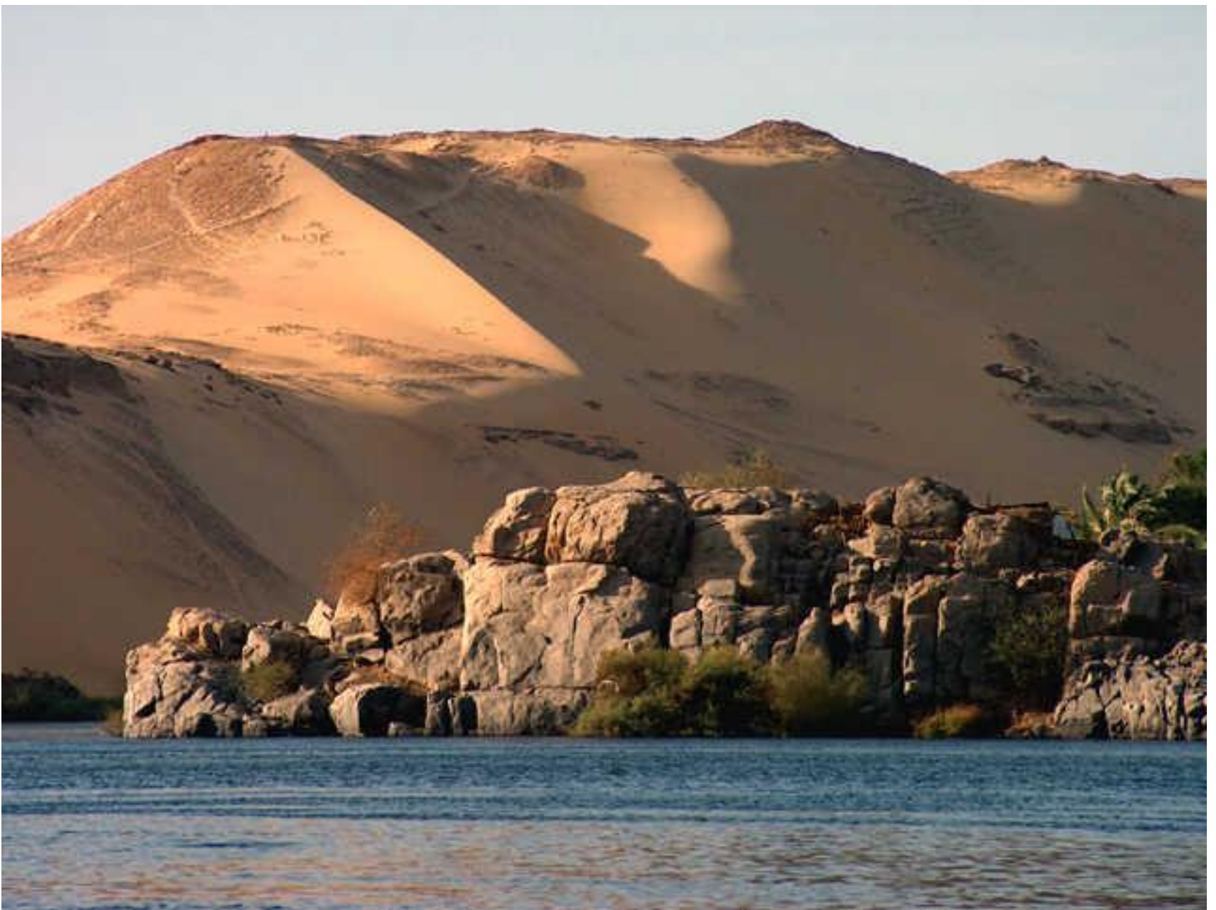
Nile band, Africa