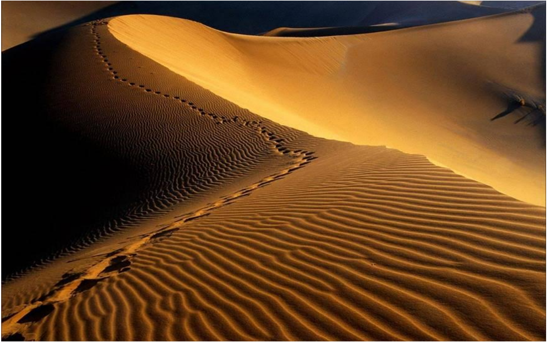
Sand dunes in Sahara, Africa