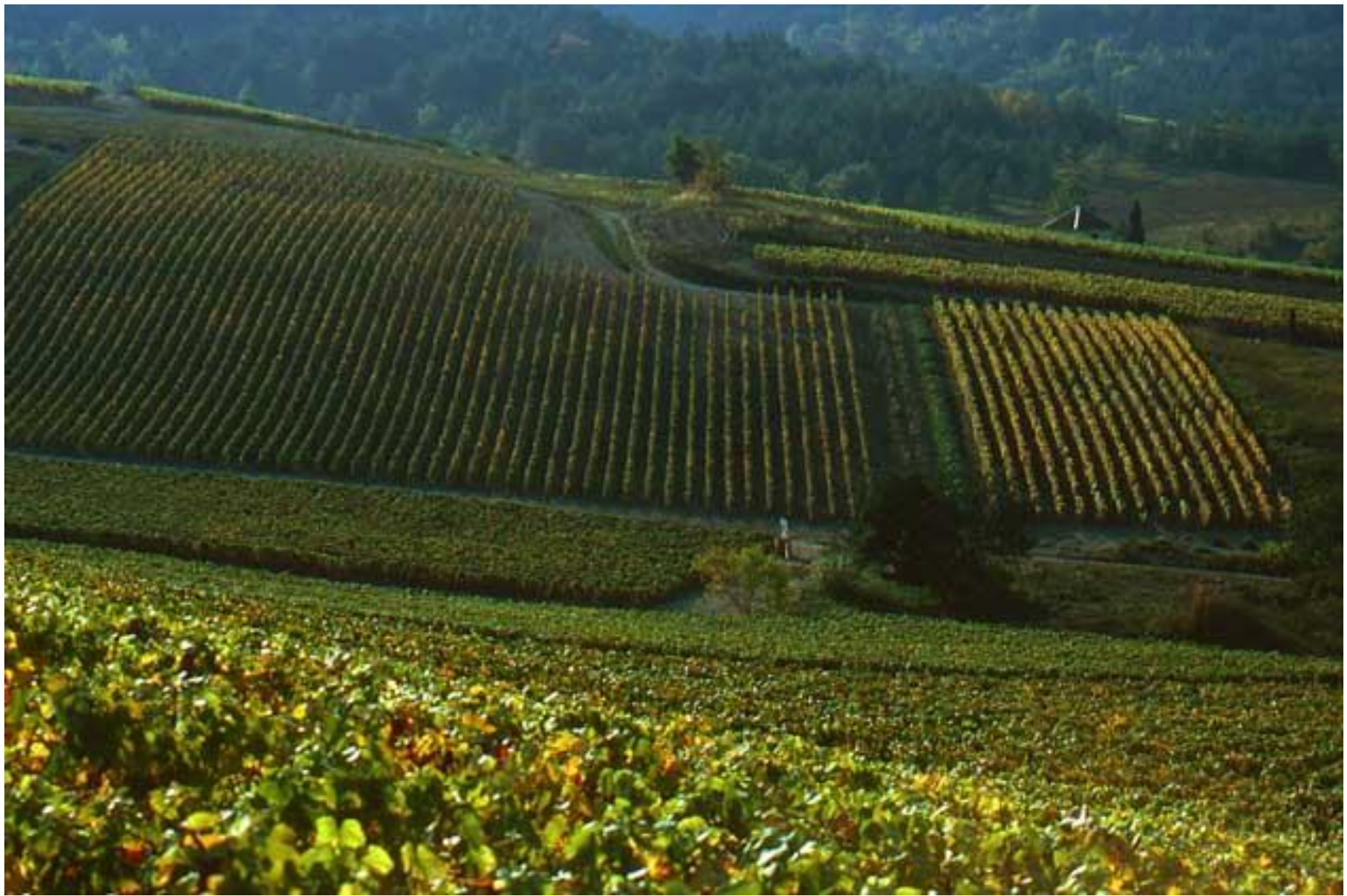
Vineyards of Champagne, France