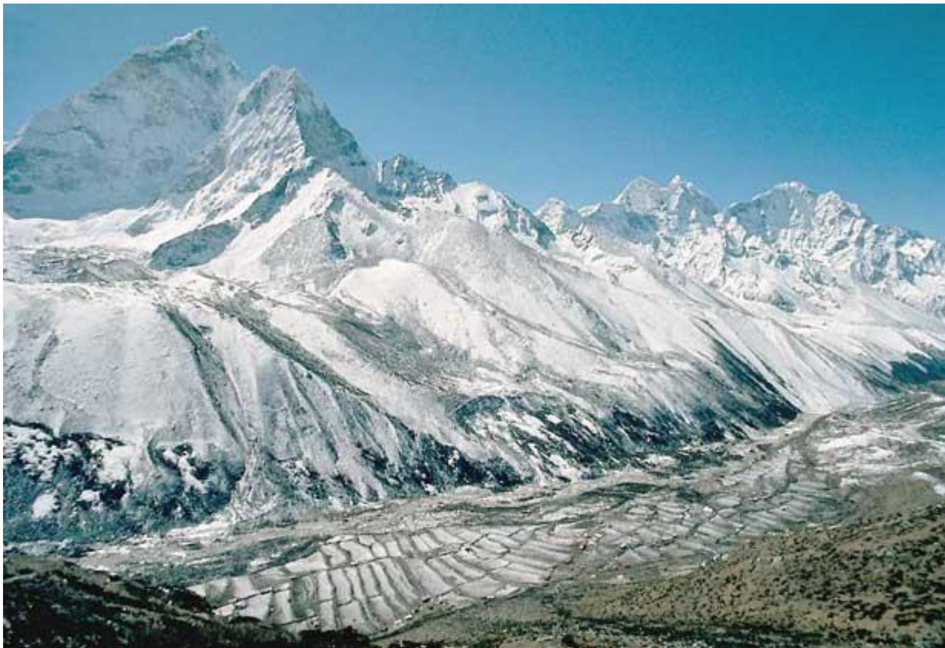
The Himalayas – the youngest mountains on the Earth