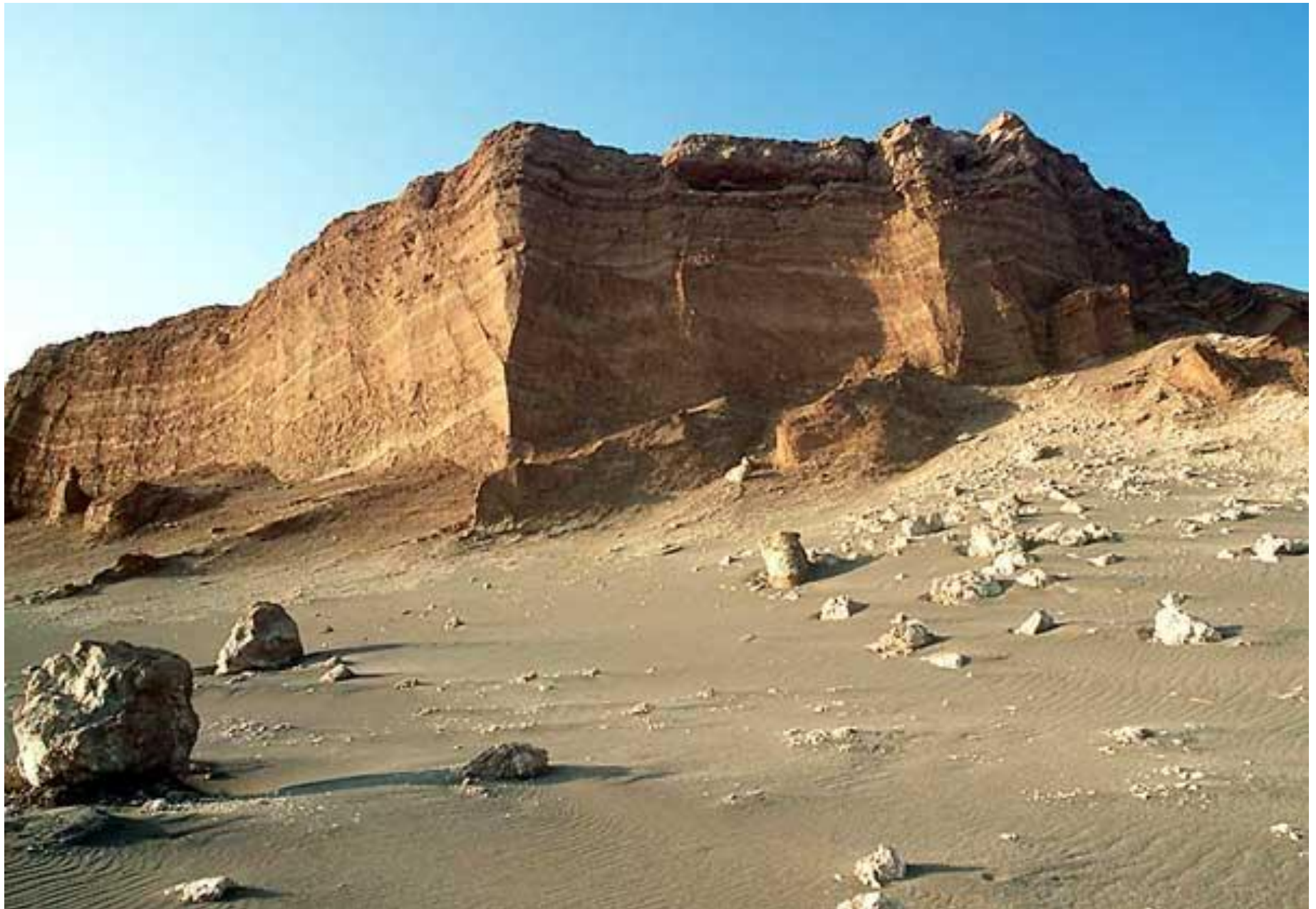
Atacama Desert, Chile