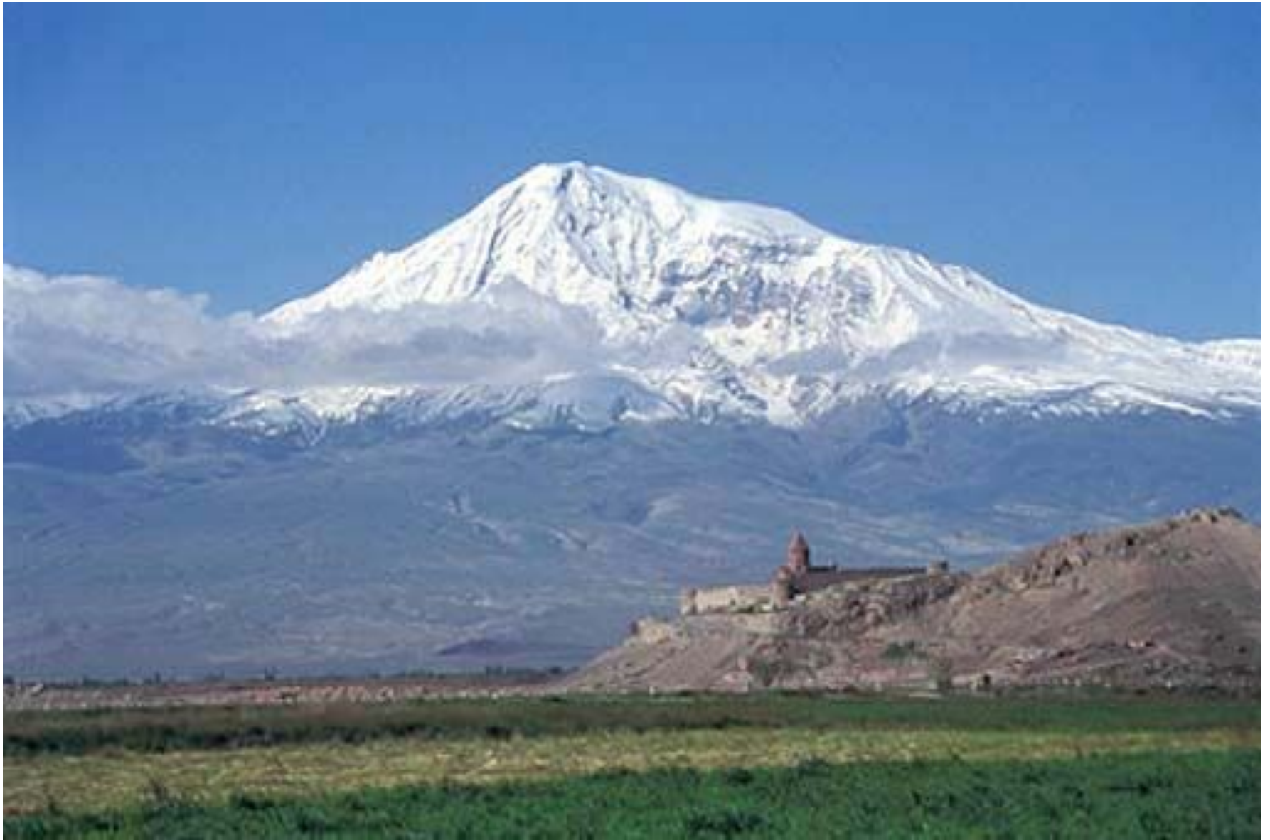
Ararat mountain, Turkey