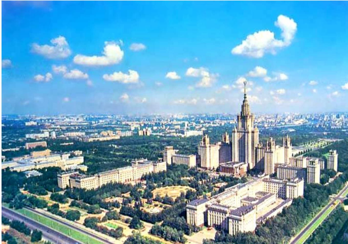
Today's 31-stored Main Building on the Sparrow Hills