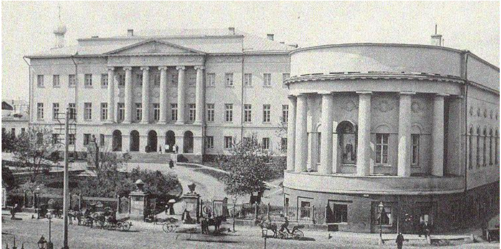
The Lecture-Halls building at the end of the XIX century