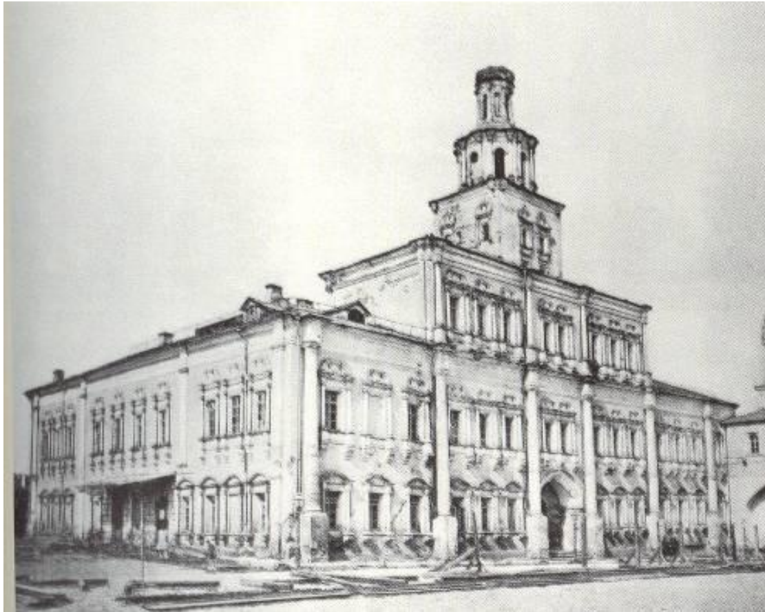
The Pharmaceutical House - the first building of Moscow University. XVIII century