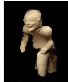
L2 Tolle seated figure, ceramic, n. 635 mm, 1st century BC-1st century AD (New York, Metropolitan Museum of Art, Gift of Gertrud A. Mellon, 1962, Accession ID: 1962.231); image © The Metropolitan Museum of Art

Visit Tools & Resources to access Grove Art Online Timelines of World Art , designed to provide an overview of important moments in art history and the visual arts. Covering six geographic regions across the globe from 30,000 BC to the present, these illustrated timelines highlight a range of movements and moments, from Pre-Columbian sculpture to Mughal architecture to Pop art.