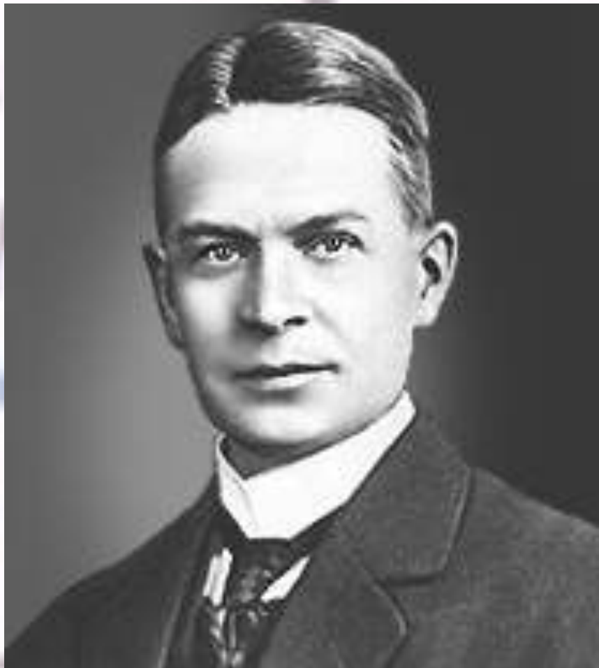
Frederic Soddy 1921 radio – chemist