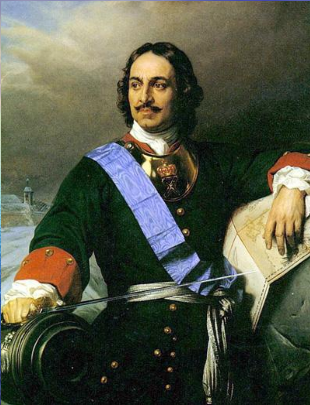
Peter the Great