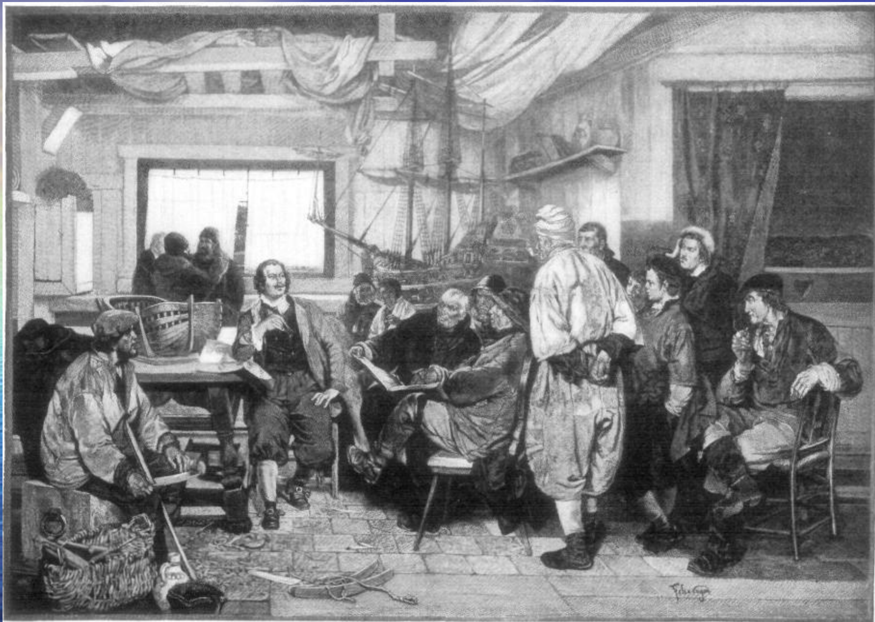
After the painting by Felix Cogen PETER THE GREAT LEARNS THE TRADE OF SHIP CARPENTRY AT ZAARDAM