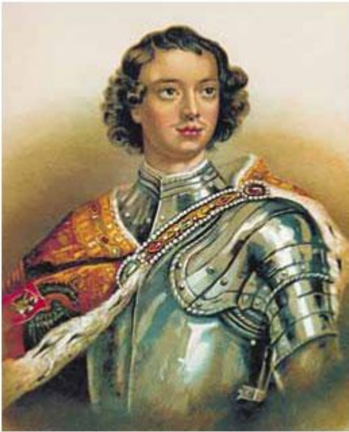
ПЕТР I Алексеевич (1672-1725), царствовал с 1682 г.

When Peter became King he made a lot of changes in Russia.