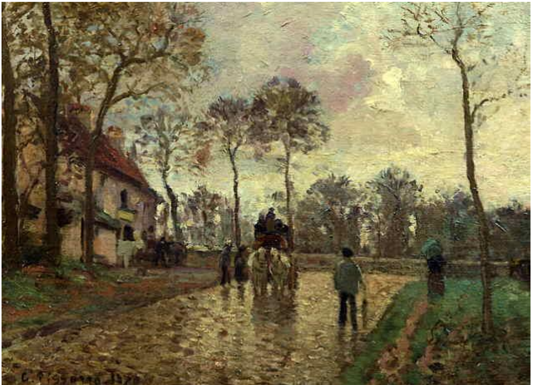
The stage coach at Louveciennes