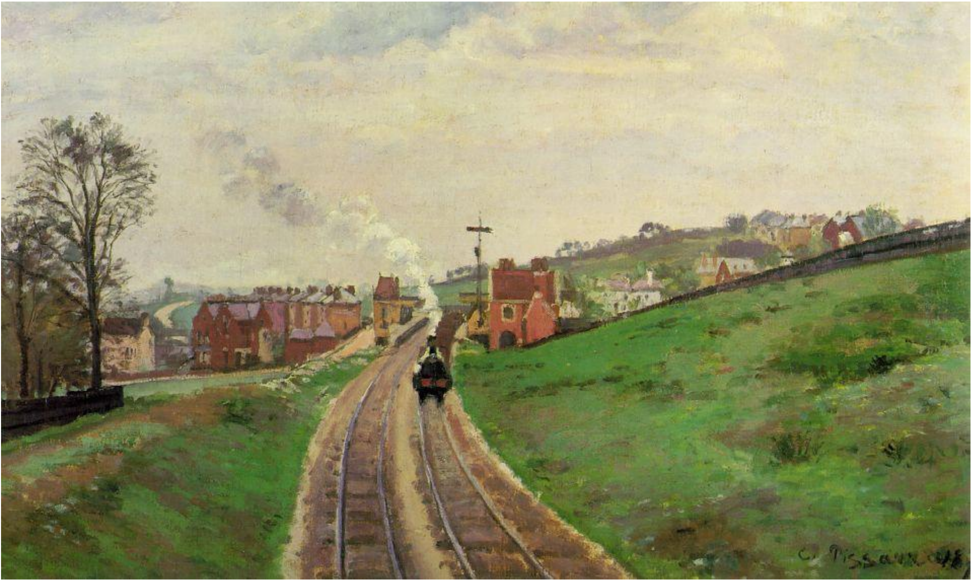
Lordship Lane Station