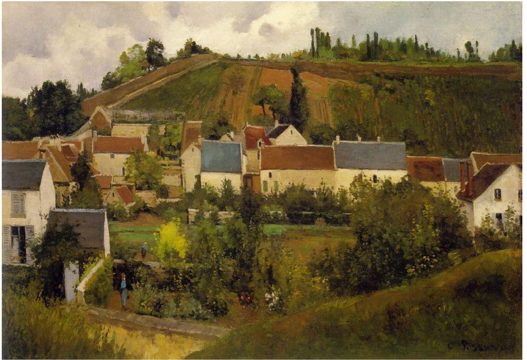
View of l'Hermitage, Jallais Hills, Pontoise