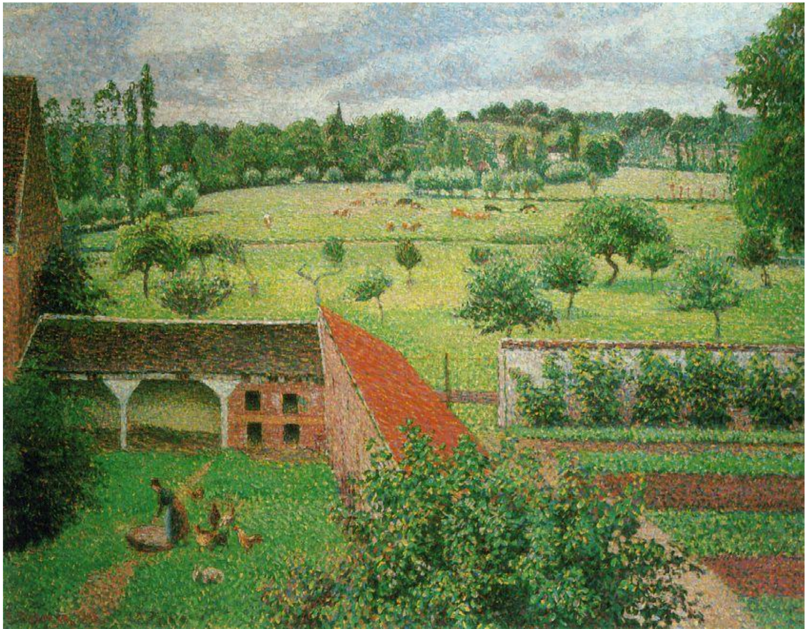
View from my window, Eragny