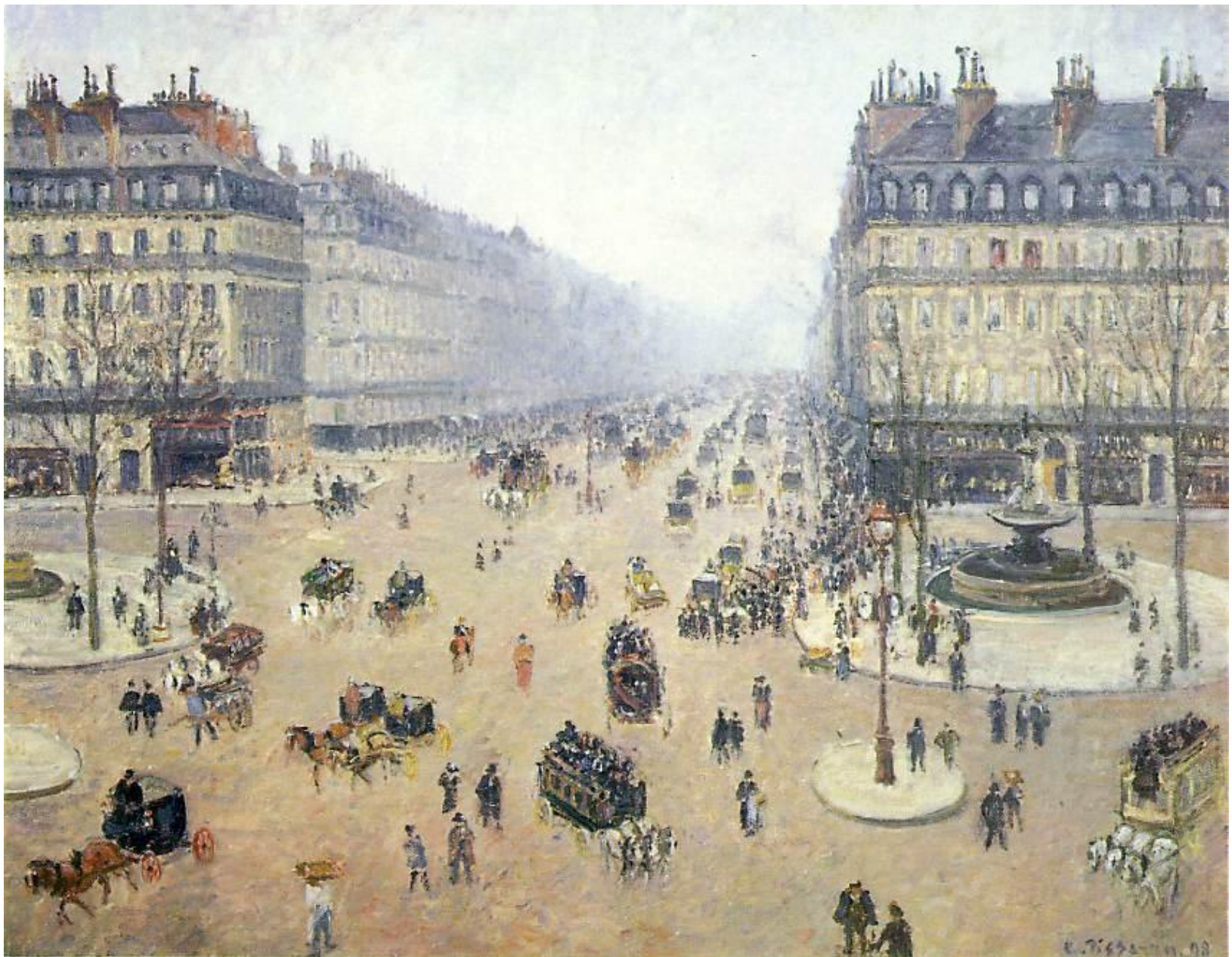
Avenue de l'Opera Place du Theatre Francais in a misty weather