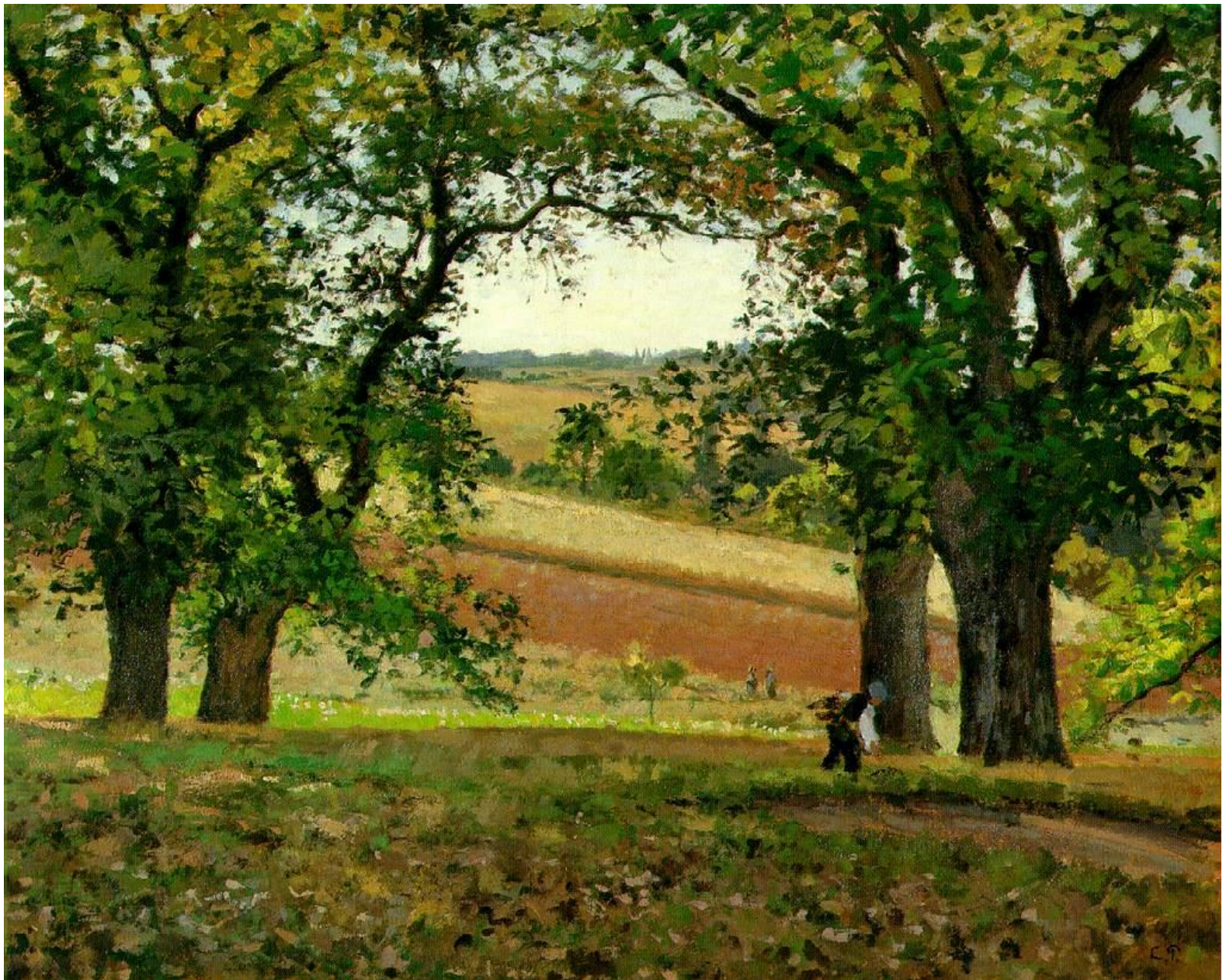
The chestnut trees at Osny