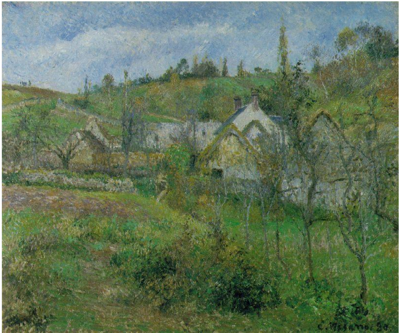
Le Valhermeil, near Pontoise