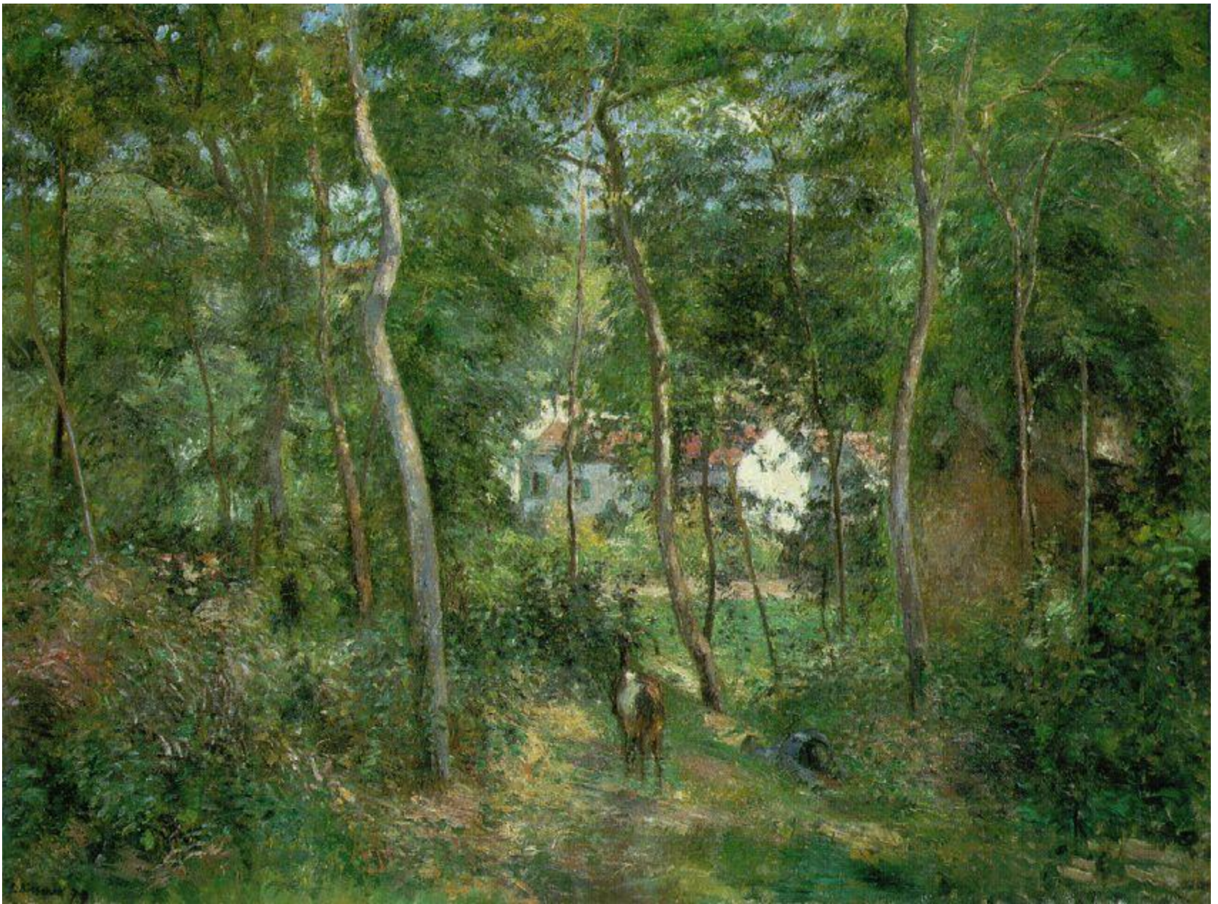
Edge of the woods or undergrowth in summer