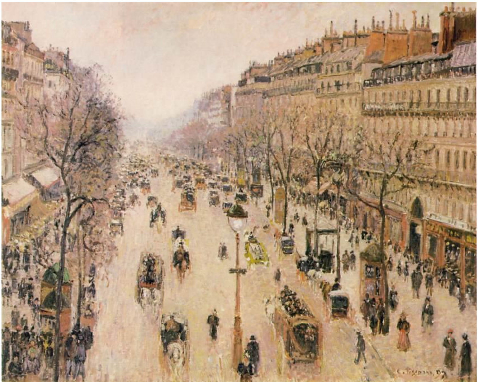
Boulevard Montmartre morning, grey weather