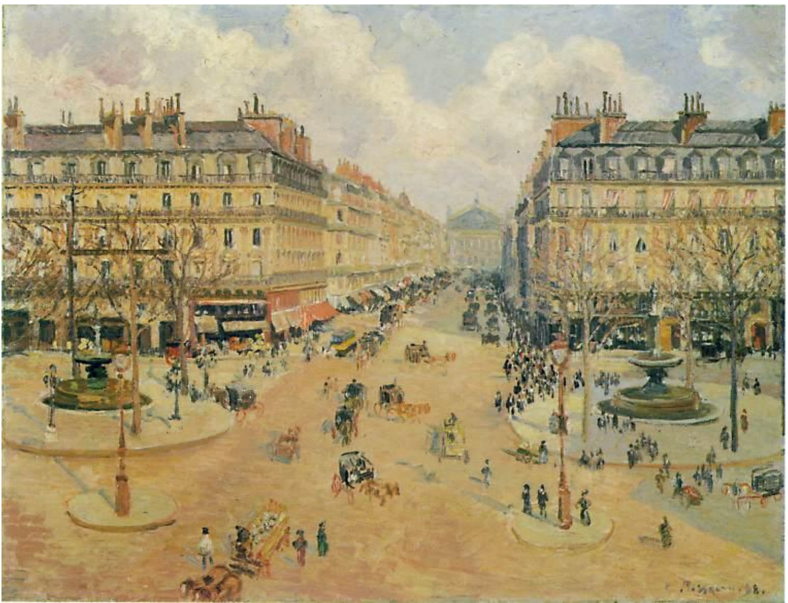
Avenue de l'Opera in a morning sunshine