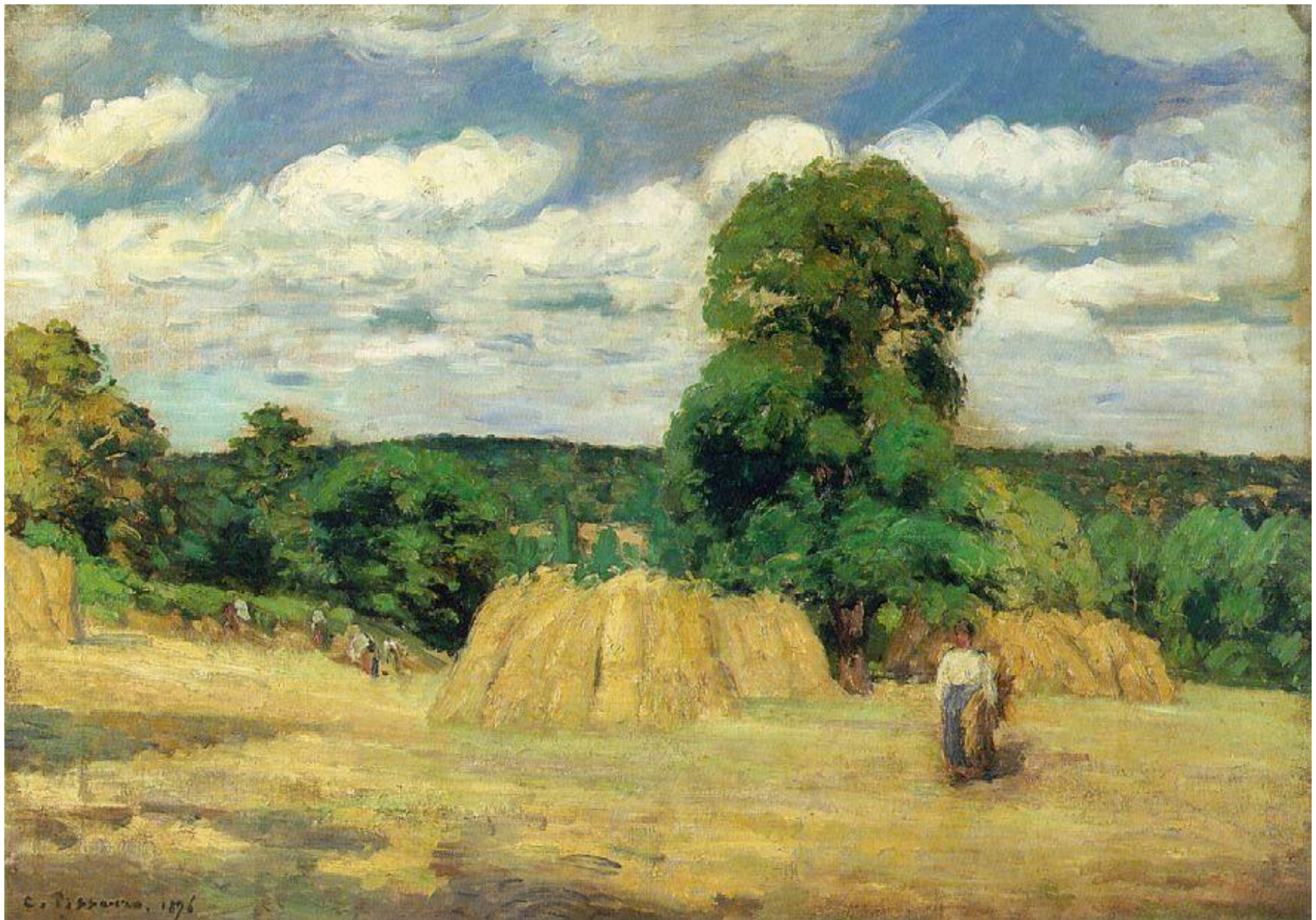
The harvest at Montfoucault