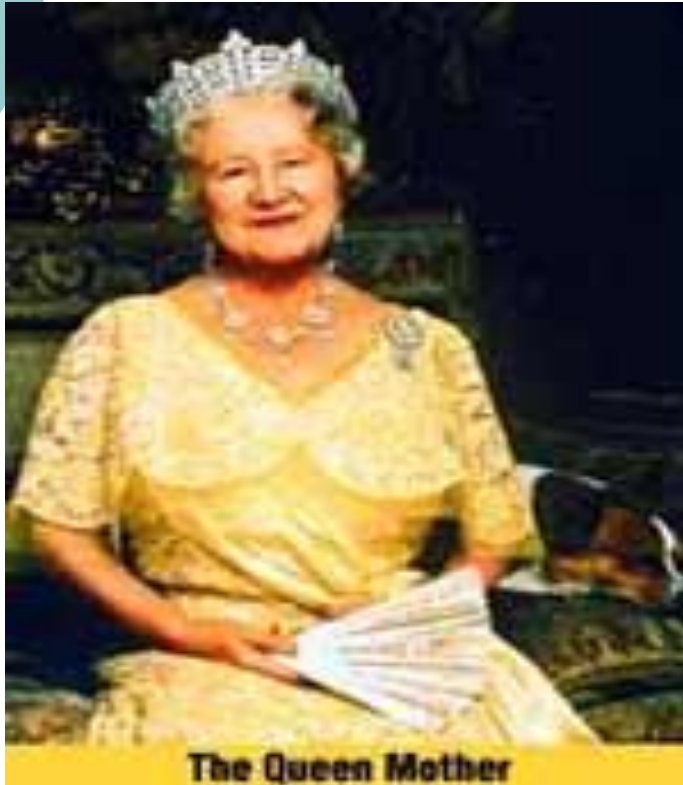
The Queen Mother