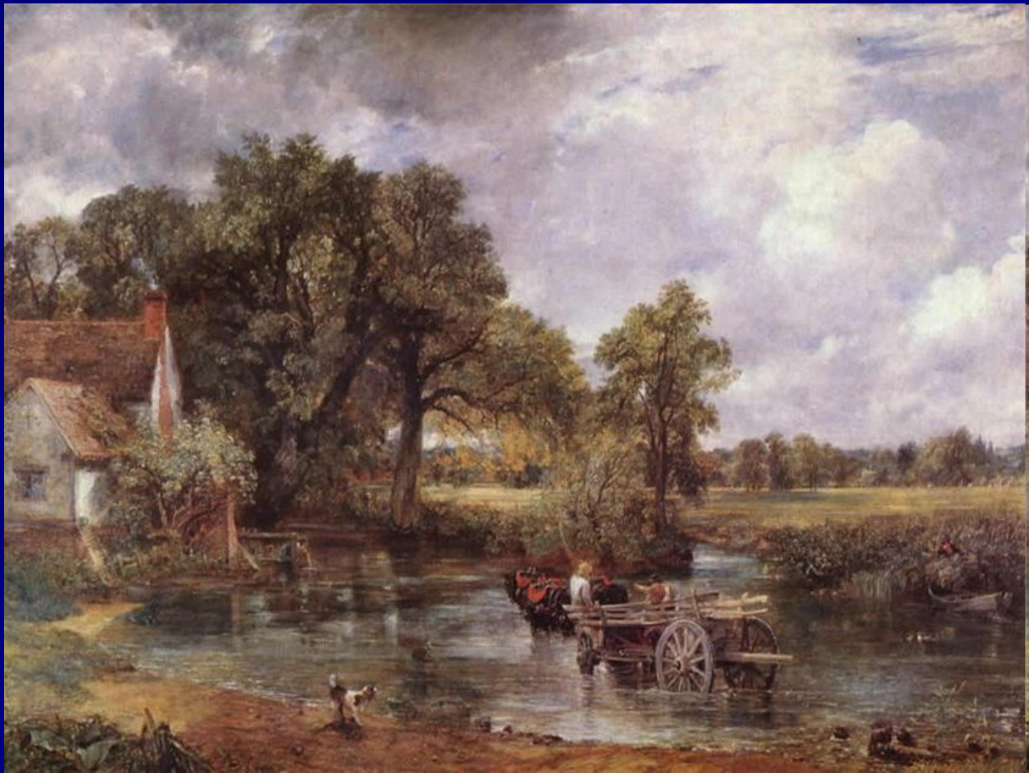
“The Hay Wain”, 1802