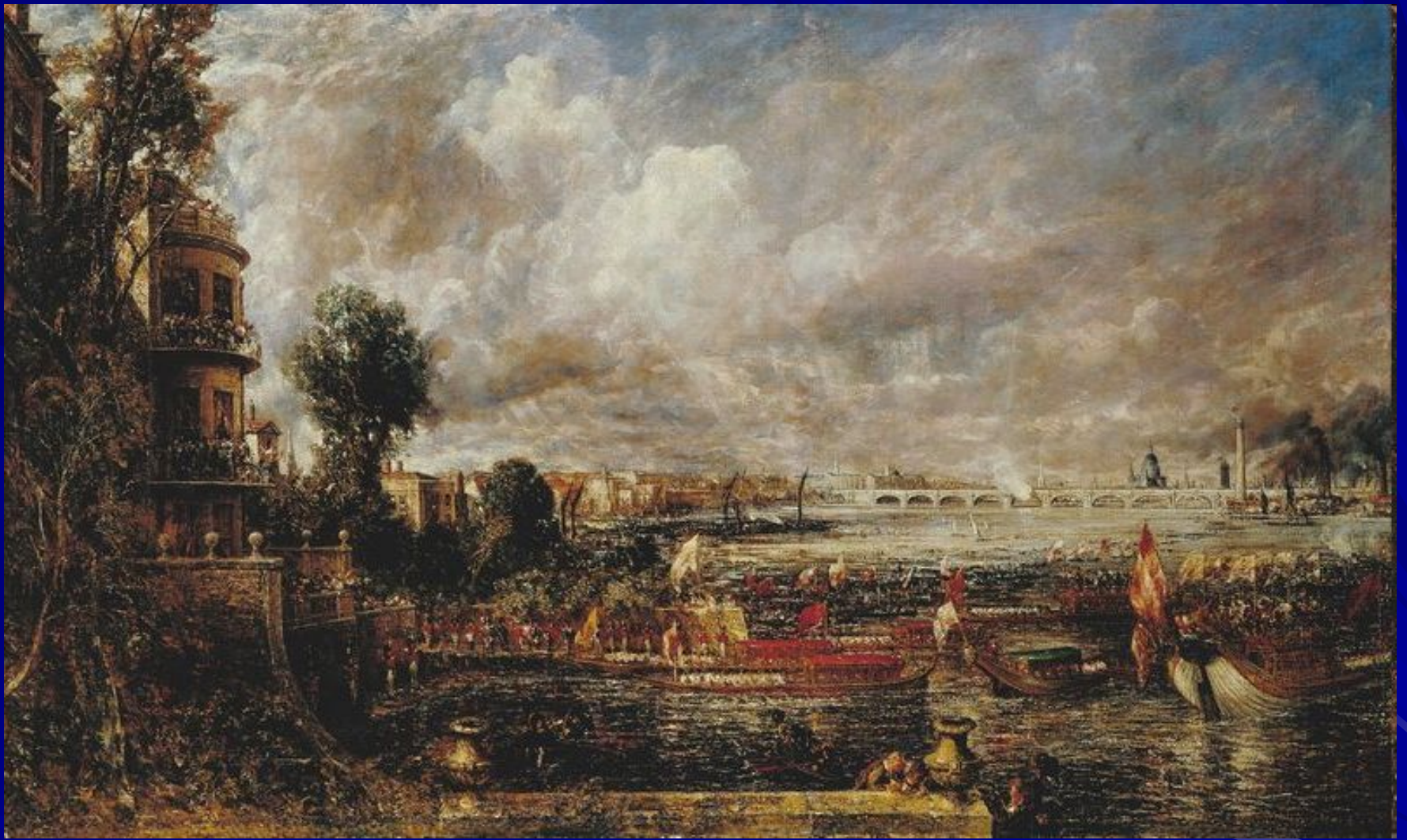
“Waterloo Bridge”, 1817