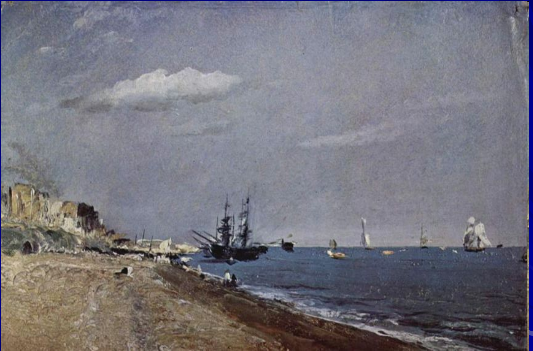
“Sea coast in Brighton”, 1824