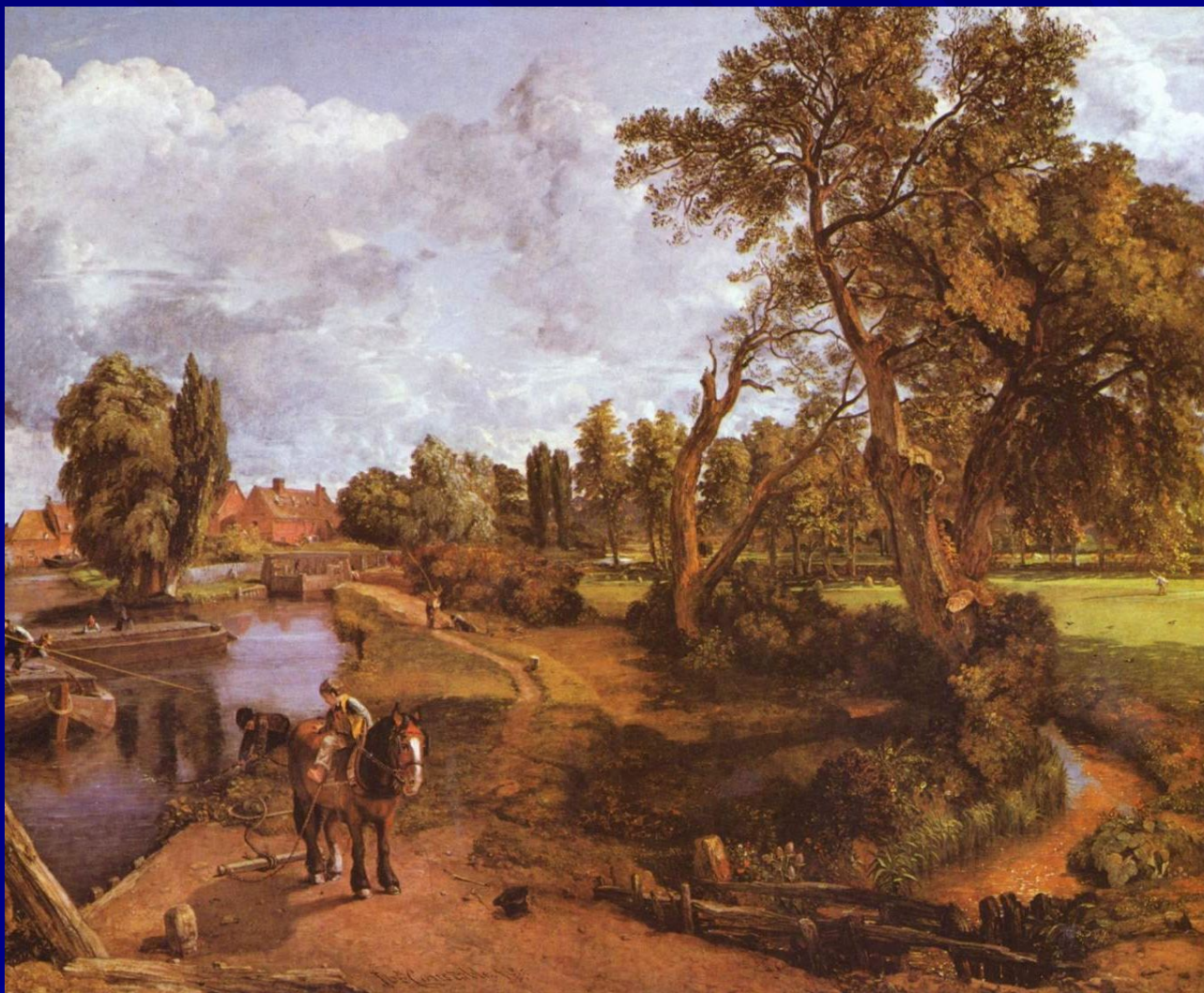
“Flat ford Mill”, 1817