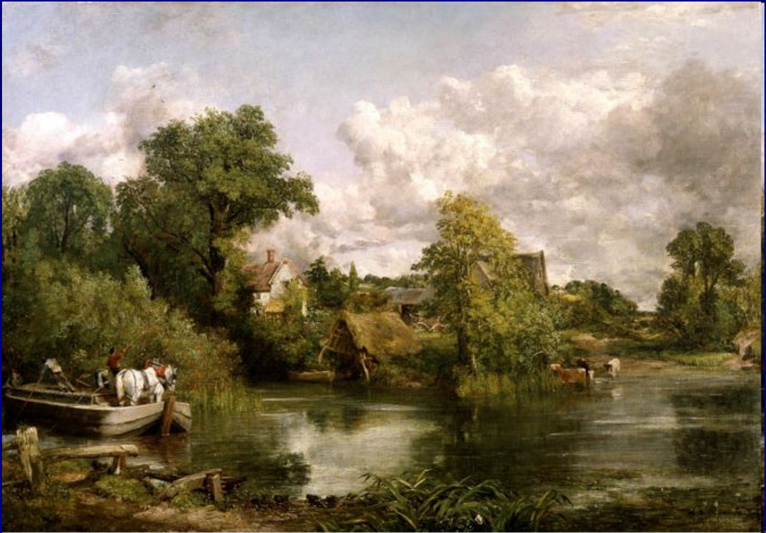
John Constable, The White Horse , 1819, Oil on canvas, 131.4 x 188.3 cm, Copyright The Frick Collection, New York