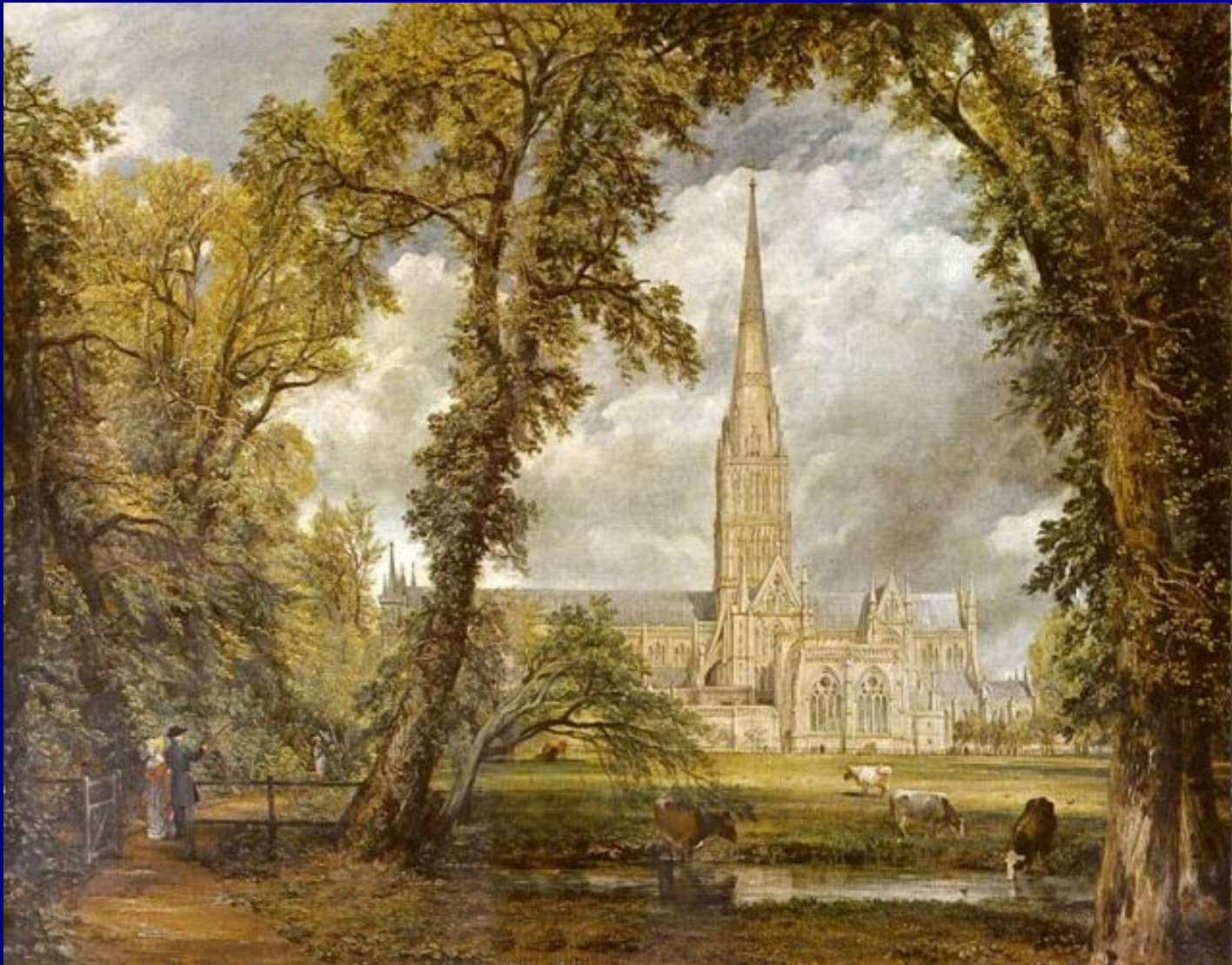
“View of a cathedral in Salisbury”, 1823