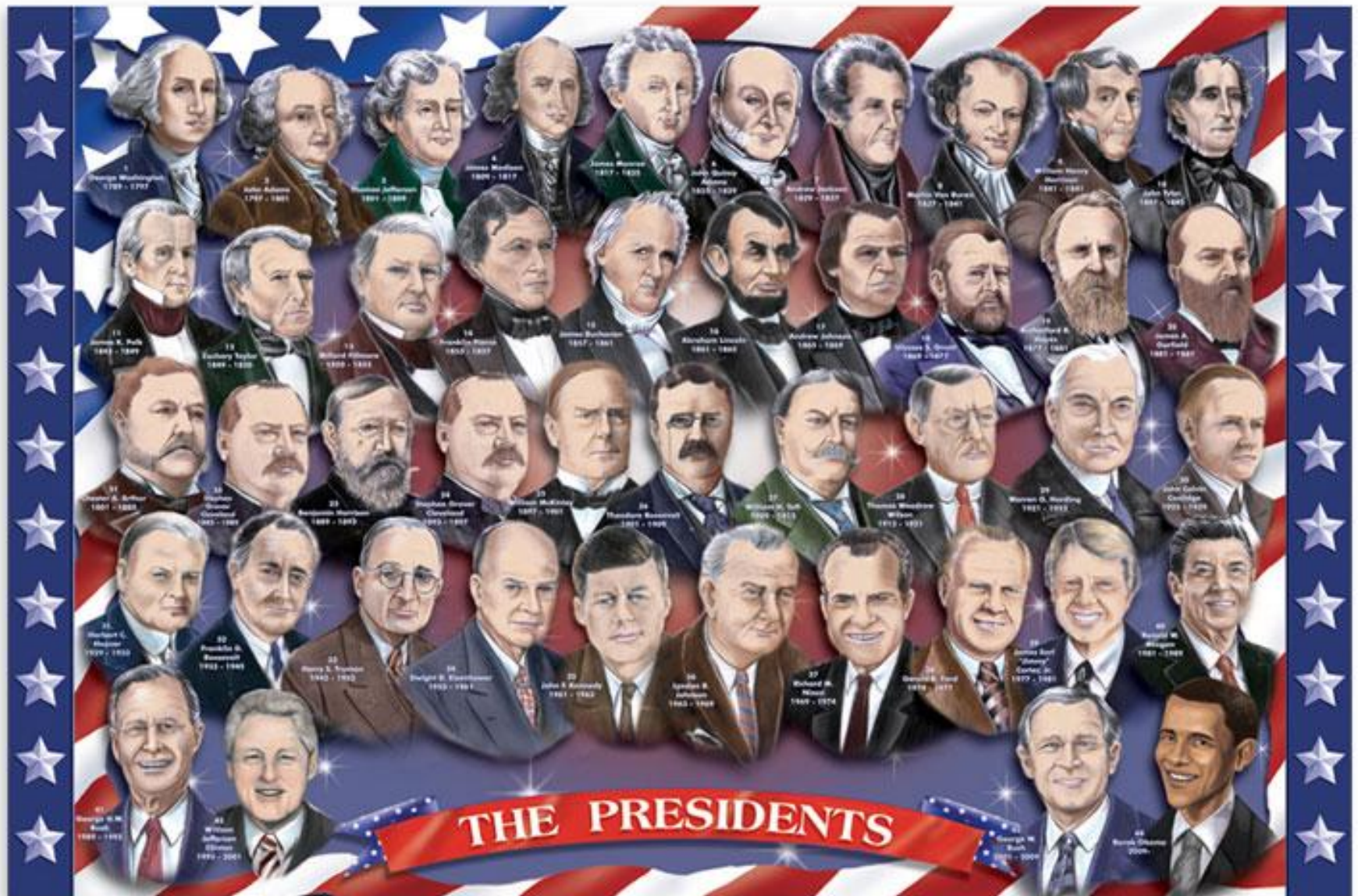
1 George Washington 1789 - 1797