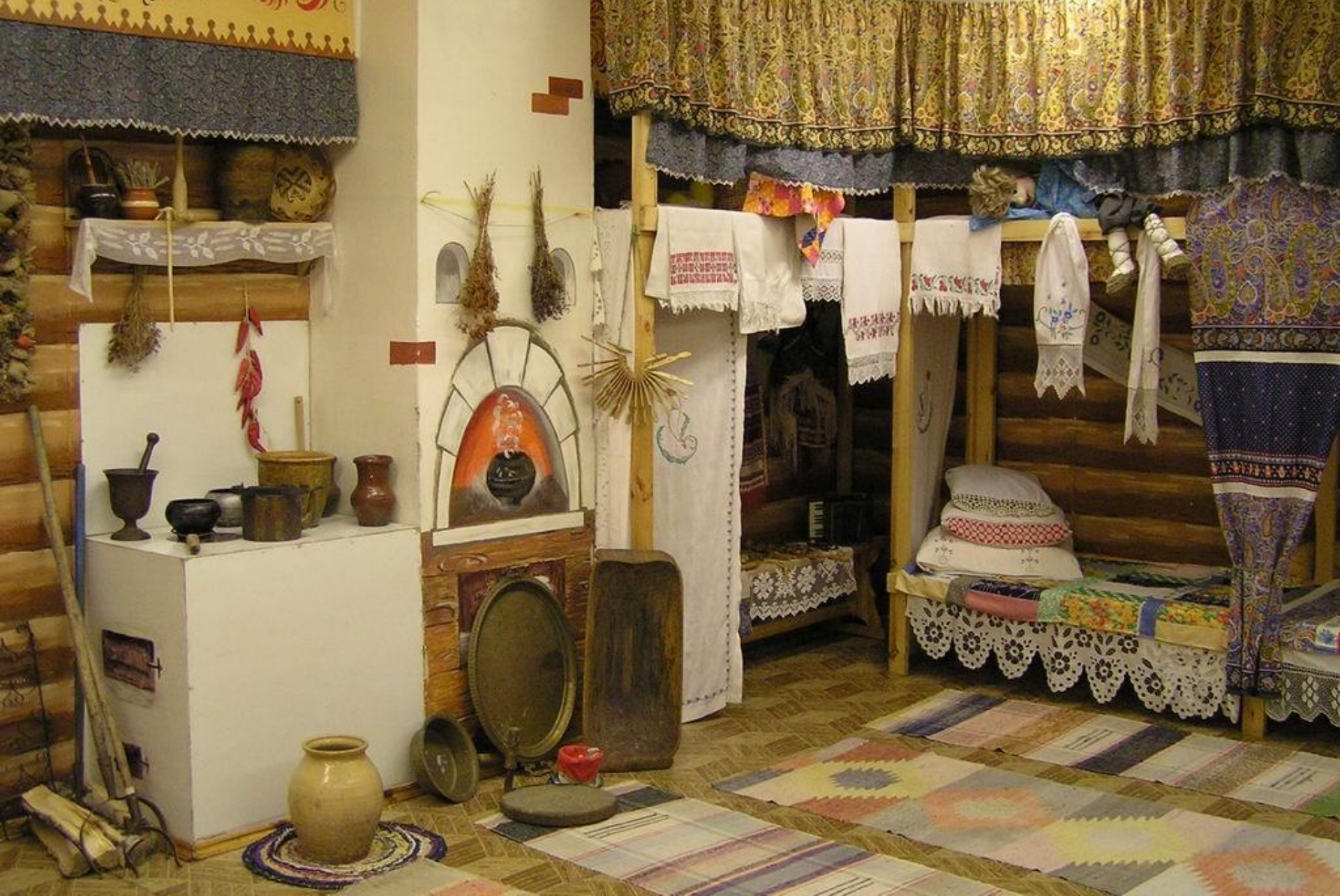
INSIDE A RUSSIAN HOUSE