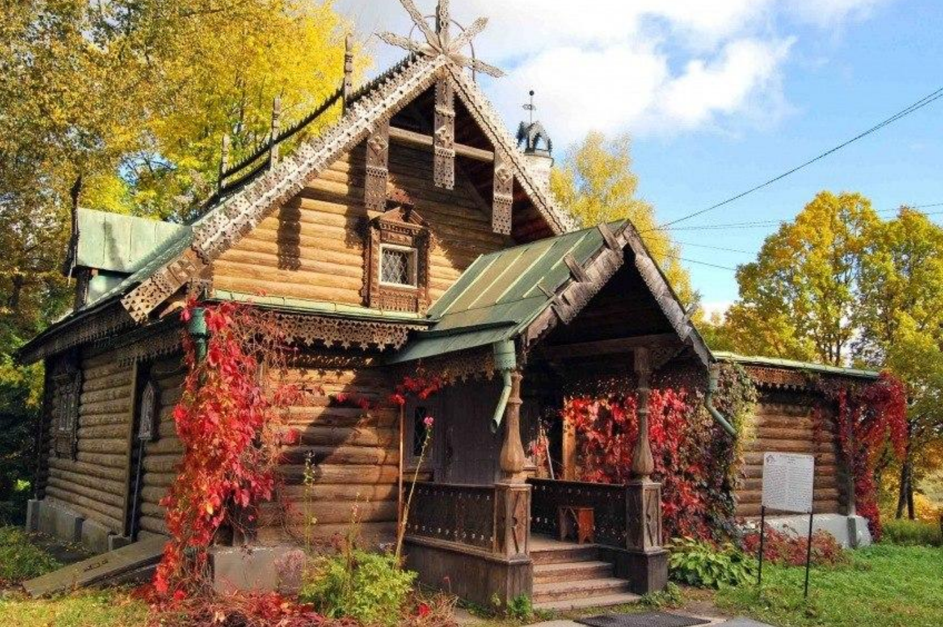
TRADITIONAL RUSSIAN HOUSE