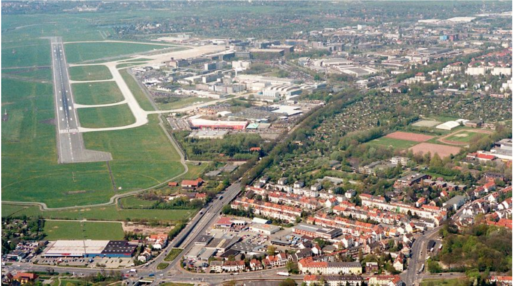
City Airport Bremen EDDW / BRE