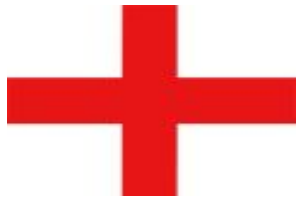
St George's Flag

Many images associated with England are found on souvenirs. The three national symbols of England are the St. George's cross (usually seen as a flag), the red rose and the Three Lions crest (usually seen as a badge).