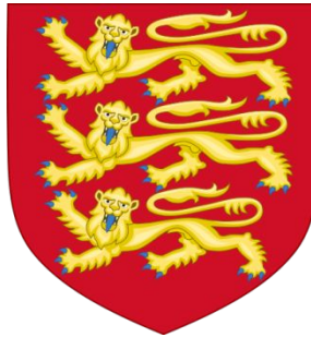
Three Lions Emblem