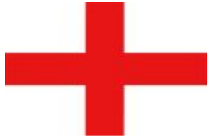
St George's Flag

Many images associated with England are found on souvenirs. The three national symbols of England are the St. George's cross (usually seen as a flag), the red rose and the Three Lions crest (usually seen as a badge).