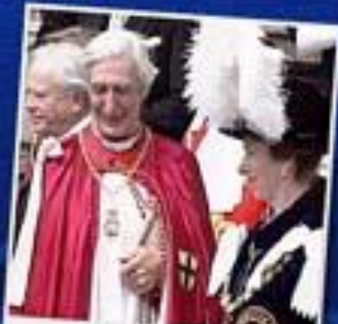
ROYAL GARTER PROCESSION