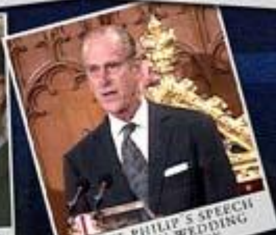
PRINCE PHILIP'S SPEECH AT GOLDEN WEDDING ANNIVERSARY