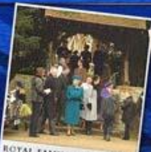
ROYAL FAMILY AT CHURCH, SANDRINGHAM