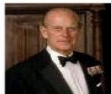
Prince Philip Duke of Edinburgh b. 10 Jun 1921