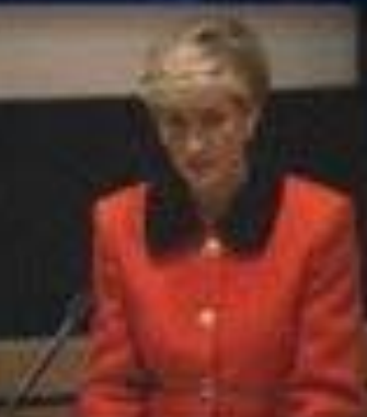
Diana Princess of Wales