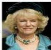
Camilla Duchess of Cornwall b. 17 July 1947