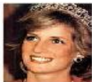
Diana Princess of Wales b. 1 Jul 1961 d. 31 Aug 1997

Married 29 Jul 1981 Divorced 28 Aug 1996