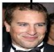
Peter Phillips b. 15 Nov 1977