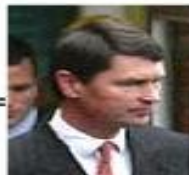
Timothy Laurence b. 1 Mar 1955