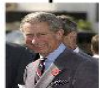
Prince Charles Prince of Wales b. 14 Nov 1948