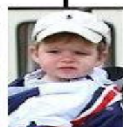
Viscount Severn b. 17 Dec 2007