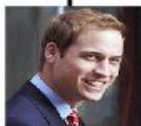
Prince William b. 21 Jun 1982