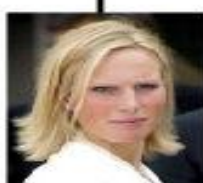
Zara Phillips b. 15 May 1981