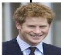
Prince Henry (Harry) b. 15 Sep 1984