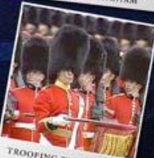
TROOPING THE COLOUR