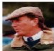
Mark Phillips b. 22 Sep 1948