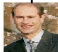
Prince Edward Earl of Wessex b. 10 Mar 1964