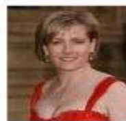
Sophie Countess of Wessex b. 20 Jan 1965