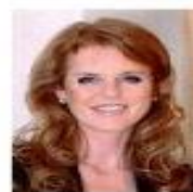
Sarah Duchess of York b. 15 Oct 1959

Married 23 Jul 1986 Divorced 30 May 1996