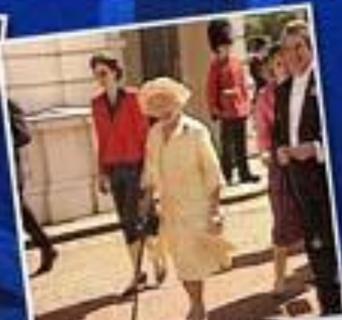
QUEEN MOTHER'S BIRTHDAY