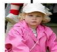
Lady Louise b. 8 Nov 2003