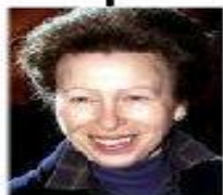
Princess Anne b. 15 Aug 1950

Married 14 Nov 1973 Divorced 28 Apr 1992