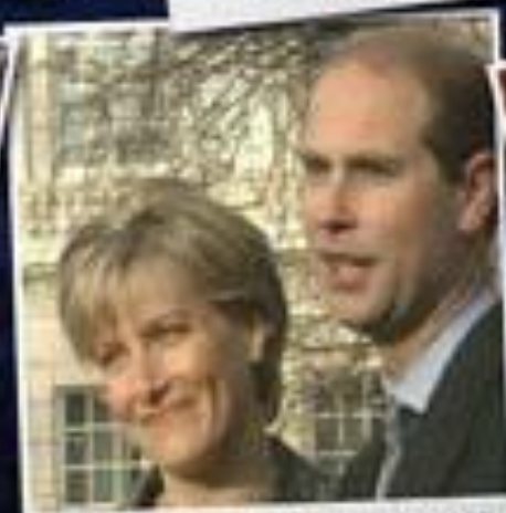
PRINCE EDWARD & SOPHIE RHYS-JONES ENGAGEMENT