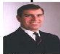
Prince Andrew Duke of York b. 19 Feb 1960

Married 23 Jul 1986 Divorced 30 May 1996