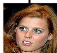
Princess Beatrice b. 8 Aug 1988