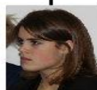
Princess Eugenie b. 23 Mar 1990