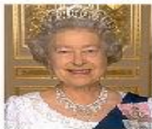
HM Queen Elizabeth II b. 21 Apr 1926