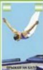
ПРЫЖКИ НА БАТУ