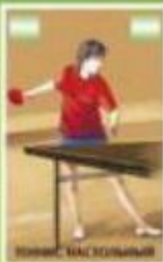
ТЕННИС НА СТОЛОВОМ