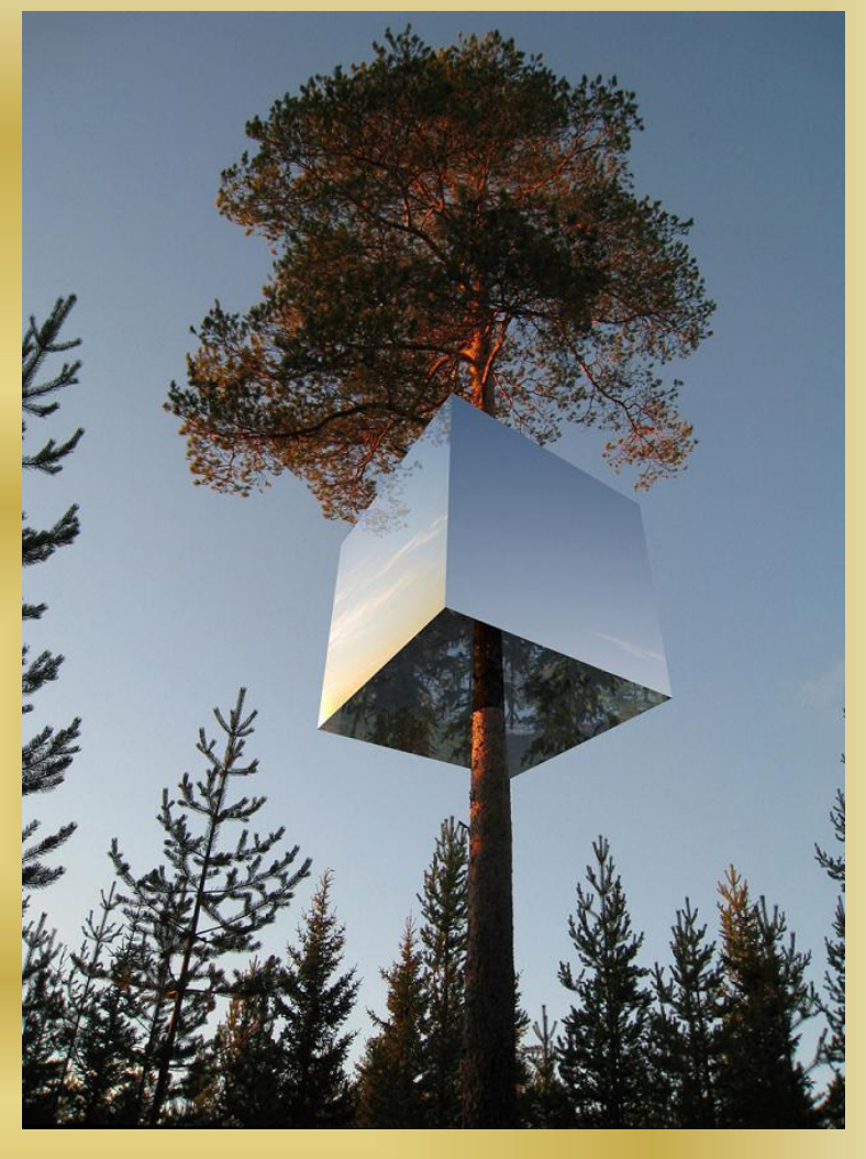
Cost: $409 USD/night (single) – $592 USD/night (double)