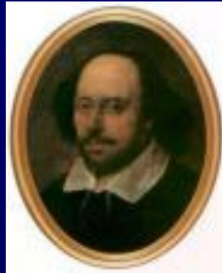
W. Shakespeare (