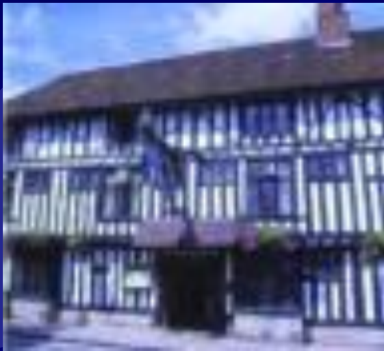
Stratford Upon Avon