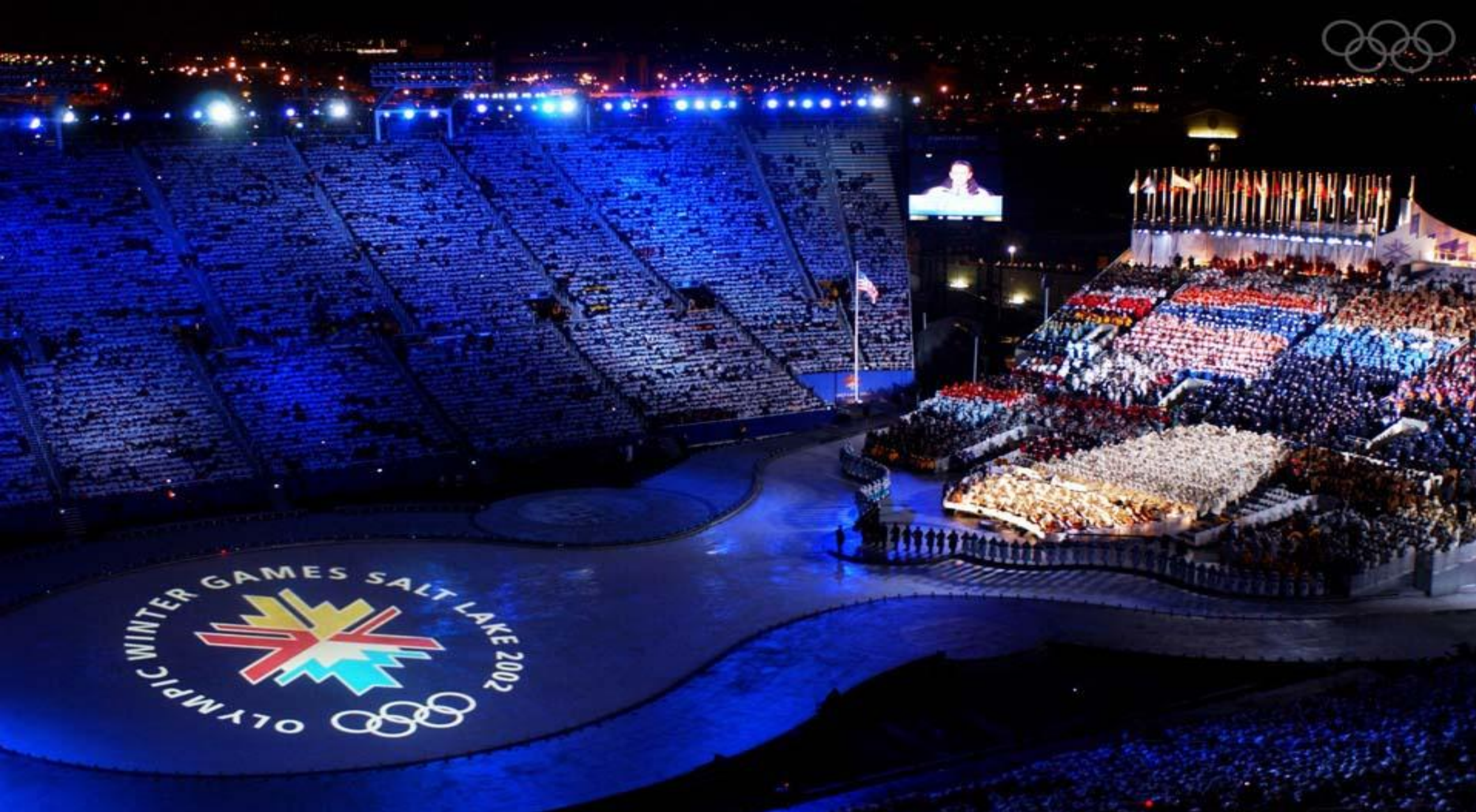
Salt Lake City 2002-Ceremonie d'ouverture-le logo de Salt Lake 2002.