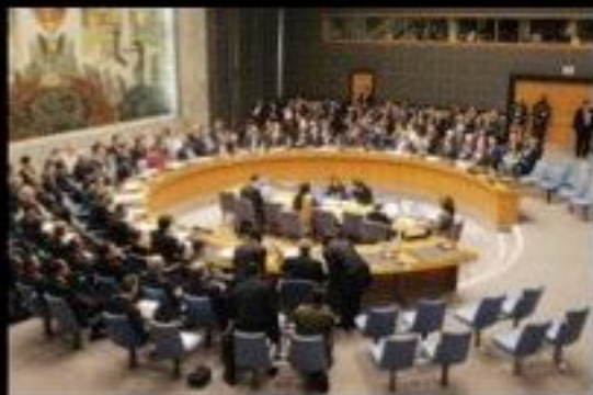
What my Family Thinks I Do