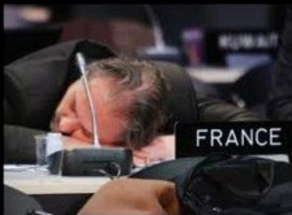
What NGOs Think I Do