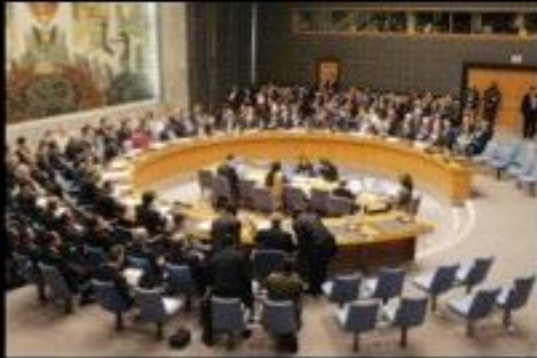
What my Family Thinks I Do