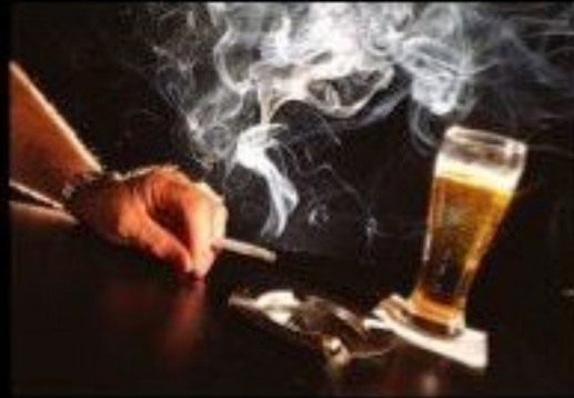
What my Friends Think I Do