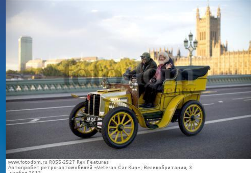
Автопробег ретро-автомобилей «Veteran Car Run», Великобритания, 3 ноября 2013.