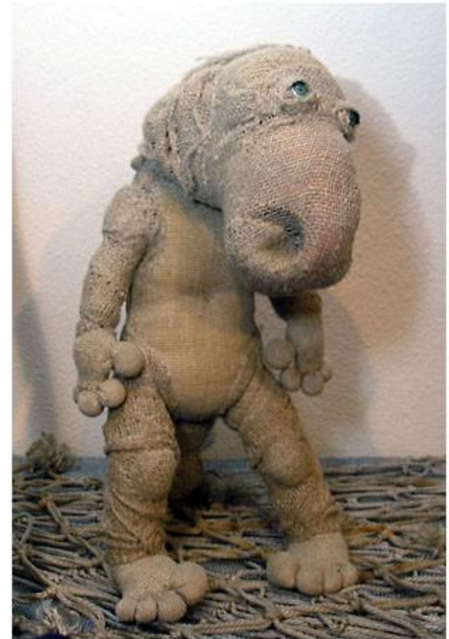
The Spirit of the Onega Lake