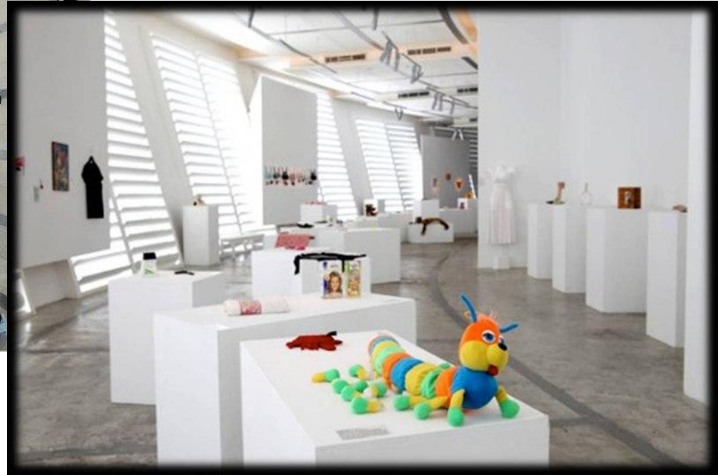
Museum of Broken Relationships (Zagreb)