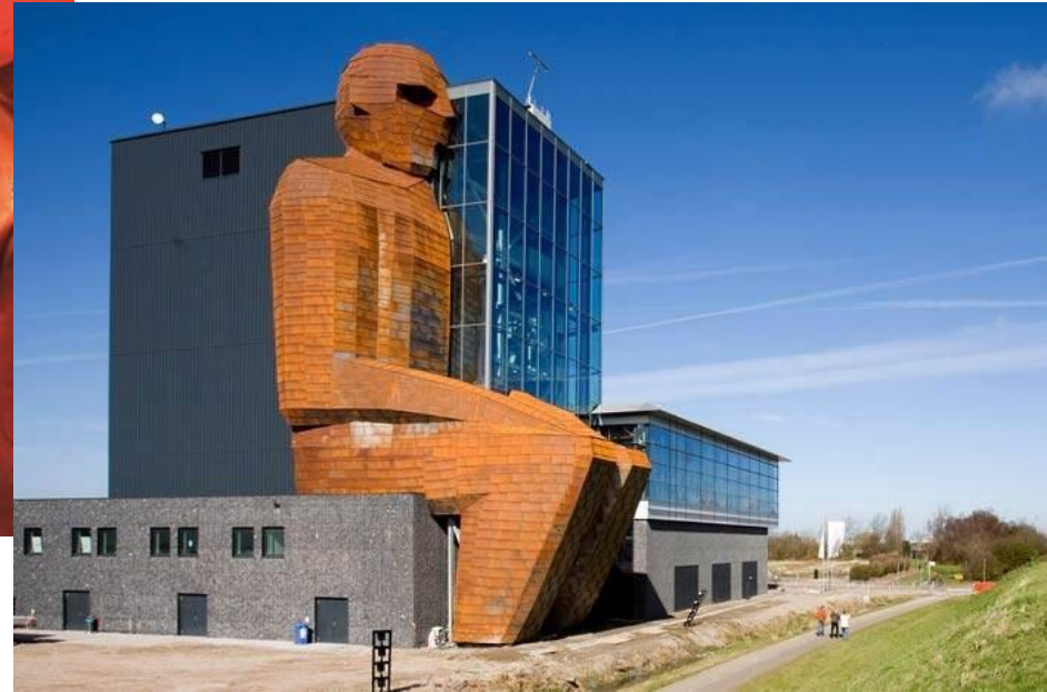
Museum of Human body (Netherlands)