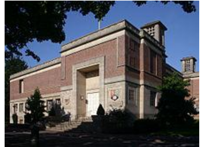
Barber Institute of Fine Arts